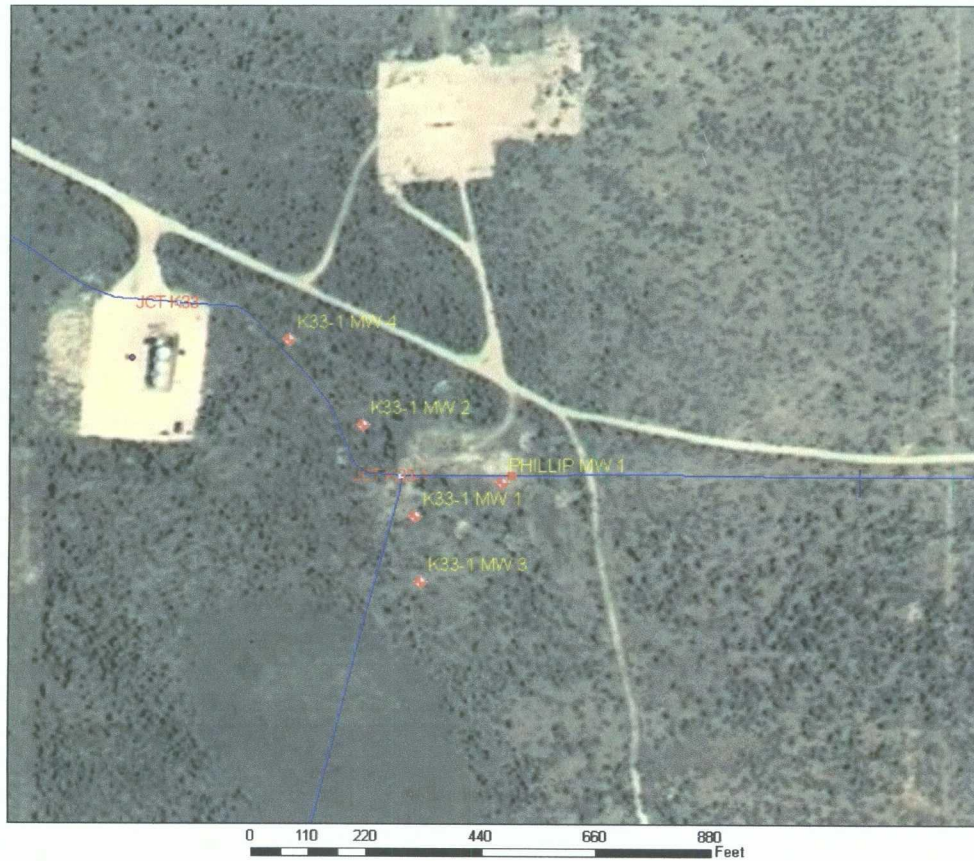
Figure 1 – Locations of Sarah Phillips and K-33-1 sites.