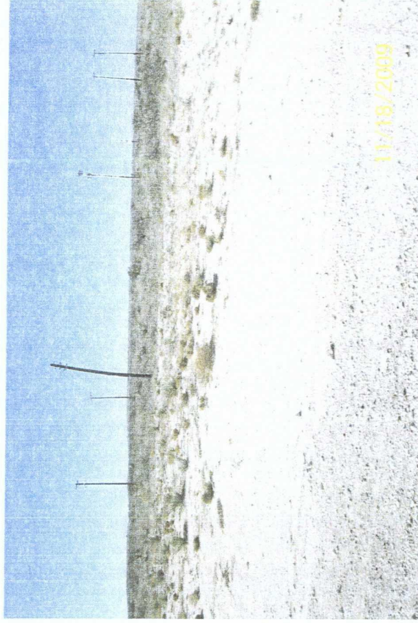
current vegetation at the former junction box site