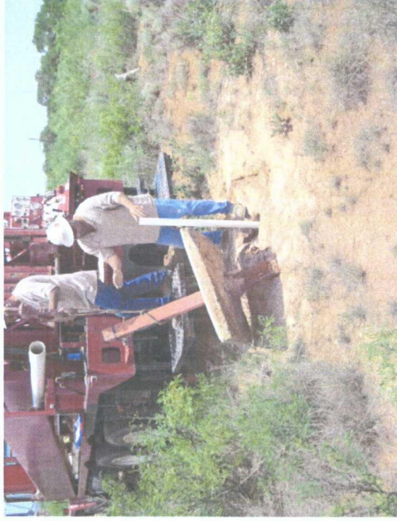
Pulling the monitor wells