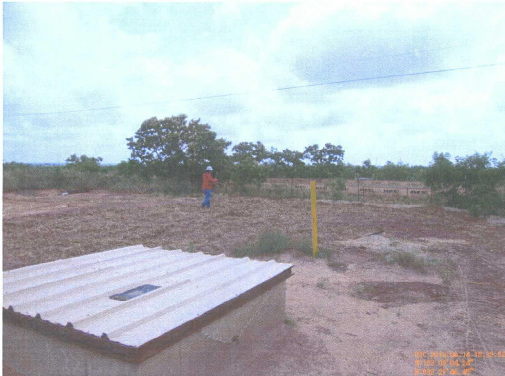
BD Jct. K-27-1 (1R426-03)