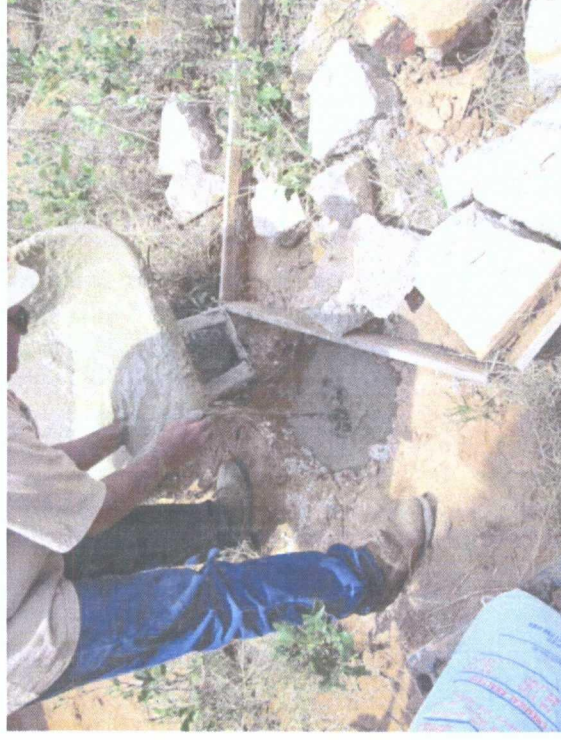
Placing a 3' concrete cap