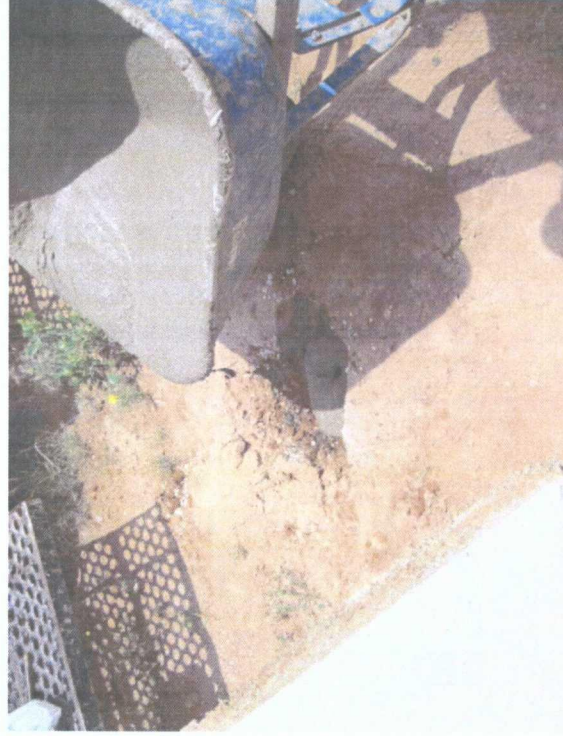
Plugging the well with bentonite/concrete slurry