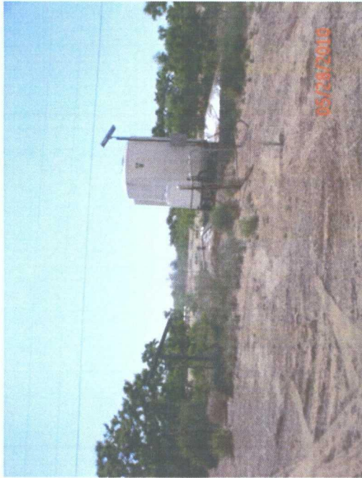
groundwater recovery system