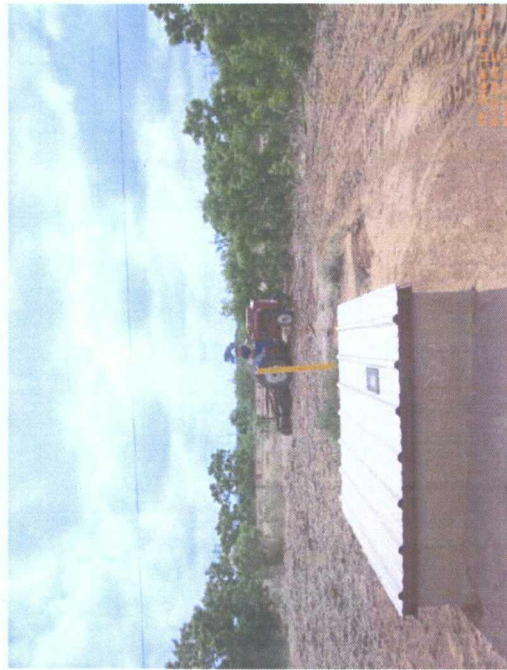
tilling in the seed