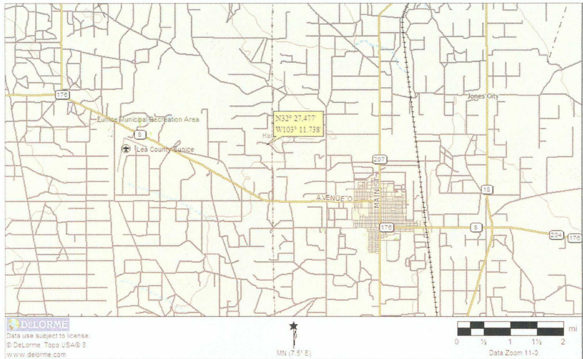
Figure 1 – BD Campbell Hedrick Hardy Jct Box location.