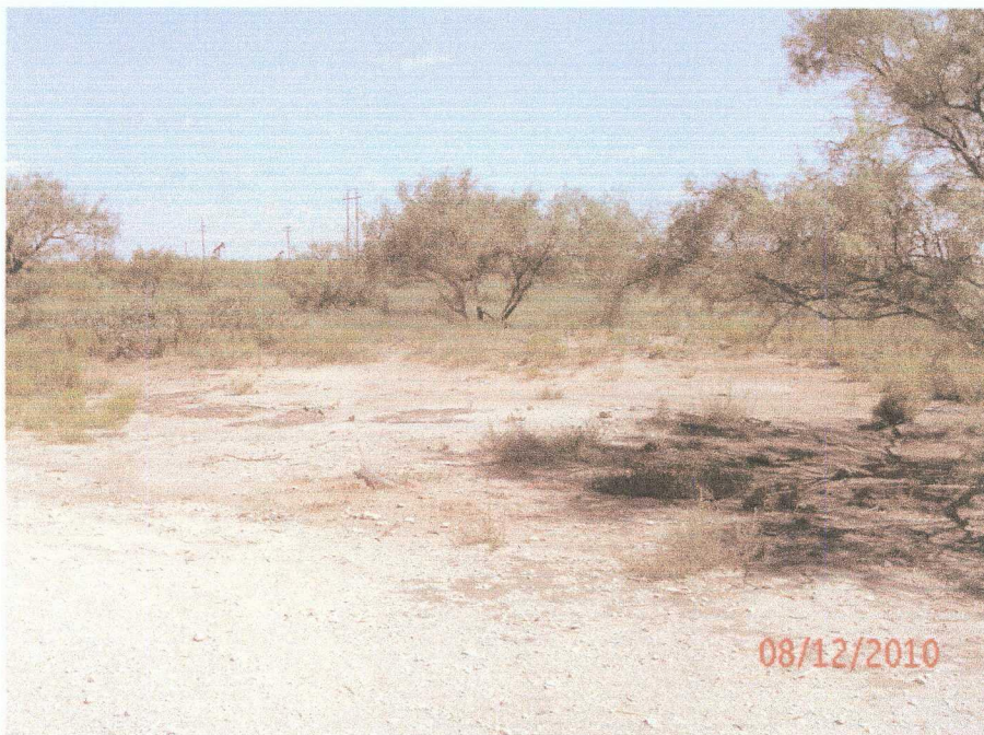
Figure 4a & 4b – BD Campbell Hedrick Hardy Junction Box location view looking northeast (Figure 4a, above) and east-southeast (Figure 4b, below) show areas impacted from produced water release. It is these open, un-vegetated areas that we propose to restore in the Corrective Action Plan.