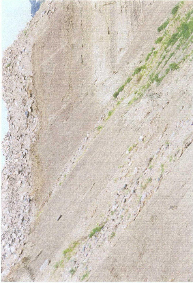
↪ slope down to R at loc