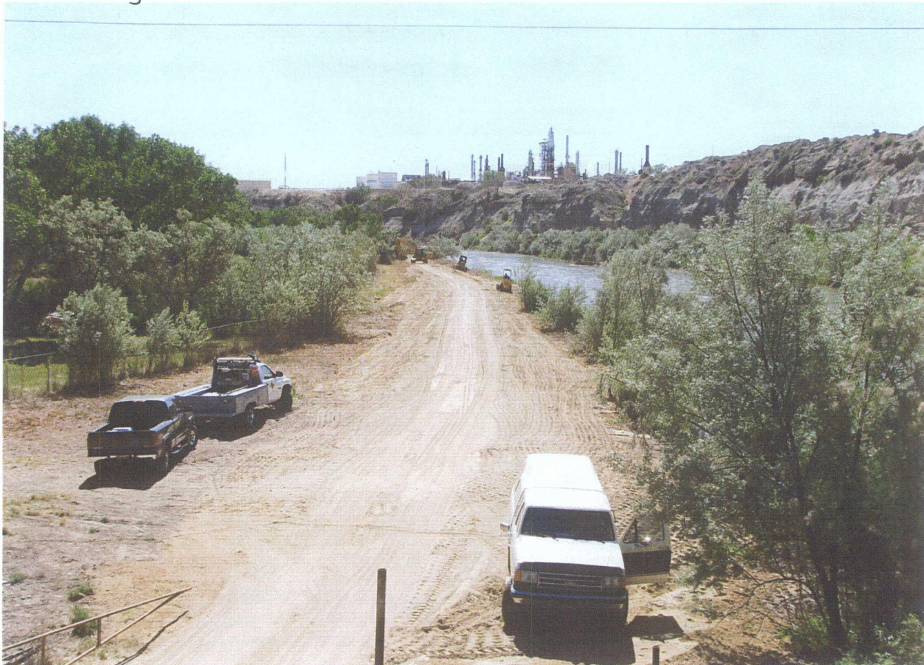
Viewing East from bridge.