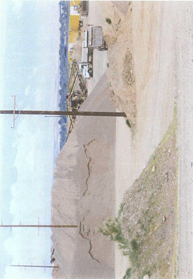
↪ well loc zoomed