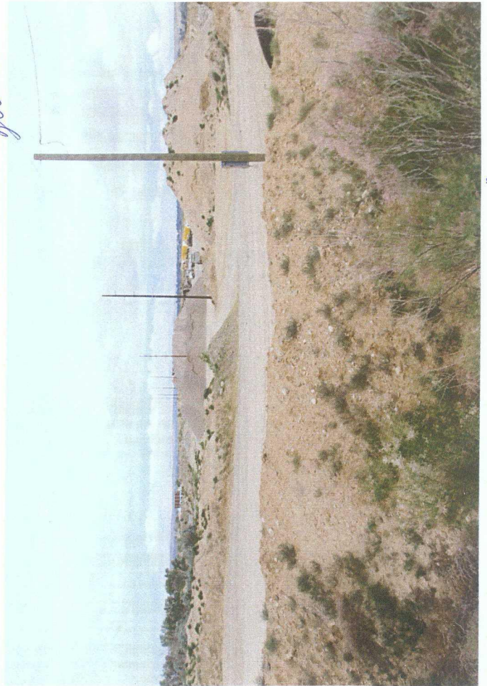
↪ well loc