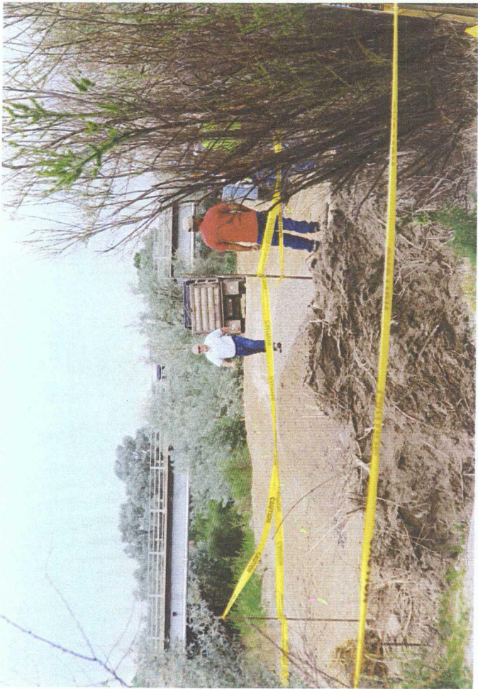
From 4C on Ex 2, looking toward bridge