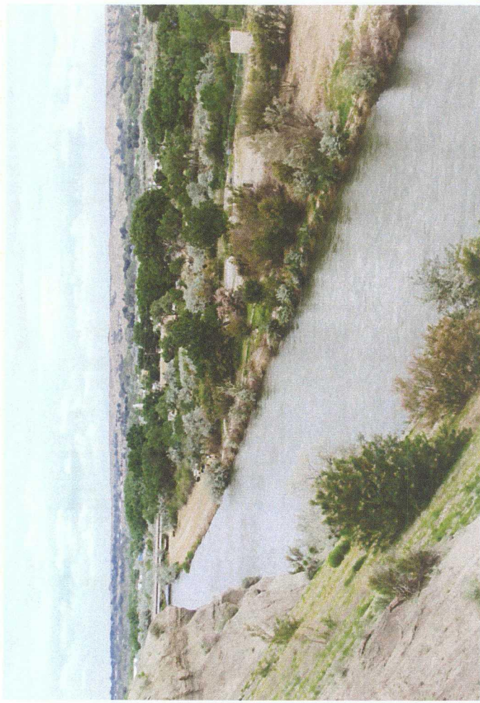
From 4A, looking toward bridge