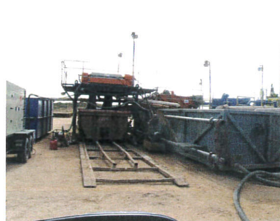
Above: Centrifugal Closed Loop System

*Not drawn to scale: Closed loop system requires at least 30 feet beyond mud tanks. Ideally 60 feet would be available