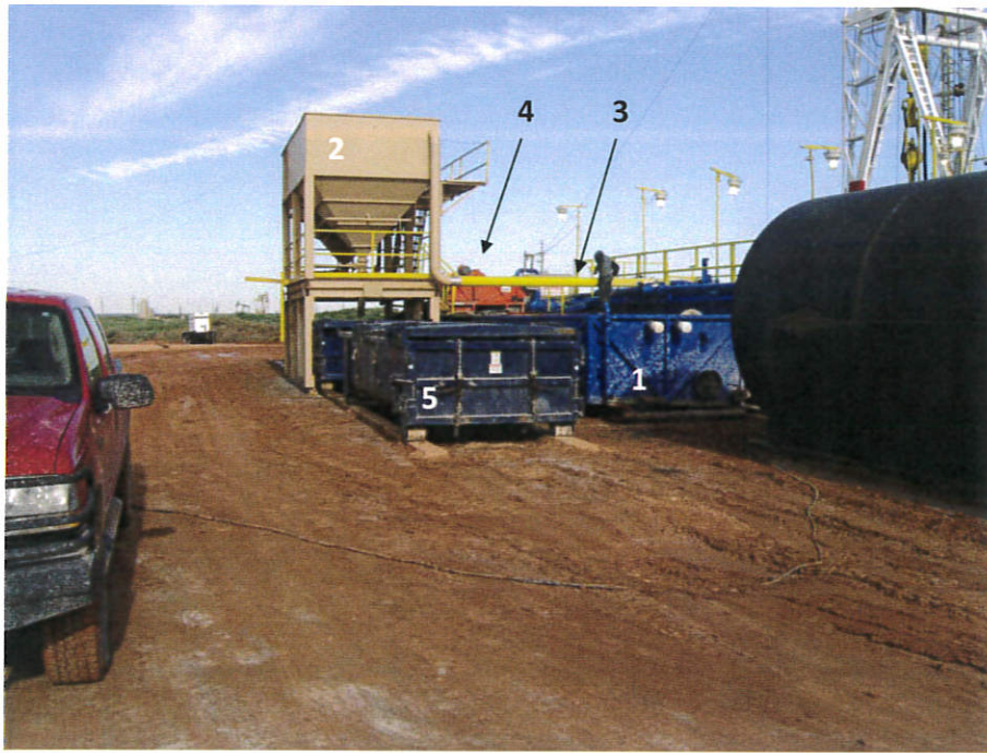
Closed Loop Drilling System: Mud tanks to right (1) Hopper in air to settle out solids (2) Water return pipe (3) Shaker between hopper and mud tanks (4) Roll offs on skids (5)