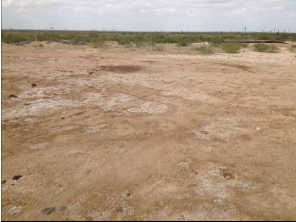
West of wellhead looking Northeast (Photo # 1)