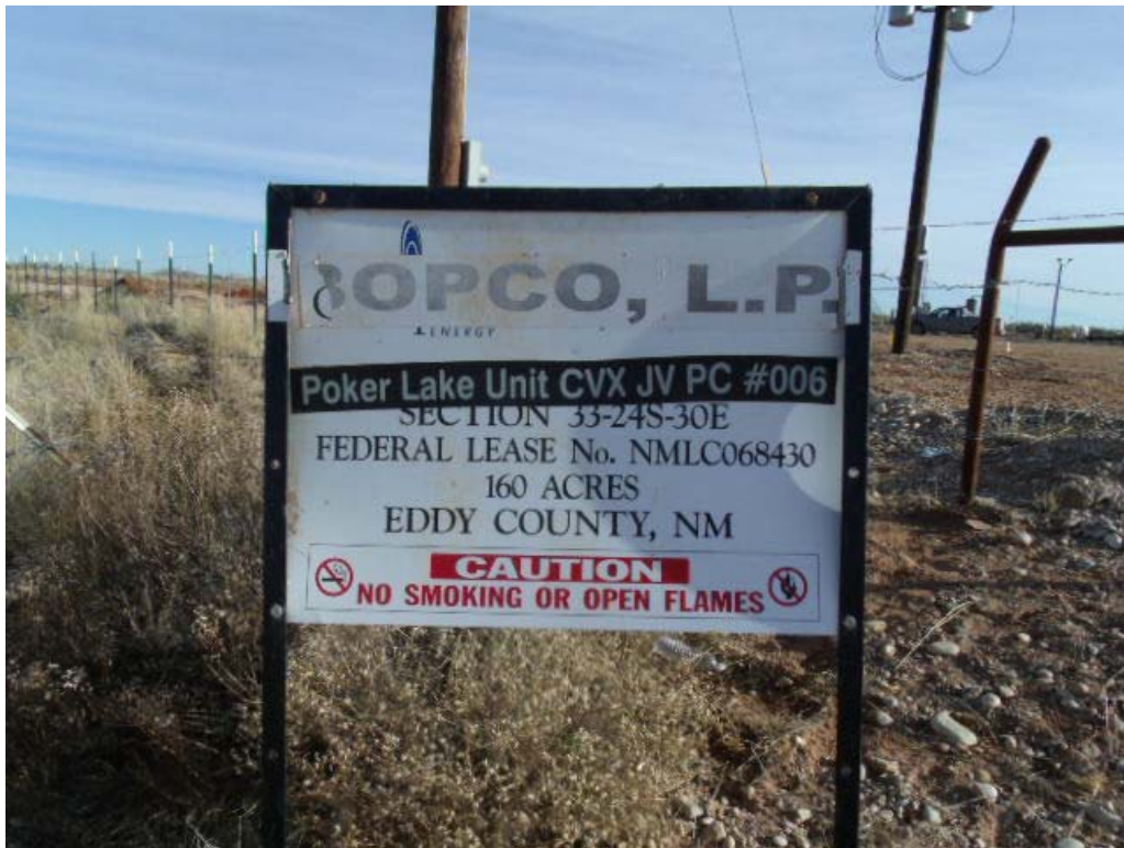
Photograph #1 – Lease sign