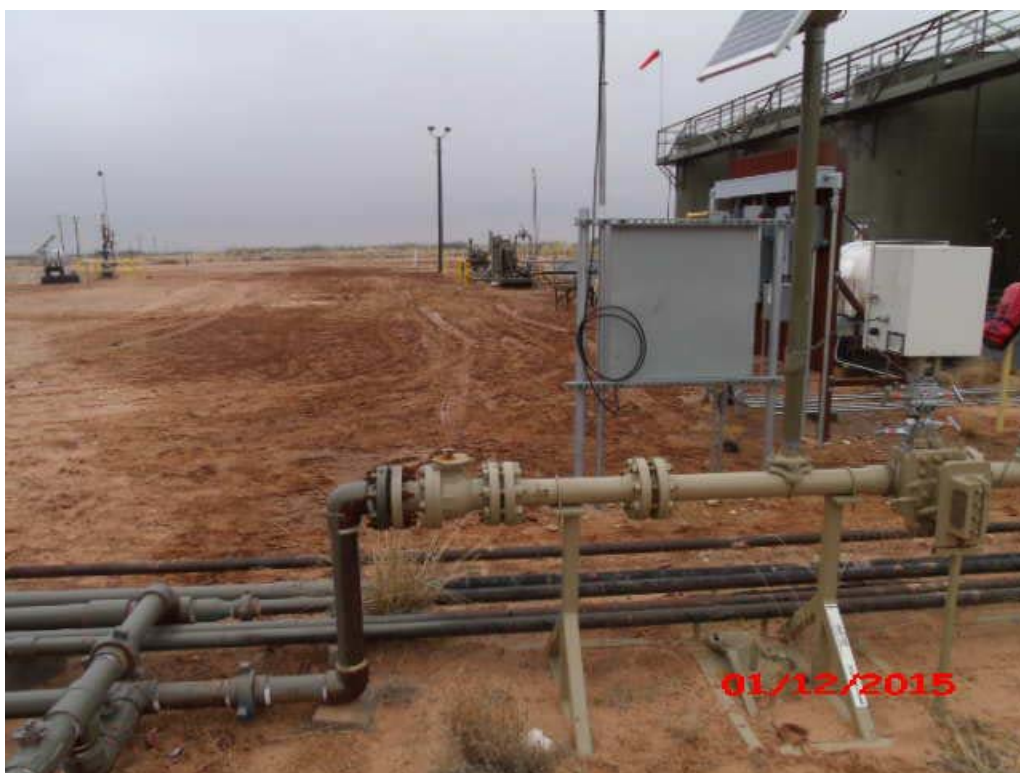
Photograph #4 – Release area