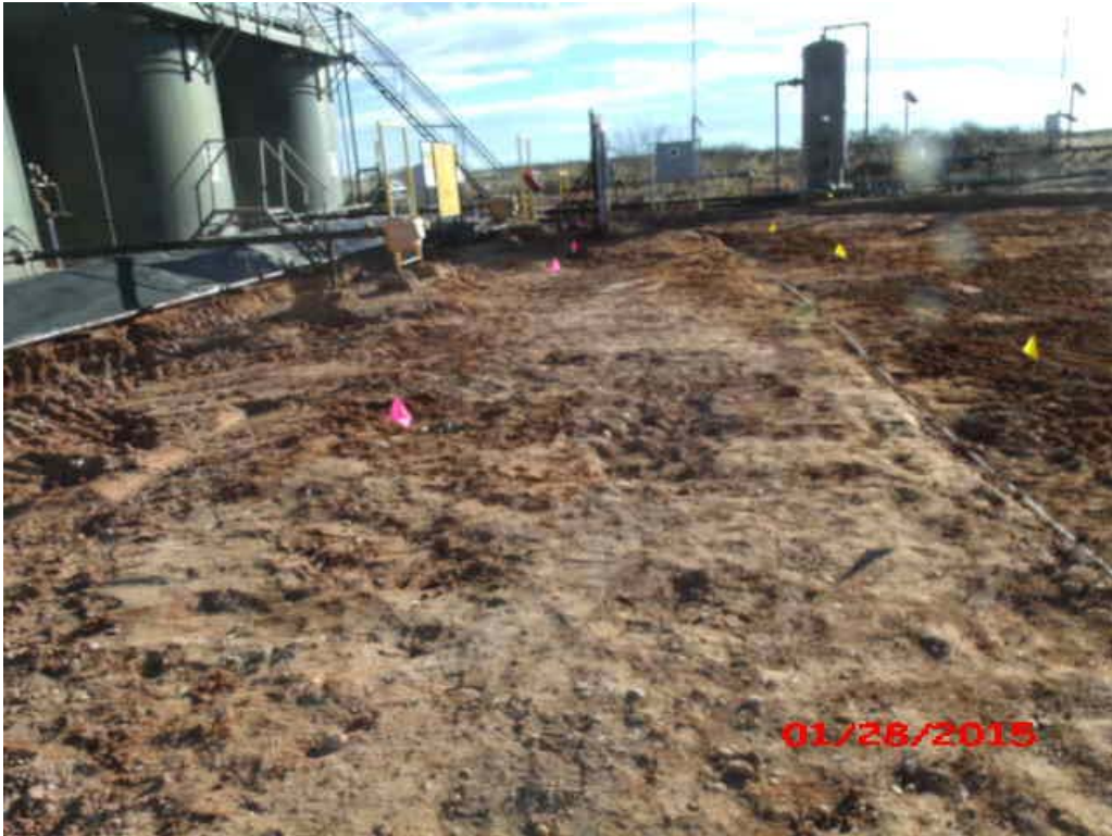
Photograph #7 – Excavated area