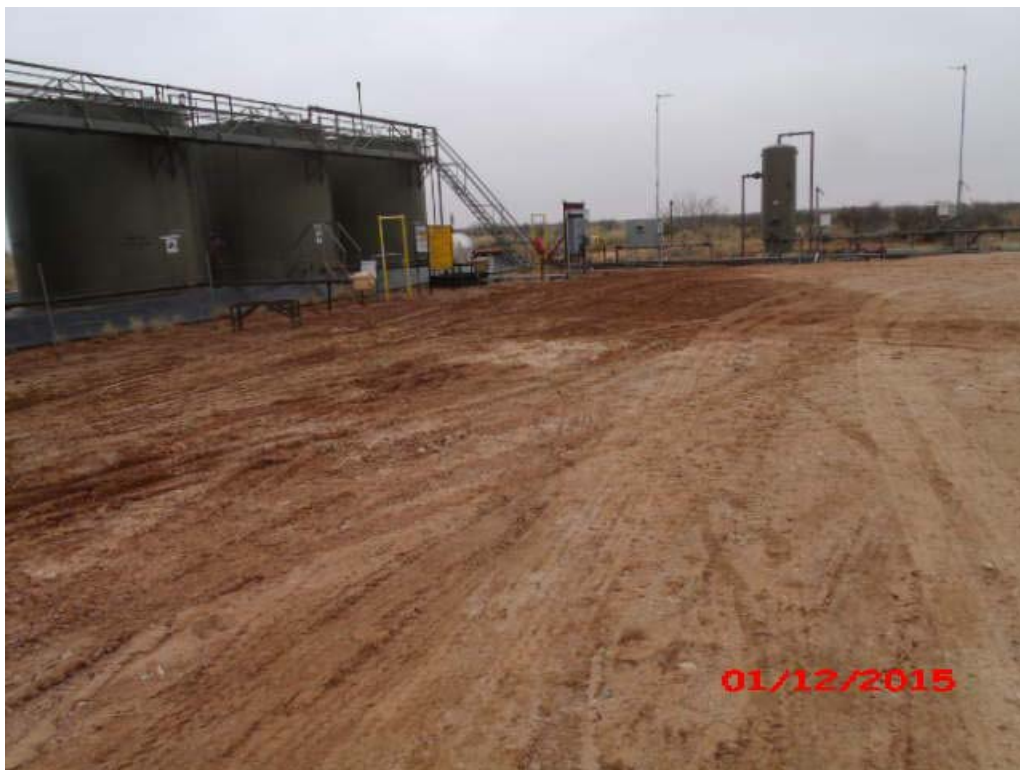
Photograph #3 – Release area