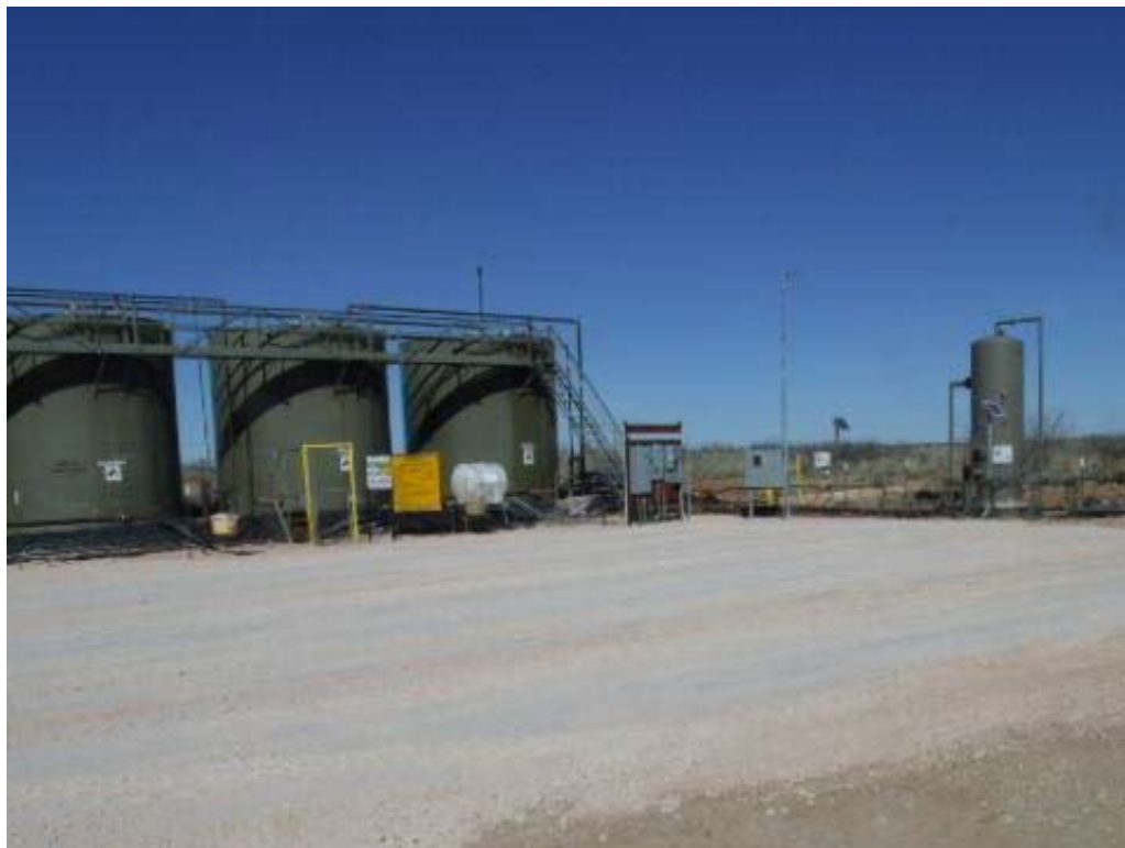
Photograph #12 – Backfilled area