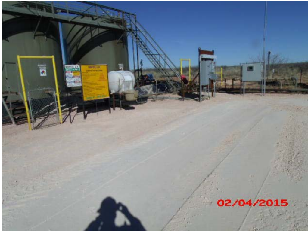
Photograph #11 – Backfilled area