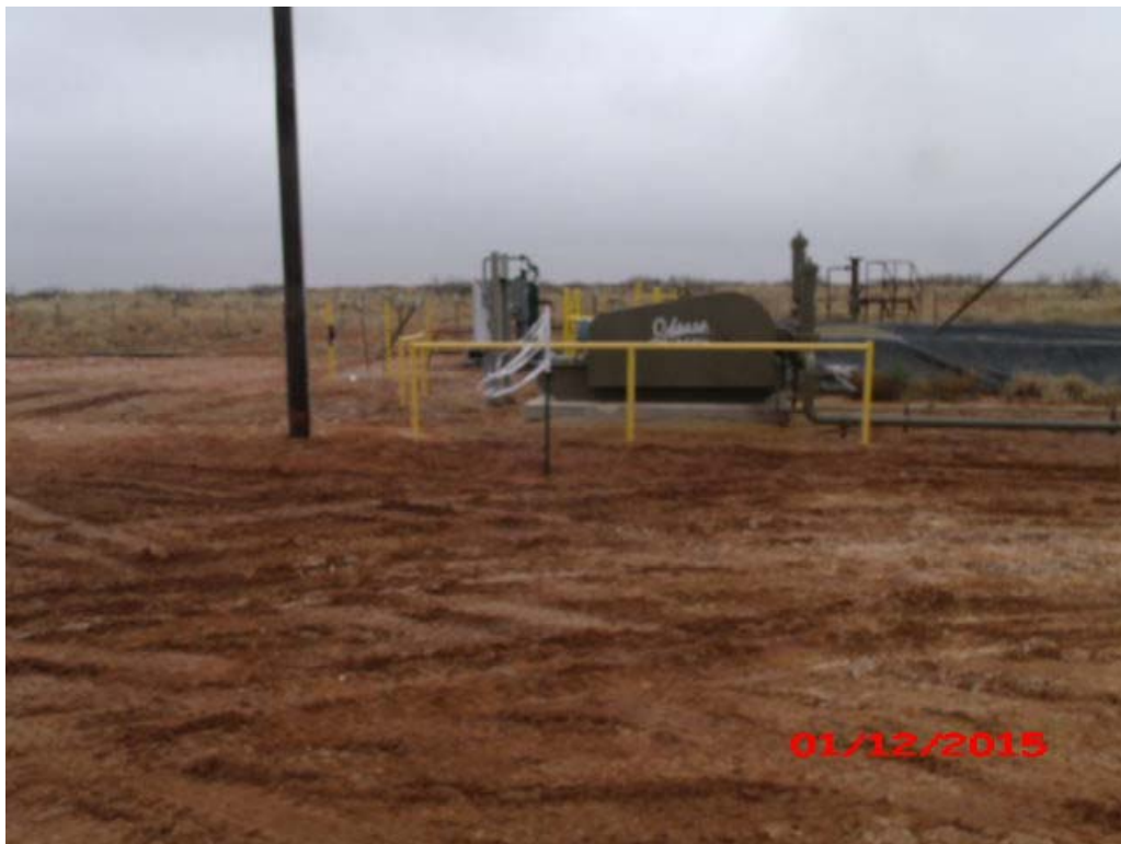
Photograph #2 – Release area