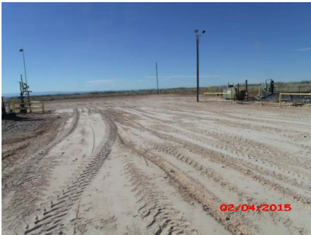
Photograph #9 – Backfilled area