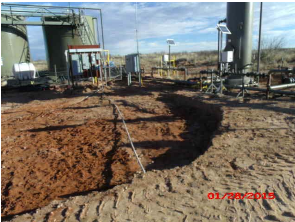
Photograph #8 – Excavated area