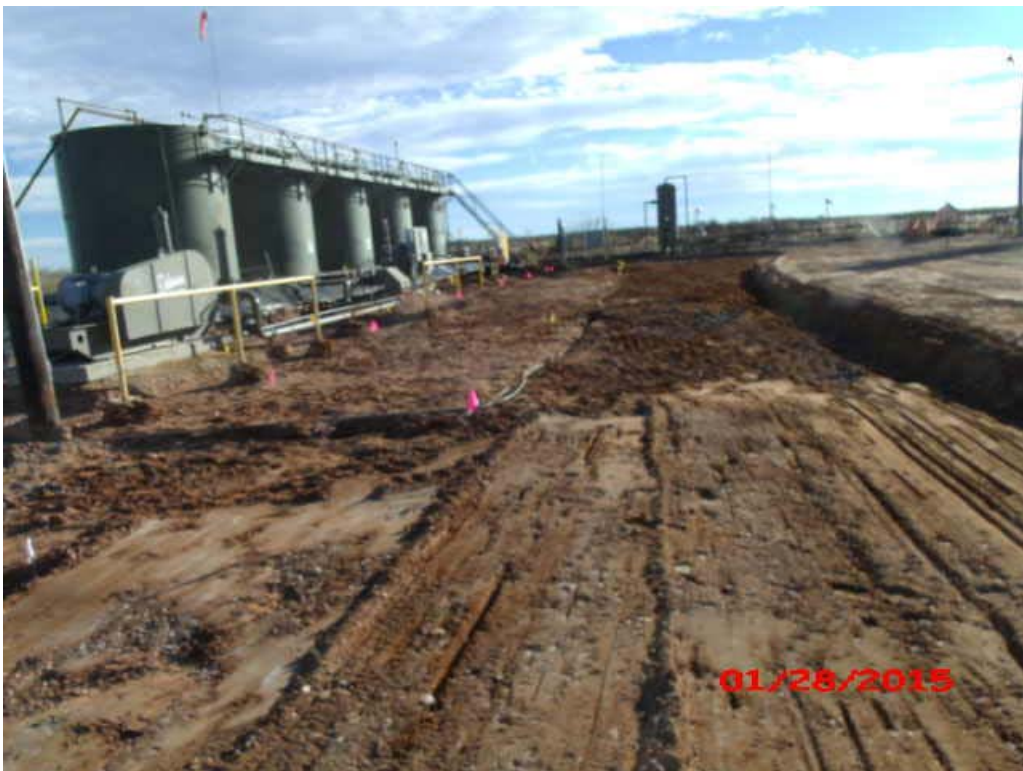
Photograph #6 – Excavated area