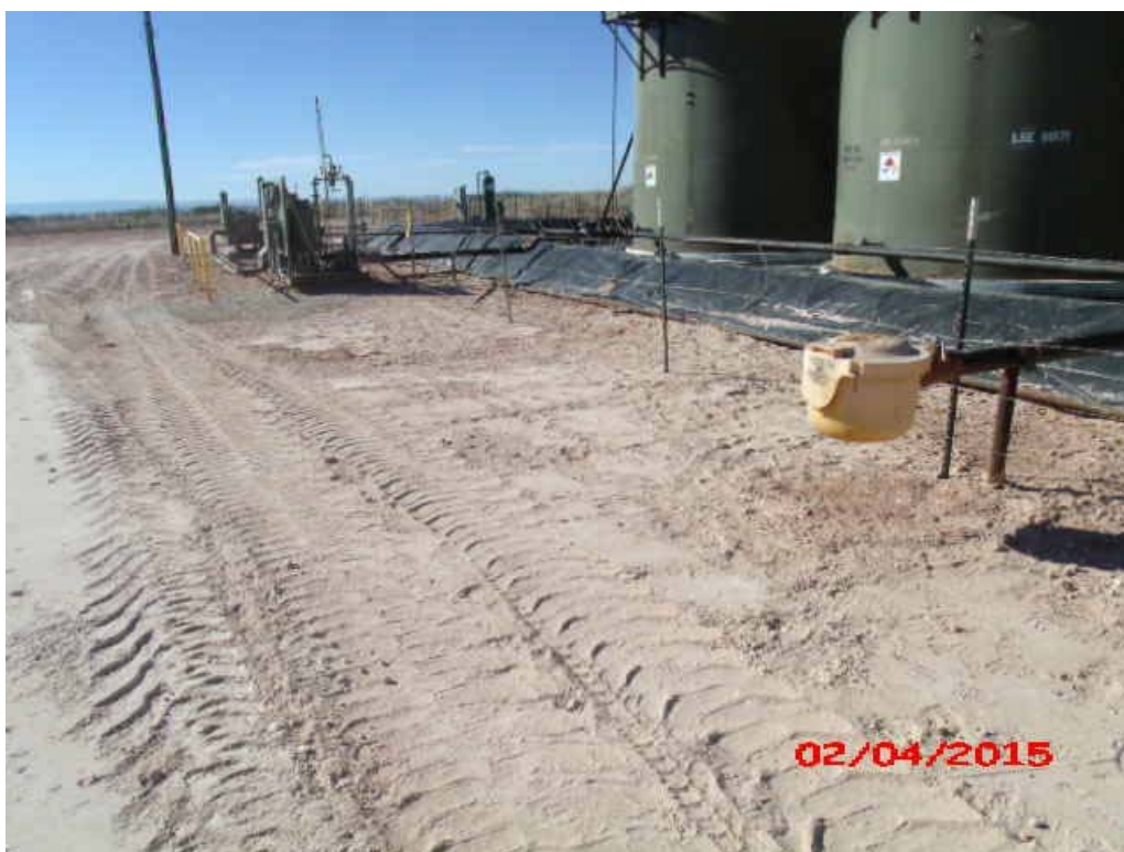
Photograph #10 – Backfilled area