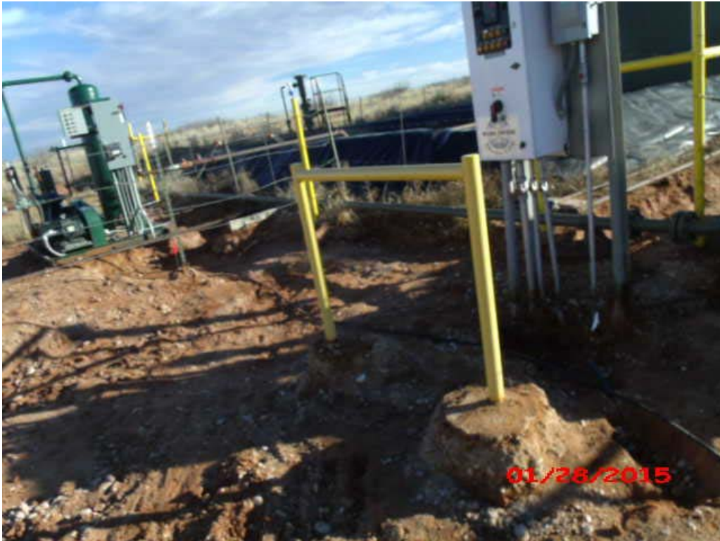
Photograph #5 – Excavated area