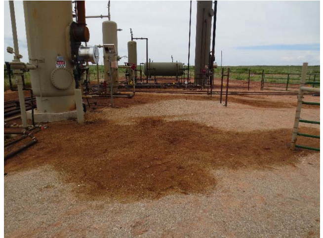
Inside bermed area looking West 05-14-15