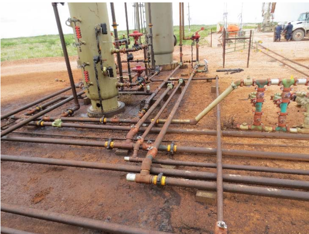
Lines inside bermed area 05-14-15