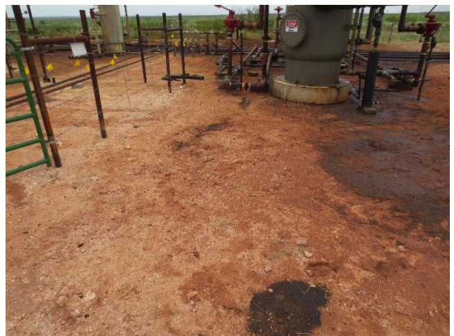
Close up of leak source 05-14-15