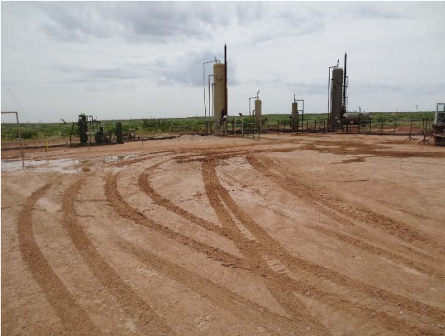
Location produced water and oil impact 05-14-15