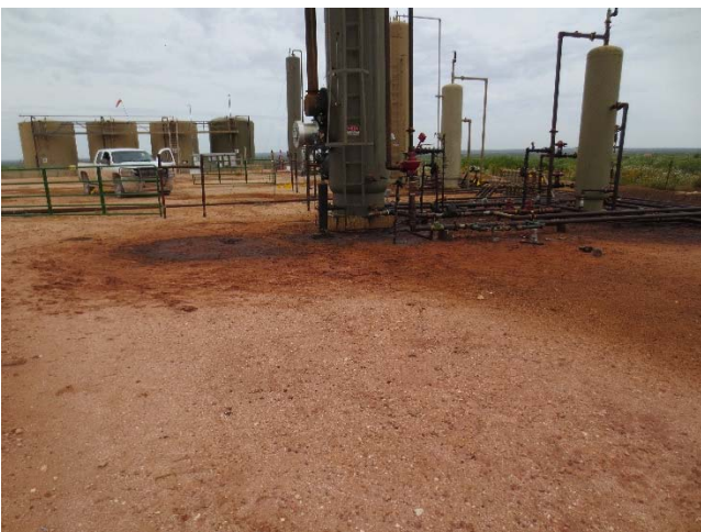
Sample point 2 between heaters 05-14-15