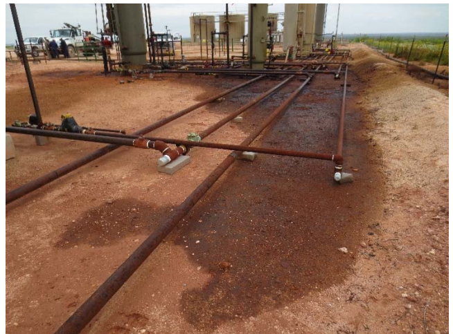
Sample point 1 center of lines auger refusal 05-14-15