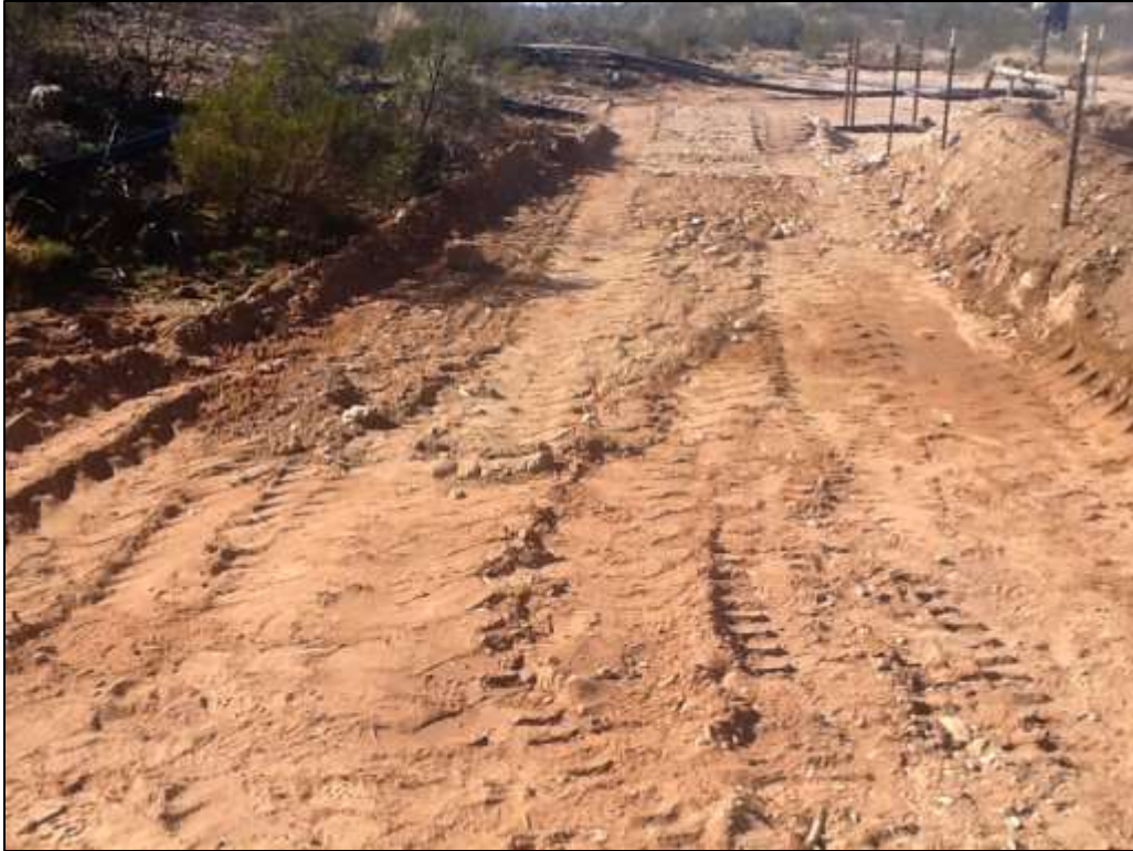
Outside berm looking West (Photo # 5)