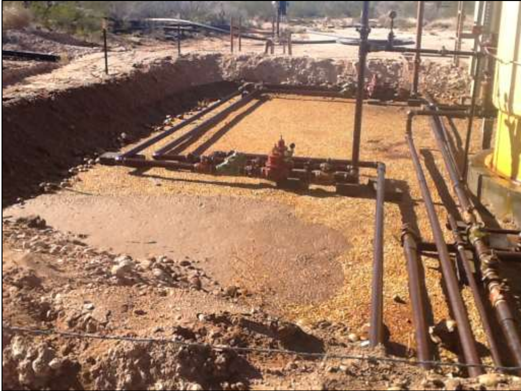
Inside South side of berm looking West (Photo # 3)