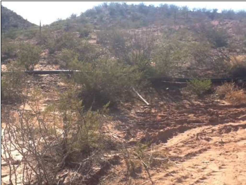
Overspray area looking Southwest (Photo # 6)