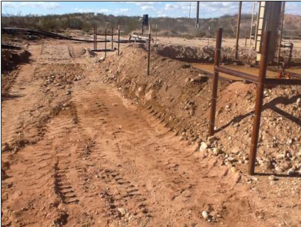
South side of berm looking West (Photo # 4)