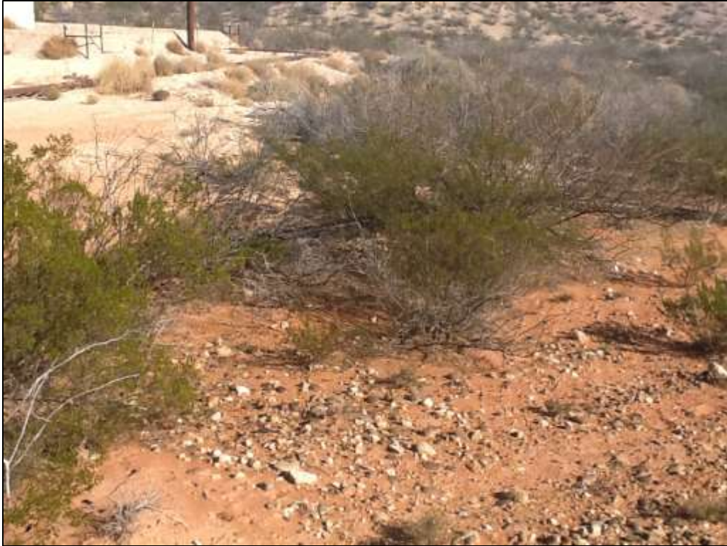
Overspray area looking West (Photo # 17)