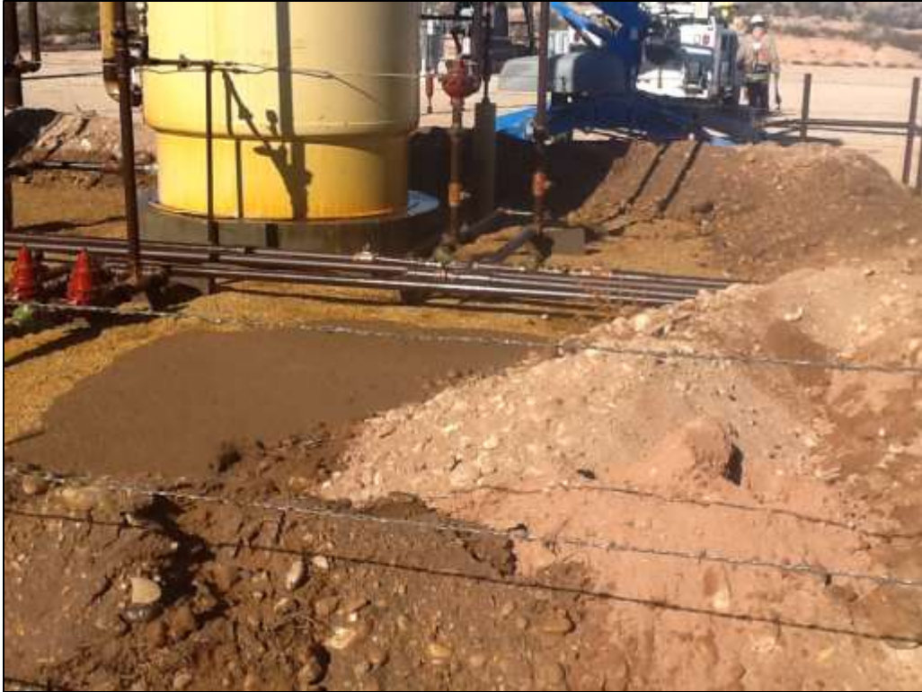
Inside berm looking North (Photo # 9)