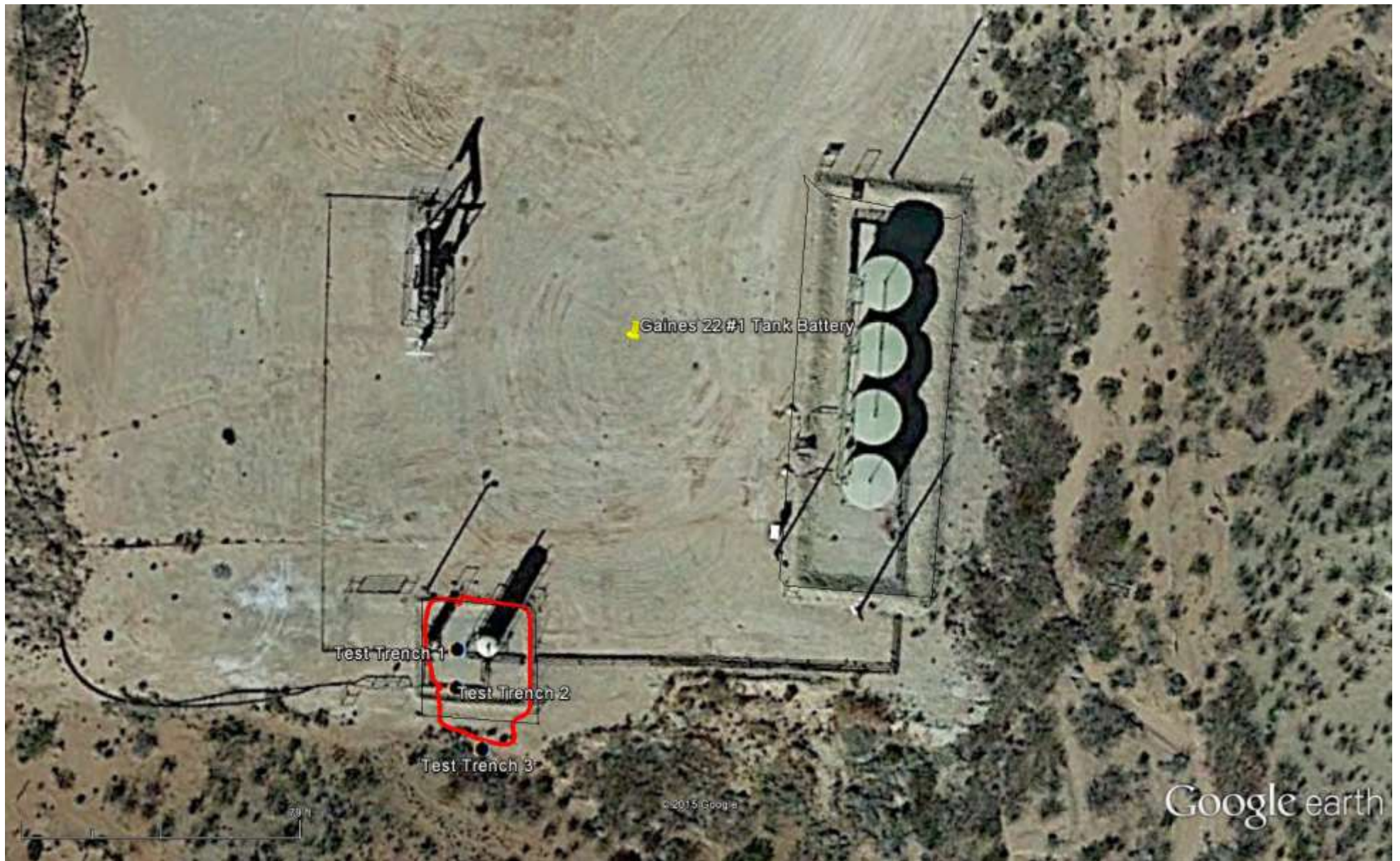
Gaines 22 Fed Com 1 Battery