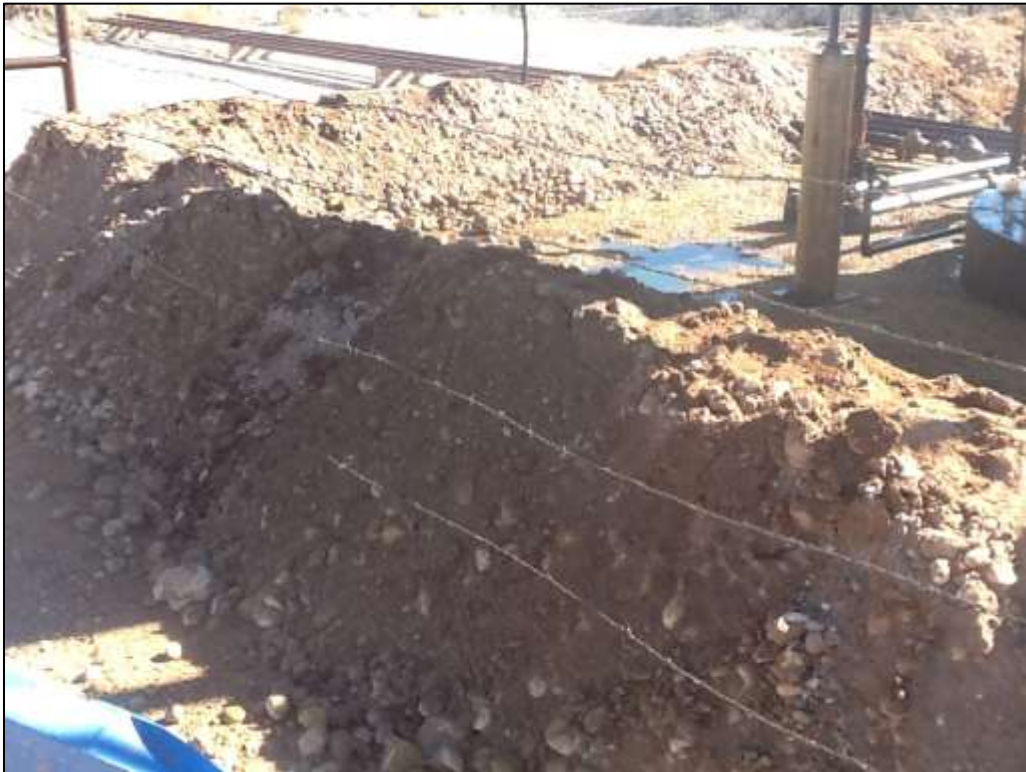
Berm Northwest corner looking West (Photo # 16)