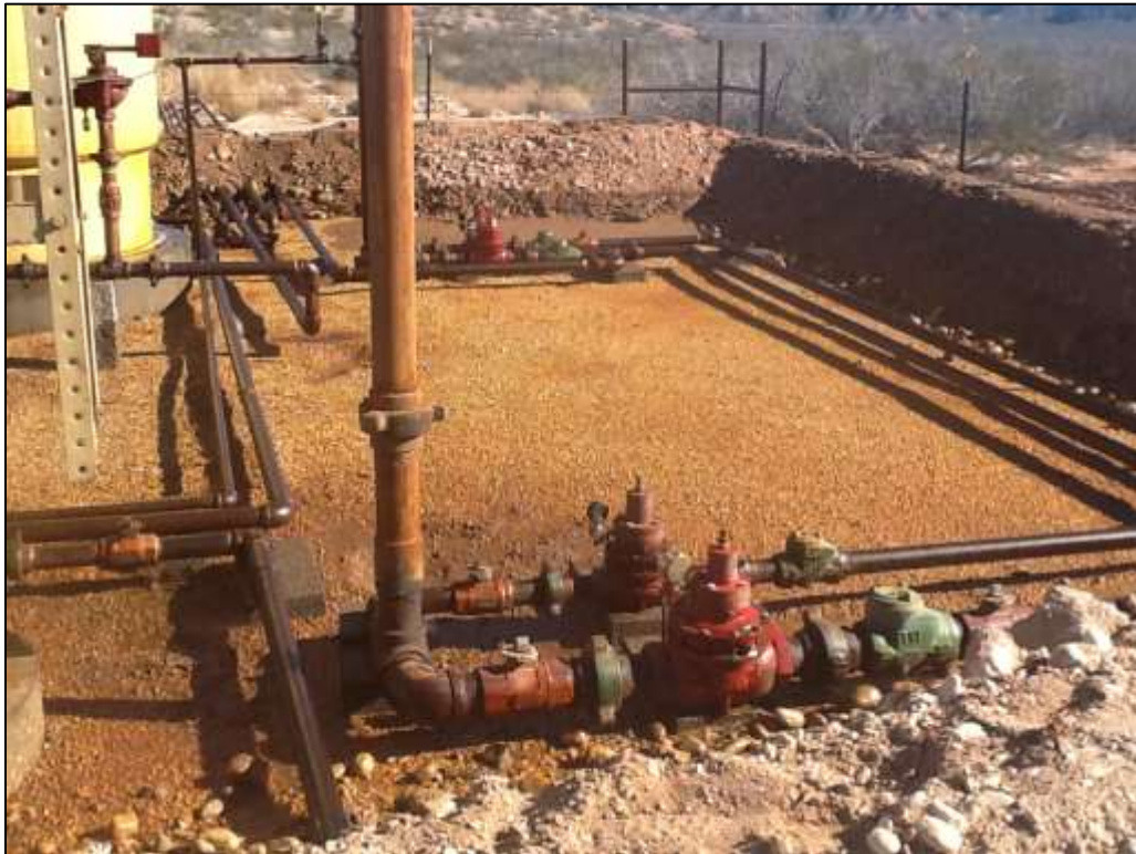
Inside South side of berm looking East (Photo # 12)