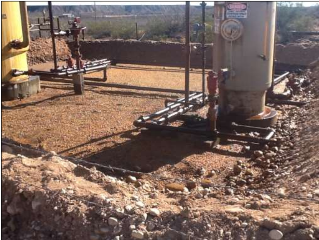
Inside West side of berm looking South(Photo # 14)