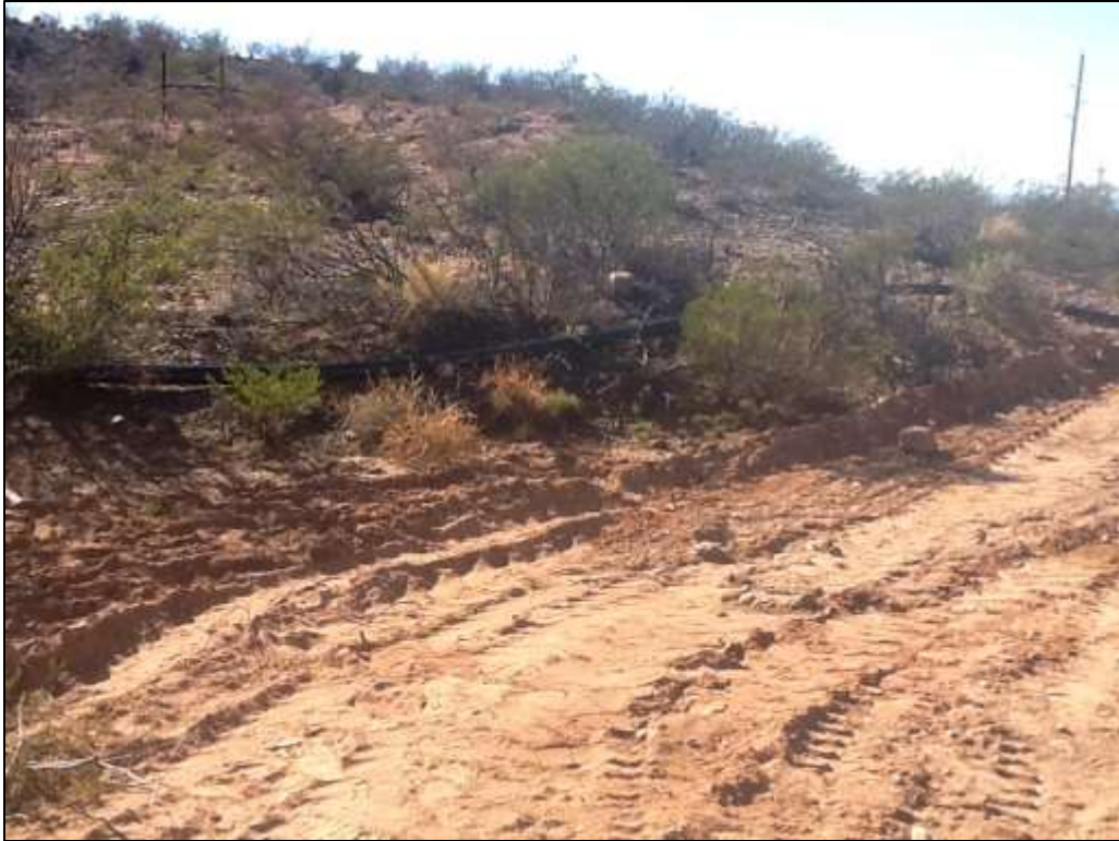
Overspray area looking Southwest (Photo # 7)