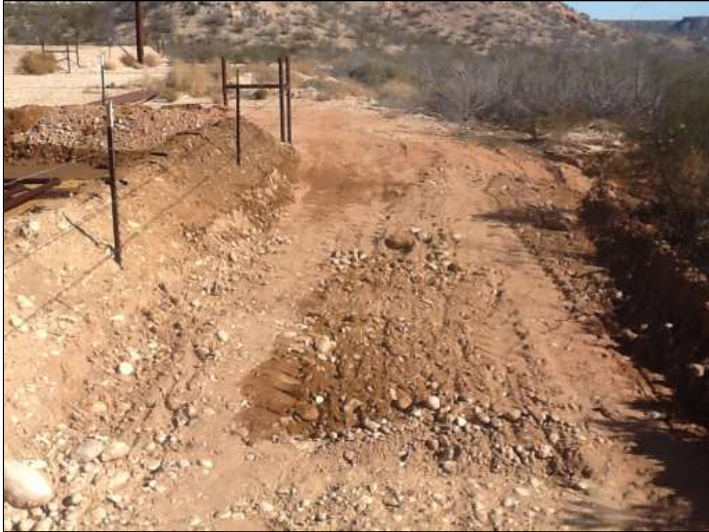
Outside staining looking North (Photo # 11)