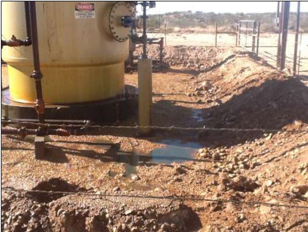
Inside berm North looking West (Photo # 2)