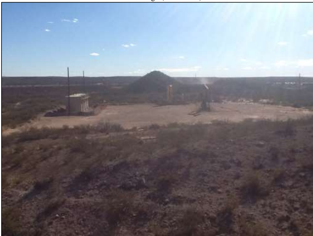
Battery looking South (Photo # 20)