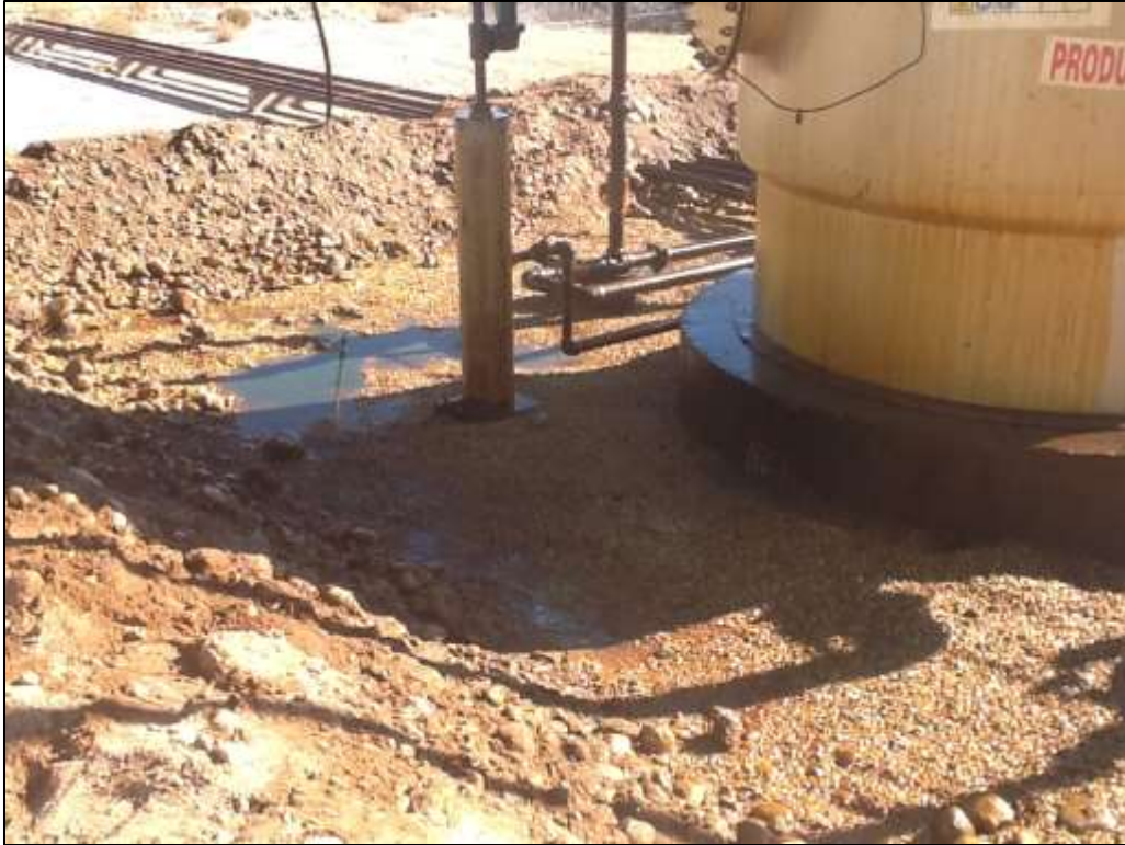
Inside East side of berm looking South (Photo # 15)