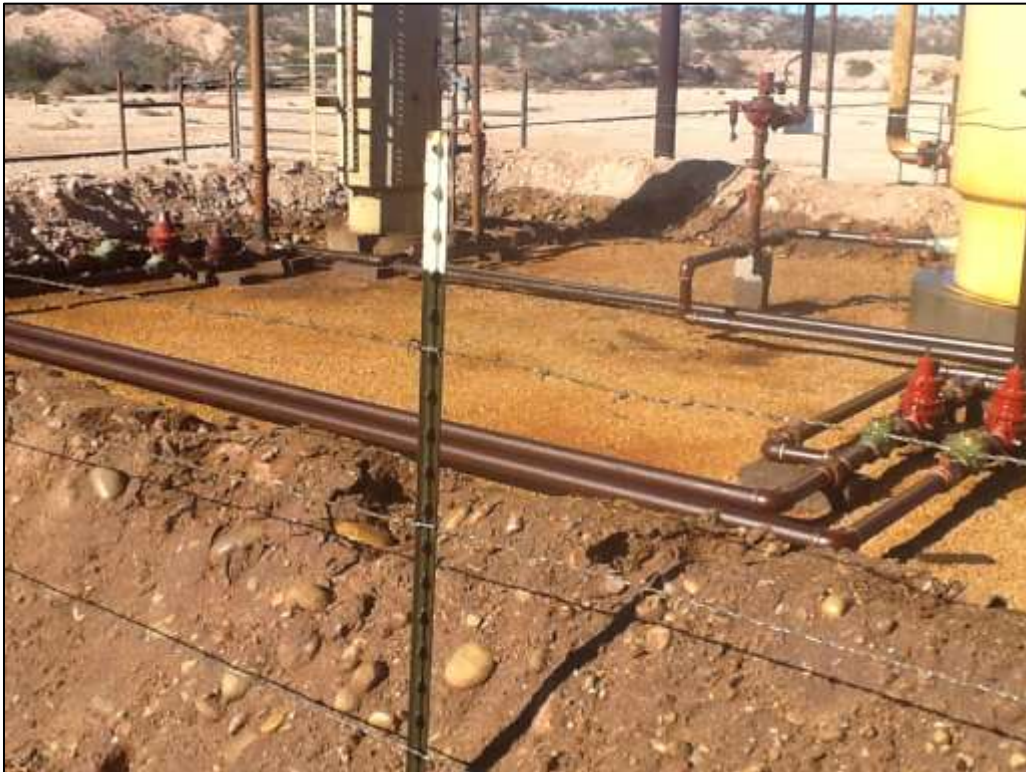
Inside berm looking North (Photo # 10)