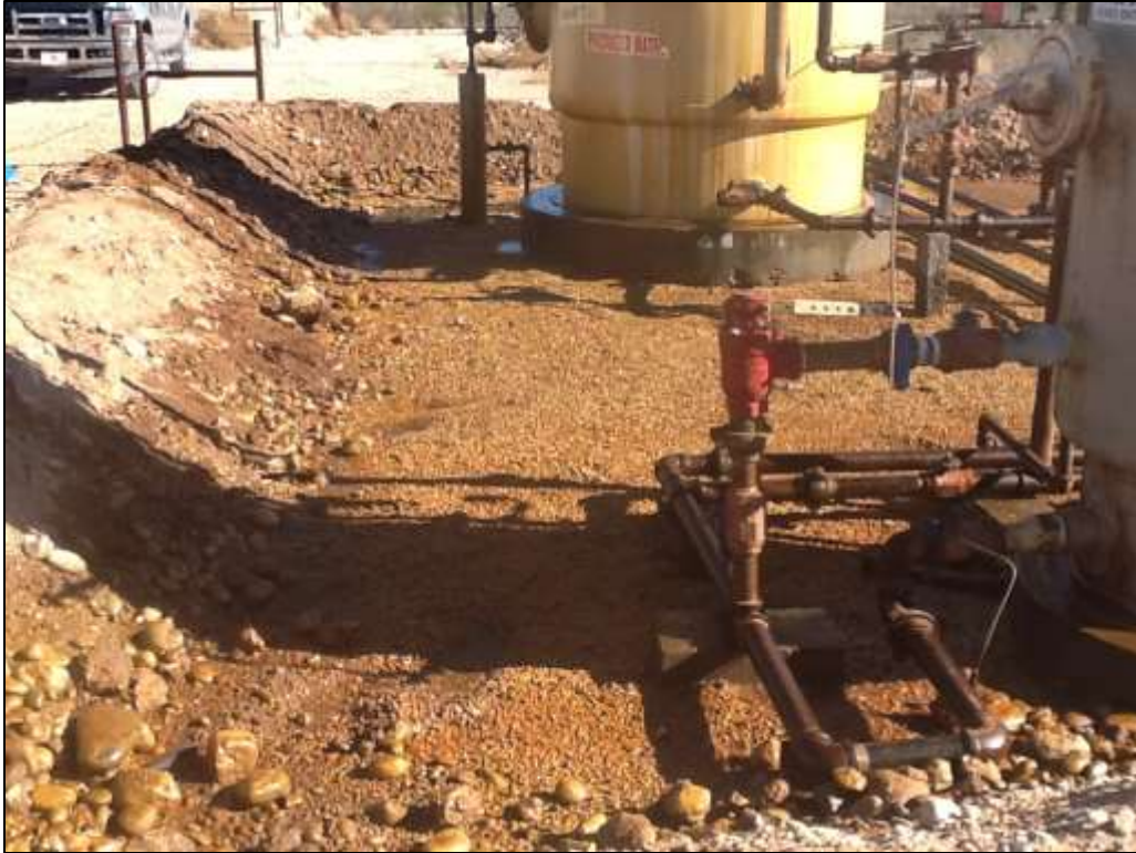
Inside North side of berm looking East (Photo # 13)