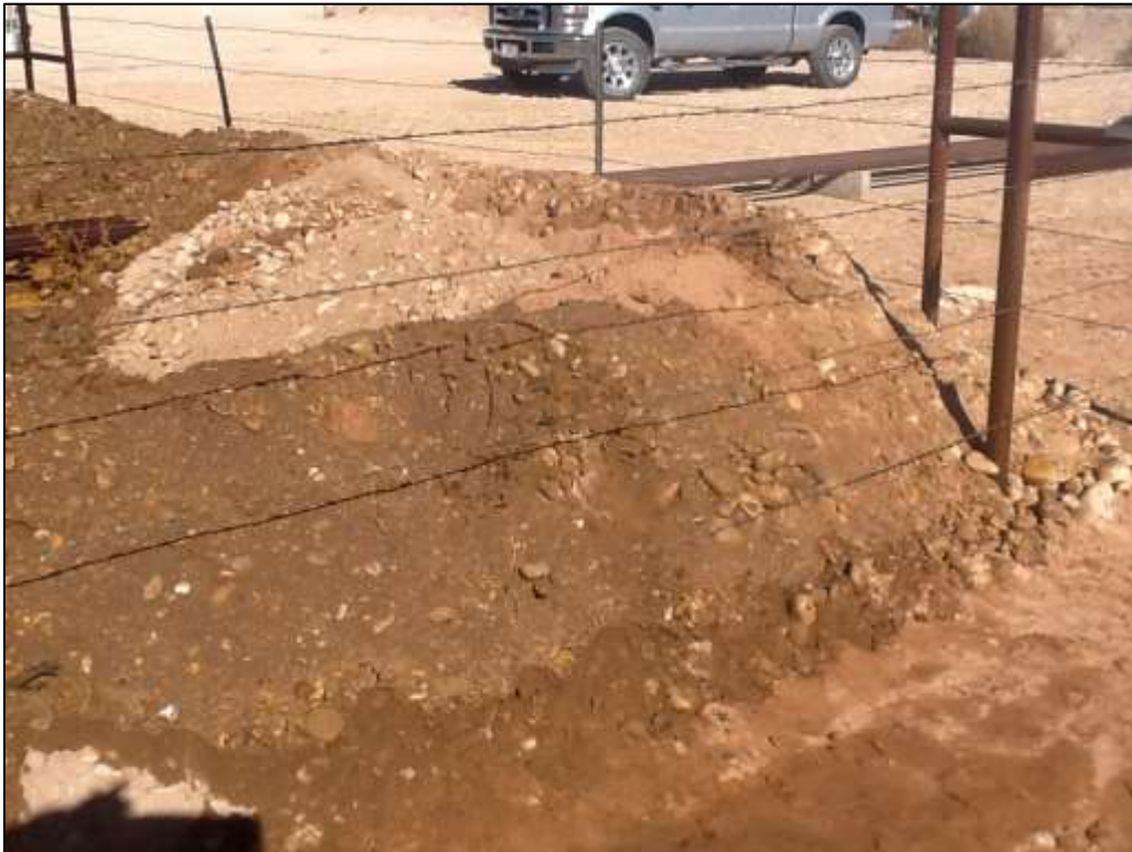
Berm breech Southeast side looking North (Photo # 8)