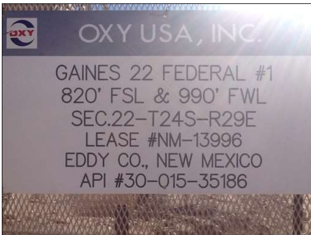
Location Sign (Photo # 19)