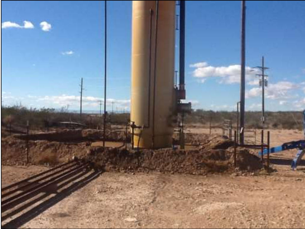
Heater looking West (Photo # 1)