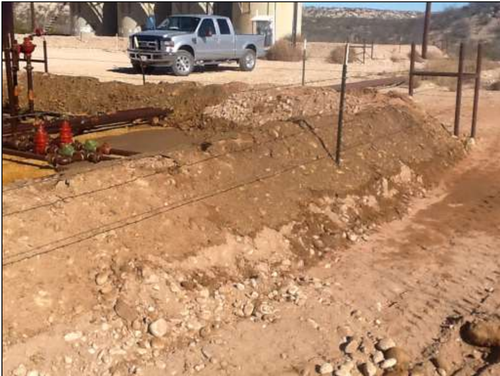
Berm Southeast corner looking West (Photo # 18)