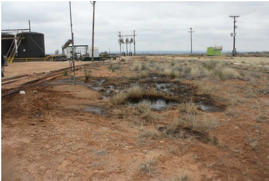
Poker Lake Unit #212 - Release Site