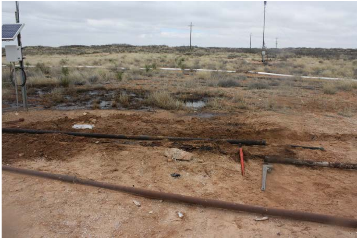
Poker Lake Unit #212 - Release Site