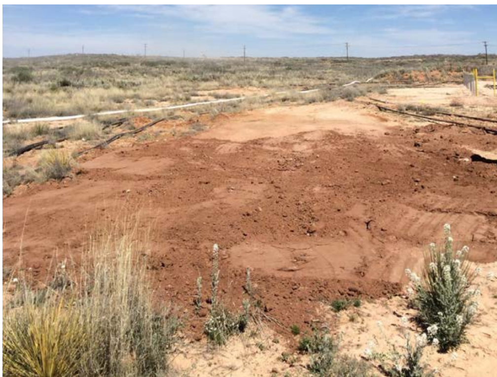
Poker Lake Unit #212 - Excavation