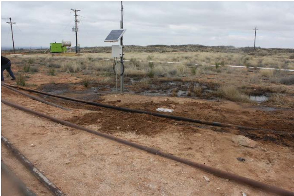
Poker Lake Unit #212 - Release Site