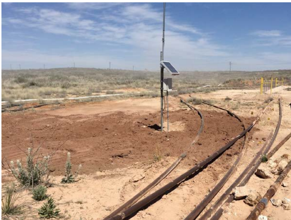
Poker Lake Unit #212 - Excavation