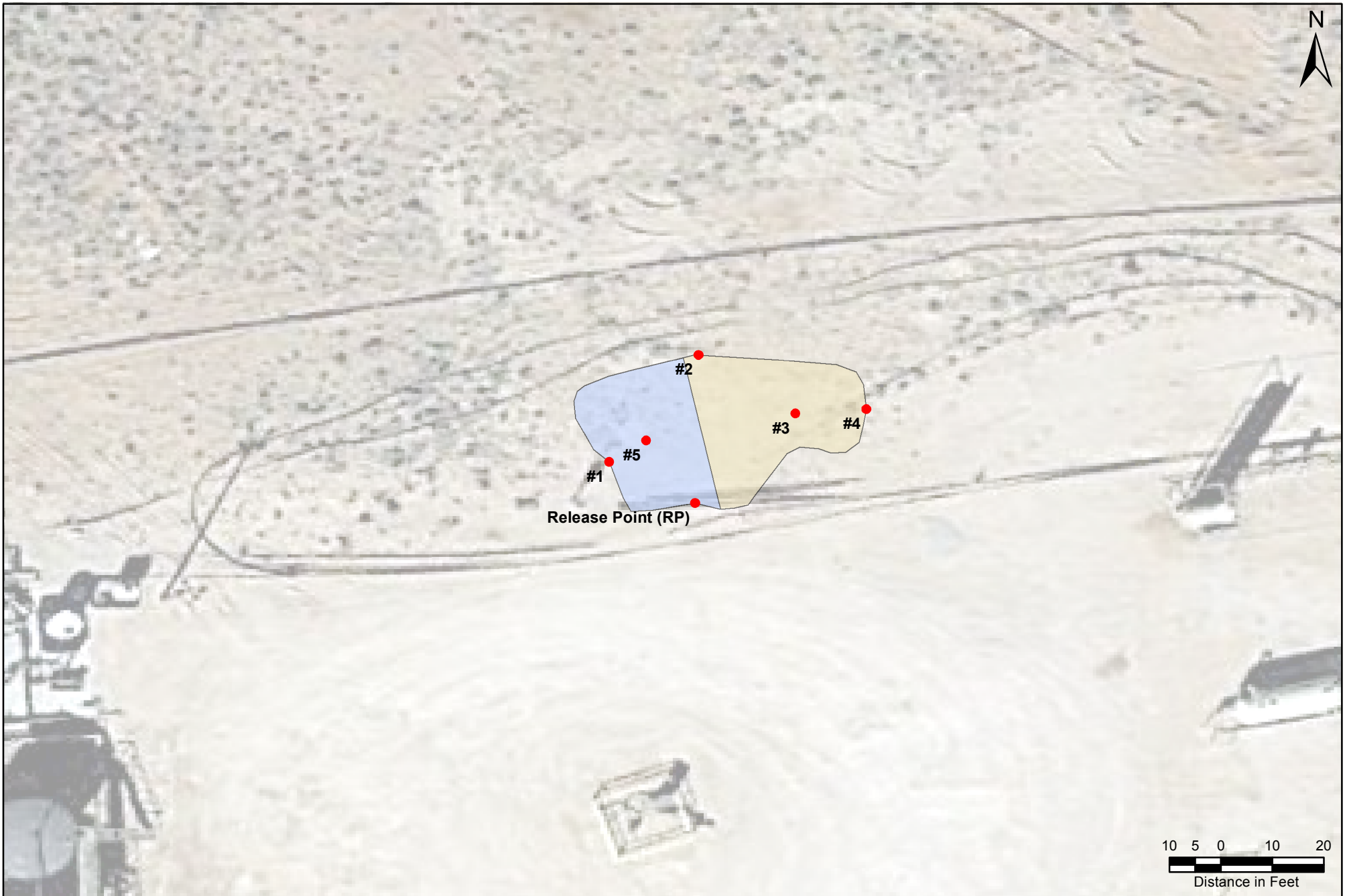
Figure 2 Sample Location Map BOPCO, LP Poker Lake Unit #212 Eddy County, New Mexico NMOCD Reference #: 2RP-2871