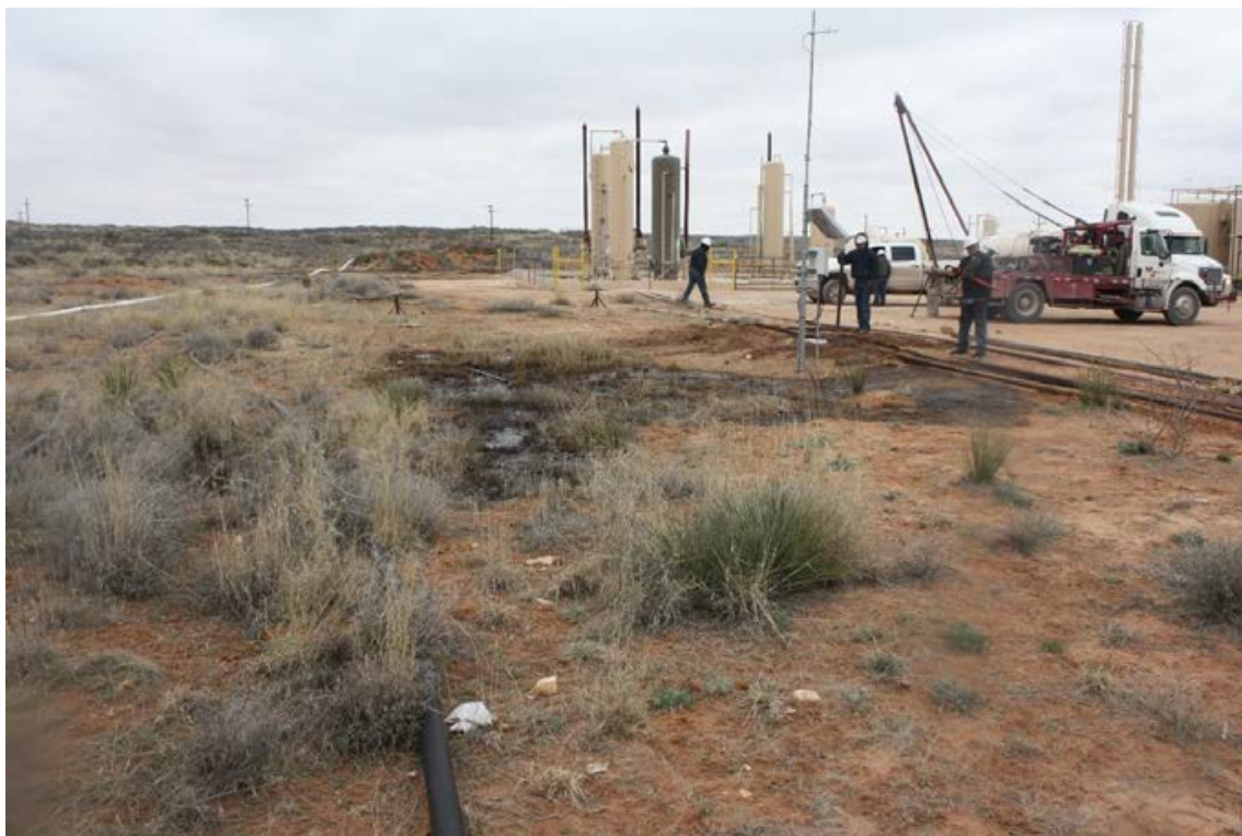
Poker Lake Unit #212 - Release Site