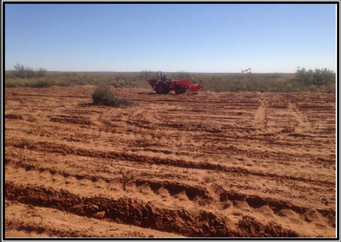
Seeding site after backfill