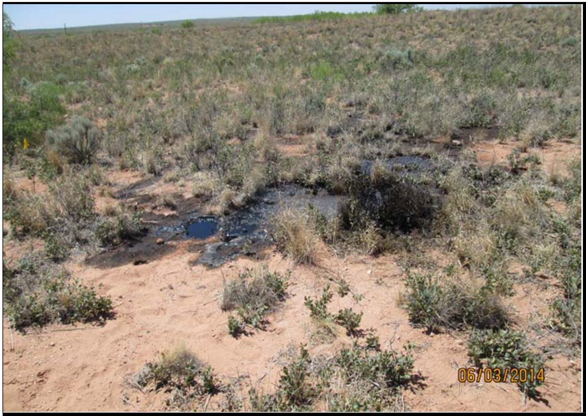
Spill area in pasture