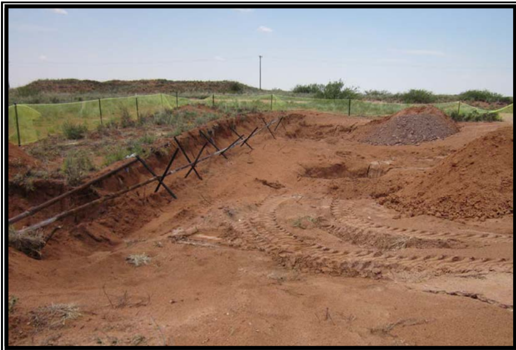
Spill area in pasture during excavation