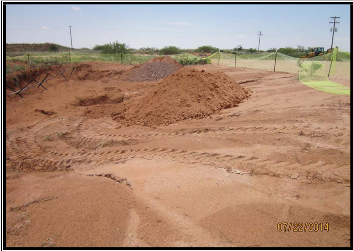
Spill area during excavation