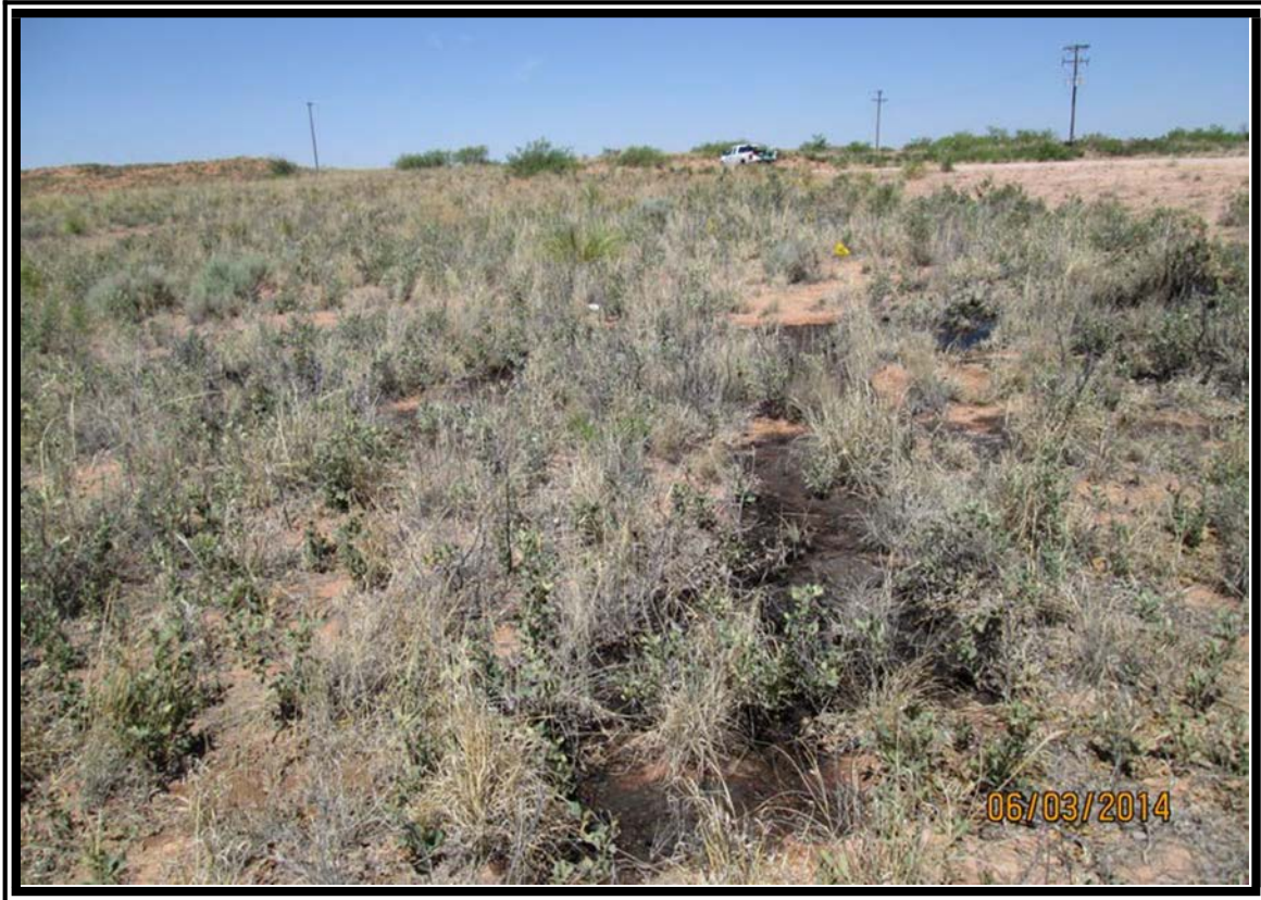
Spill Area in pasture before excavation