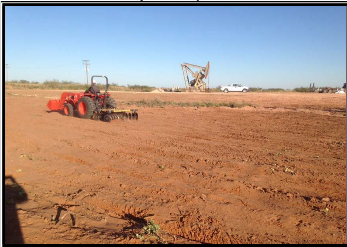
Seeding site after backfill