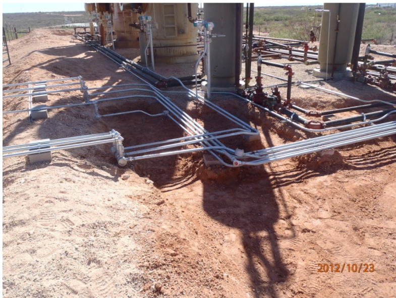
Excavation complete, facing south 10/23/12