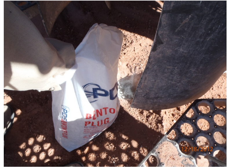
Plugging SB-1 in total with bentonite