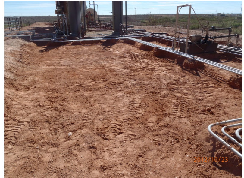
Excavation complete, facing south 10/23/12