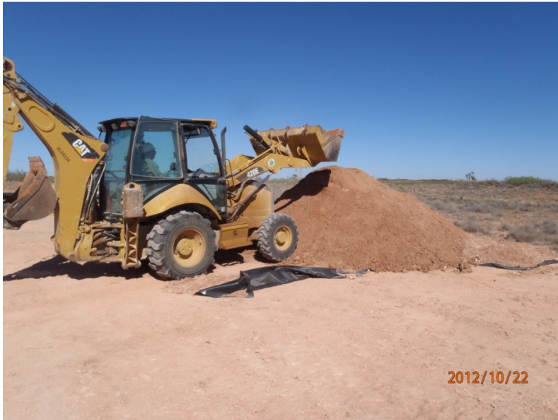
Stockpiling on plastic, facing east 10/22/12