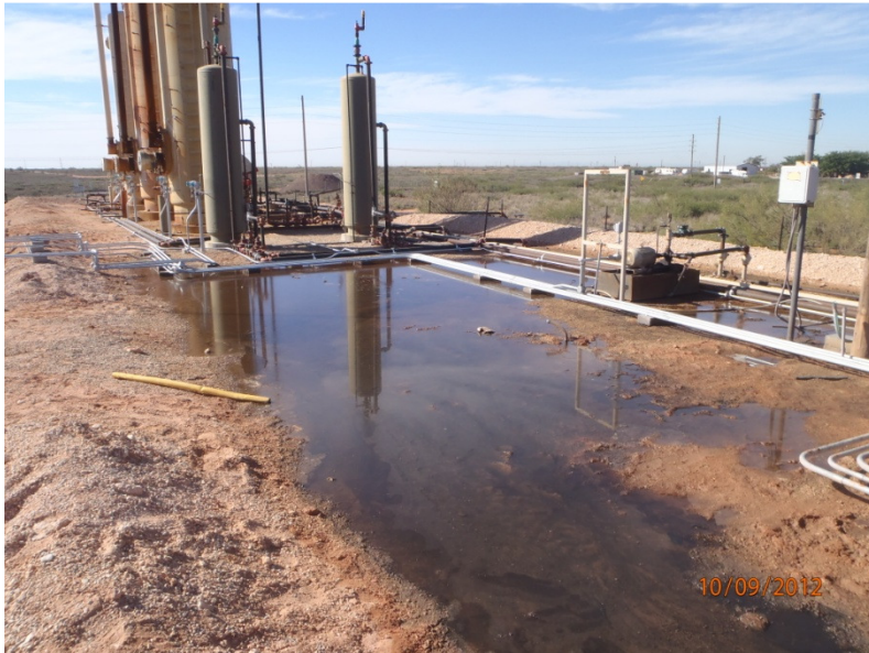
Initial release area, facing south