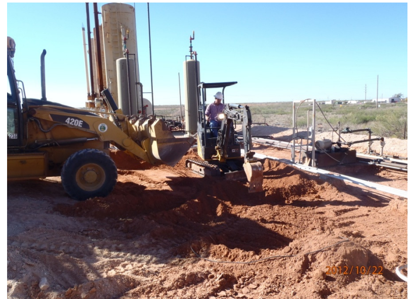
Excavating and loading, facing south