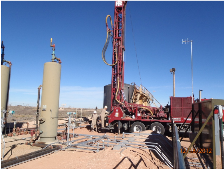
Installing SB-1, facing north