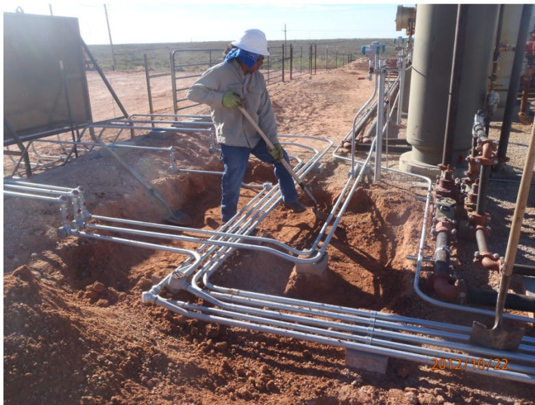
Digging under lines, facing south