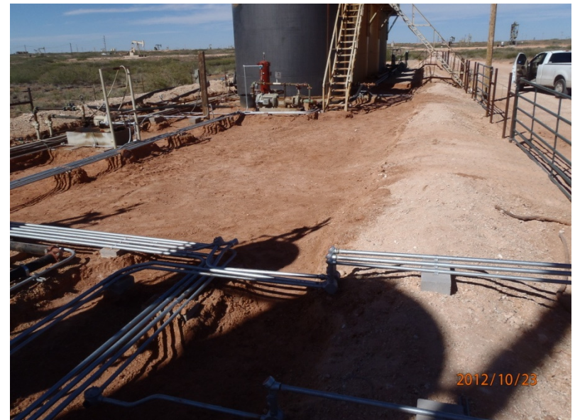
Excavation complete, facing north 10/23/12