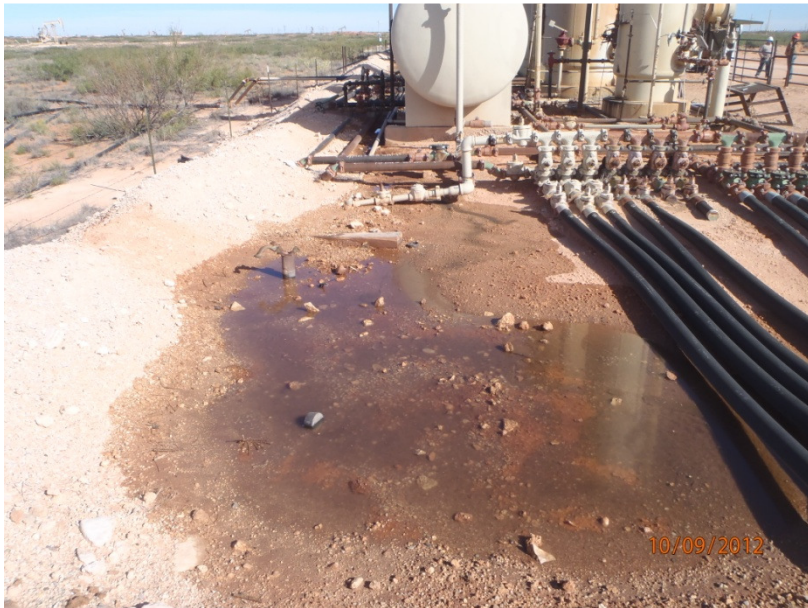
Initial release area, facing north