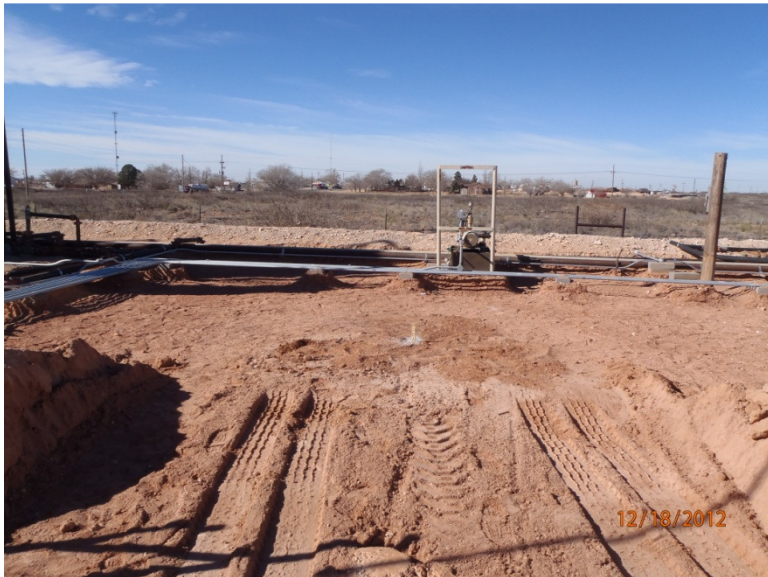
Completed SB-1, facing west