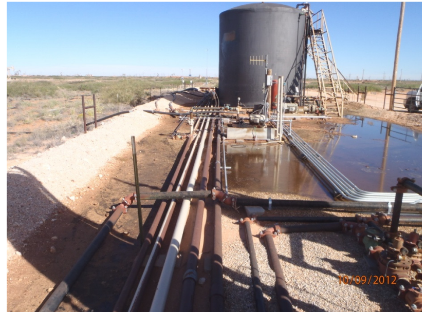
Initial release area, facing north