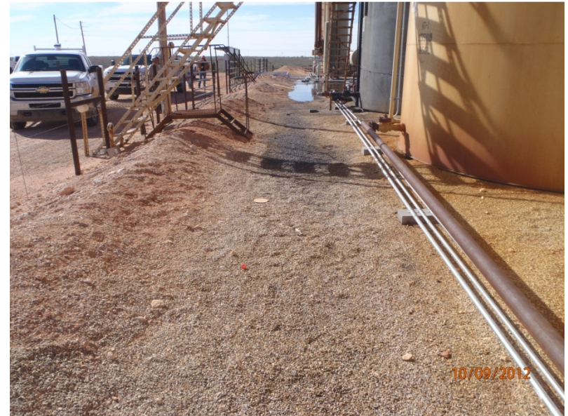
Initial release area, facing south