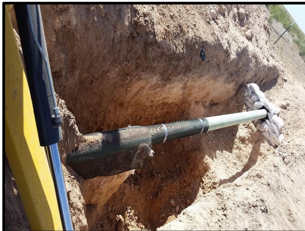
View of deeper portions of the final excavation facing southeast