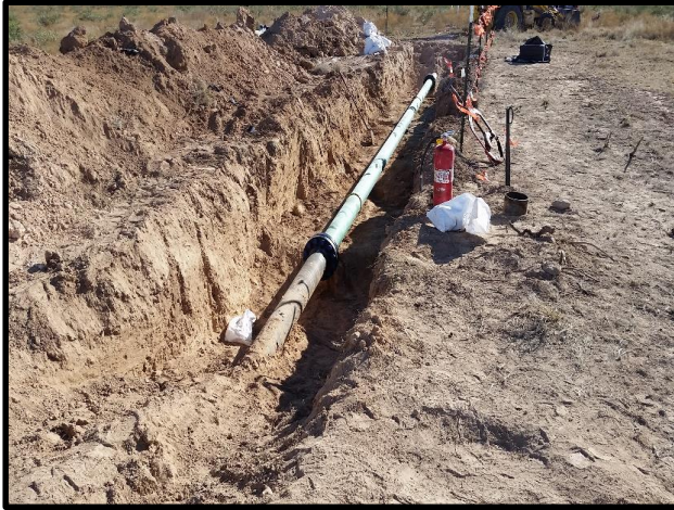
View of initial excavation facing south