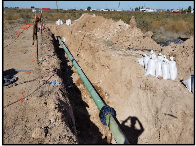
View of initial excavation facing north