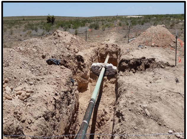
View of final excavation facing south