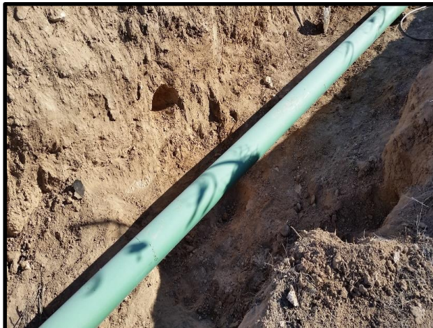
View of initial excavation facing southeast in the vicinity of the release point