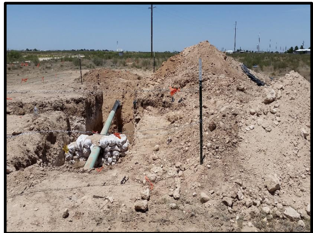
View of final excavation facing north