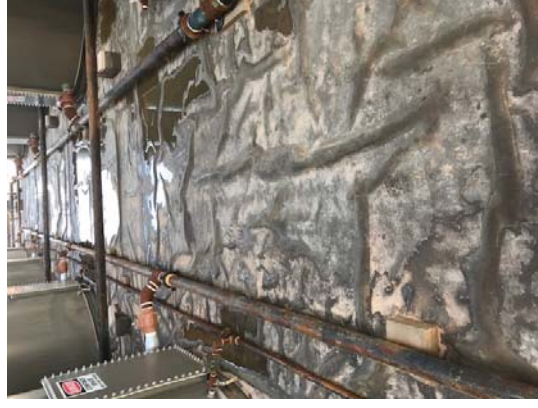
Photograph 4: Cleaned liner.