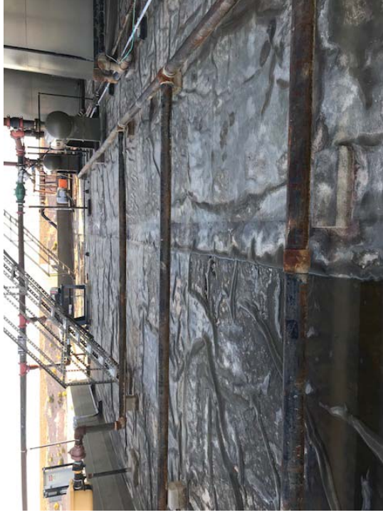
Photograph 1: View east of liner.