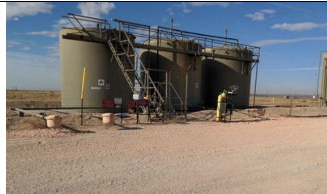
Completed compliance action. March 28-29, 2022