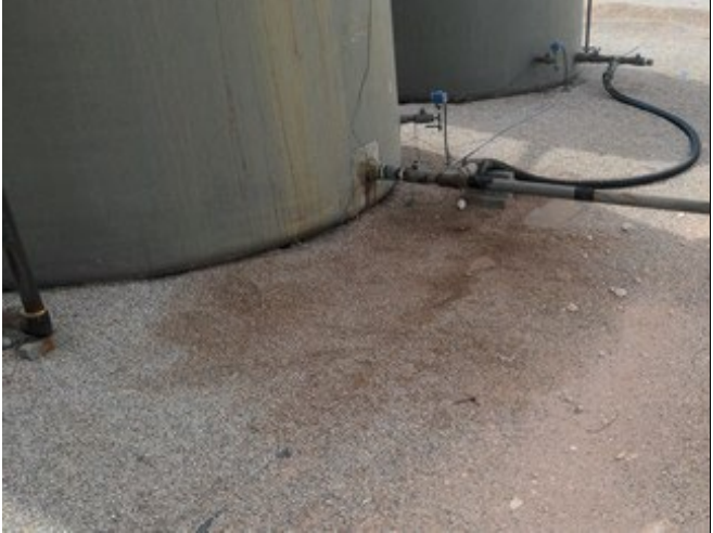
Photo of compliance action during Ameredev field inspection on 03/18/2022.