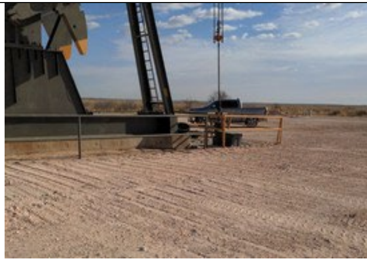
Completed compliance action. March 28-29, 2022