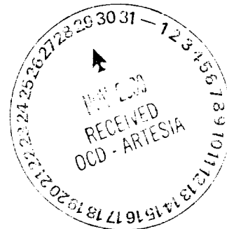
Chart to NMOCCD.

I hereby certify that the information above is true and complete to the best of my knowledge and belief.