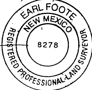
Earl Foote Registered Professional Surveyor New Mexico Certificate No. 8278

170.7 feet of proposed road in Section 36, T-17-S, R-30-E, N.M.P.M., Eddy County, New Mexico