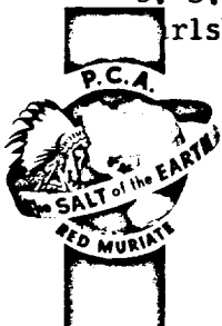
EXHIBIT 5 HALE UNIT AREA