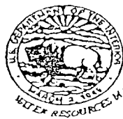
EXHIBIT 'E': 5 Pages: