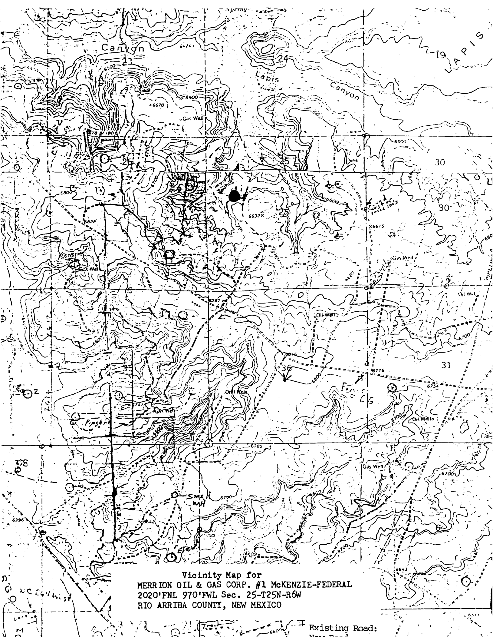
Vicinity Map for MERRION OIL & GAS CORP. #1 MCKENZIE-FEDERAL 2020'FNL 970'FWL Sec. 25-T25N-R6W RIO ARRIBA COUNTY, NEW MEXICO