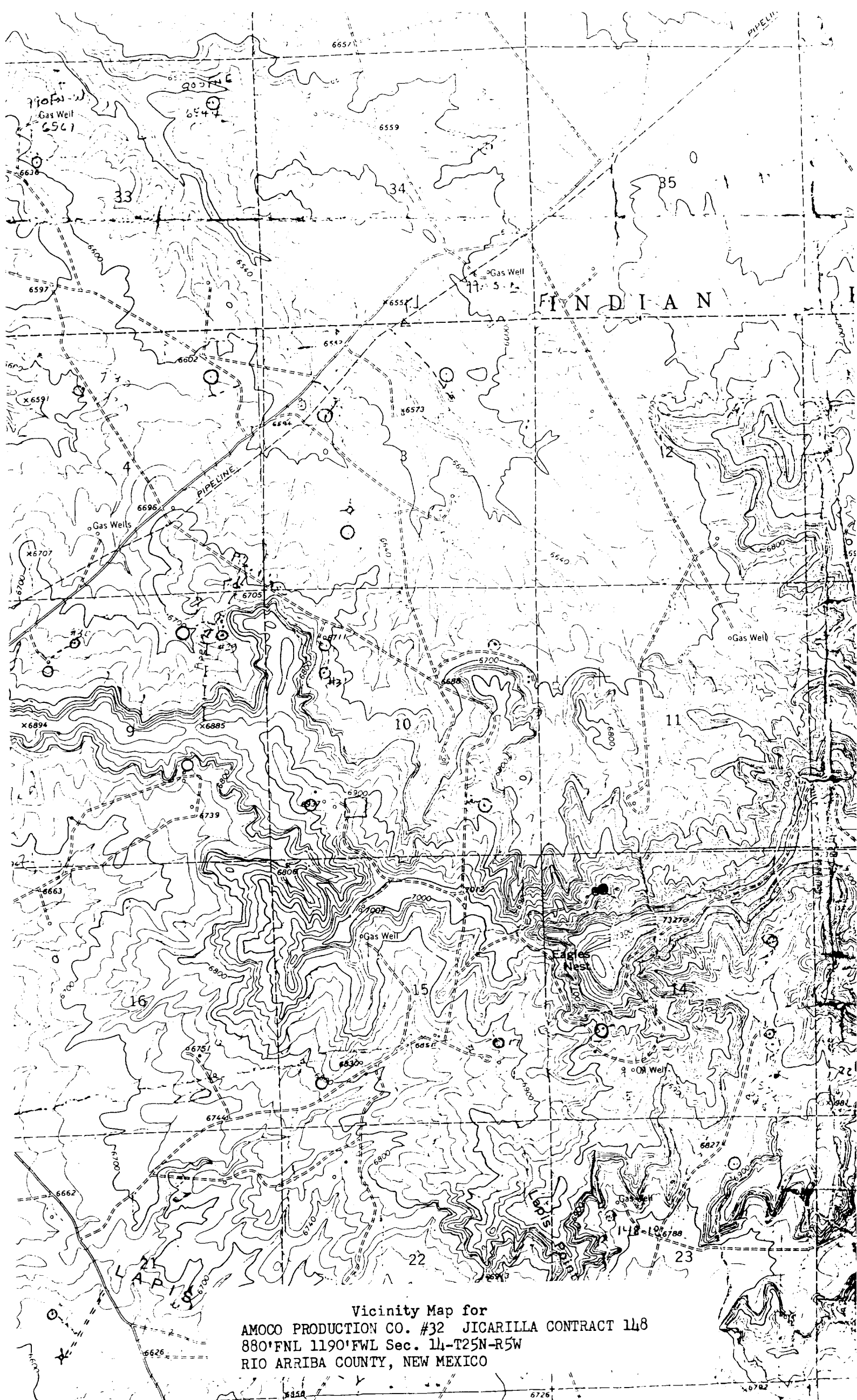
Vicinity Map for AMOCO PRODUCTION CO. #32 JICARILLA CONTRACT 148 880'FNL 1190'FWL Sec. 14-T25N-R5W RIO ARRIBA COUNTY, NEW MEXICO