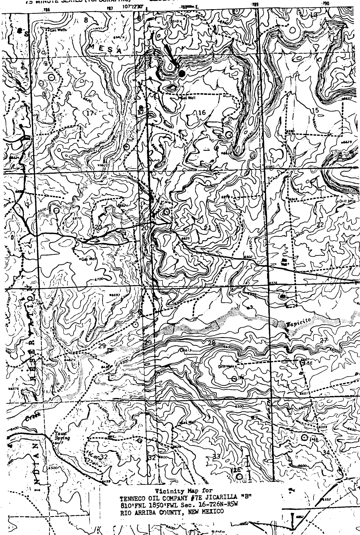
Vicinity Map for TENNECO OIL COMPANY #7E JICARILLA "B" 810'FWL 1850'FWL Sec. 16-T26N-R5W RIO ARRIBA COUNTY, NEW MEXICO