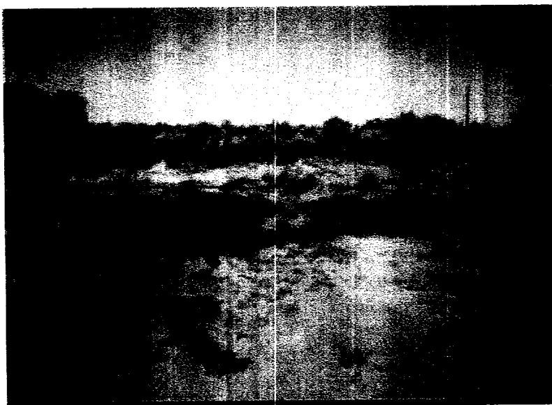
Spill Area near Production tank