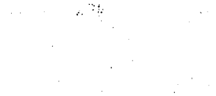
Circle with radius, chord, tangent, and secant

A circle is a set of points in a plane that are the same distance from a central point. The distance from the center to the circumference is called the radius. A line segment connecting two points on the circumference is called a chord. A line that touches the circle at exactly one point is called a tangent. A line that passes through the circle at two points is called a secant.