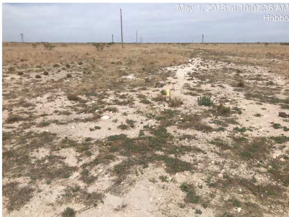
Spill Area Viewing West