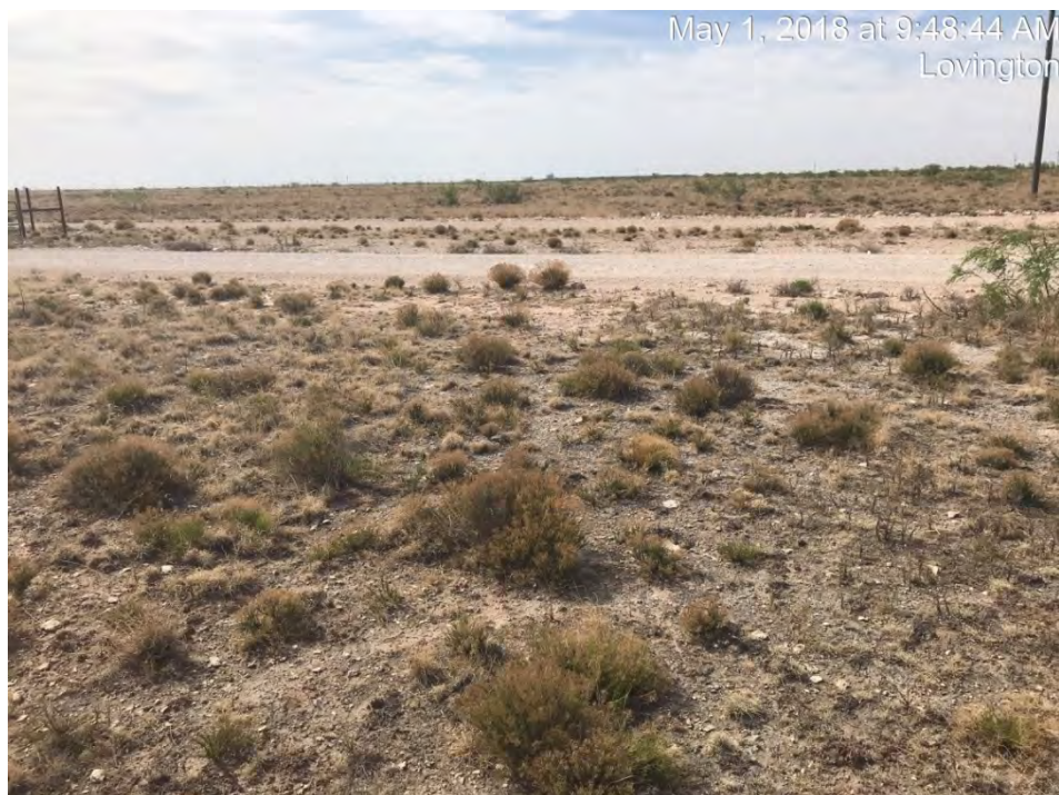
Spill Area Viewing South