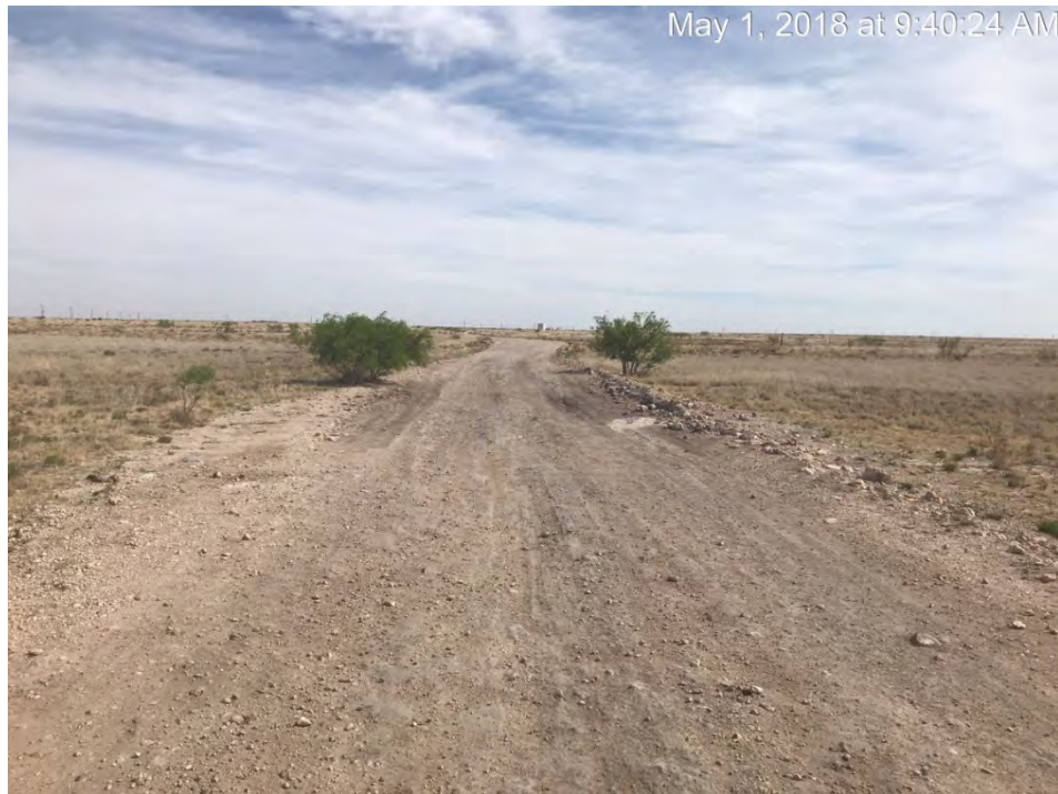
Spill Area Viewing North