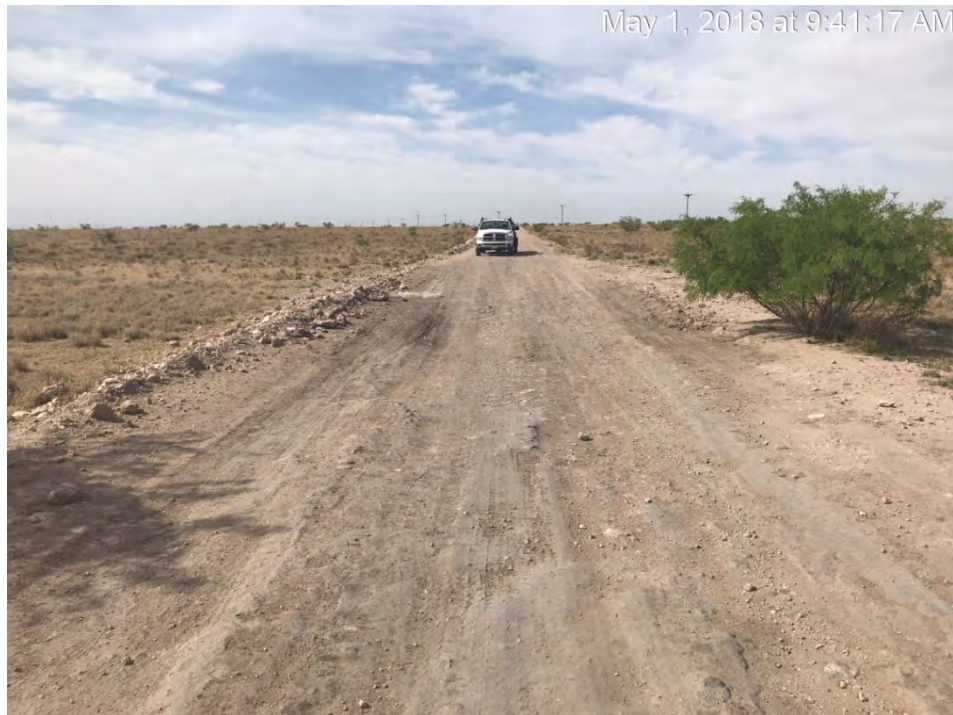
Spill Area Viewing South