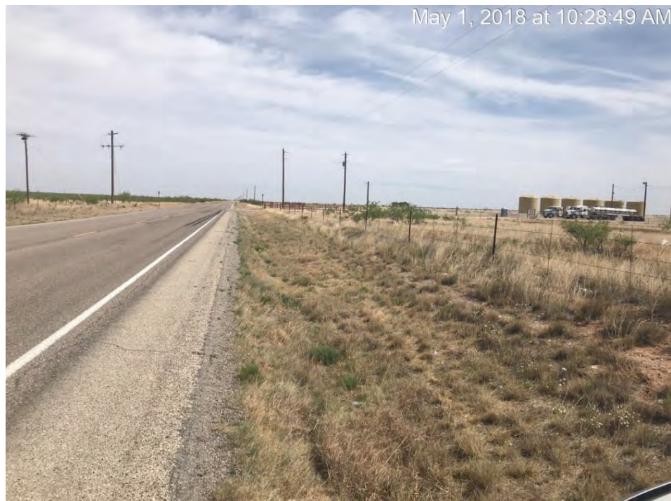
Spill Area Viewing North