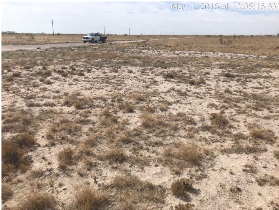
Spill Area Viewing Southeast