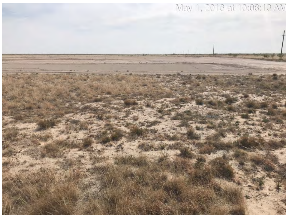
Spill Area Viewing East