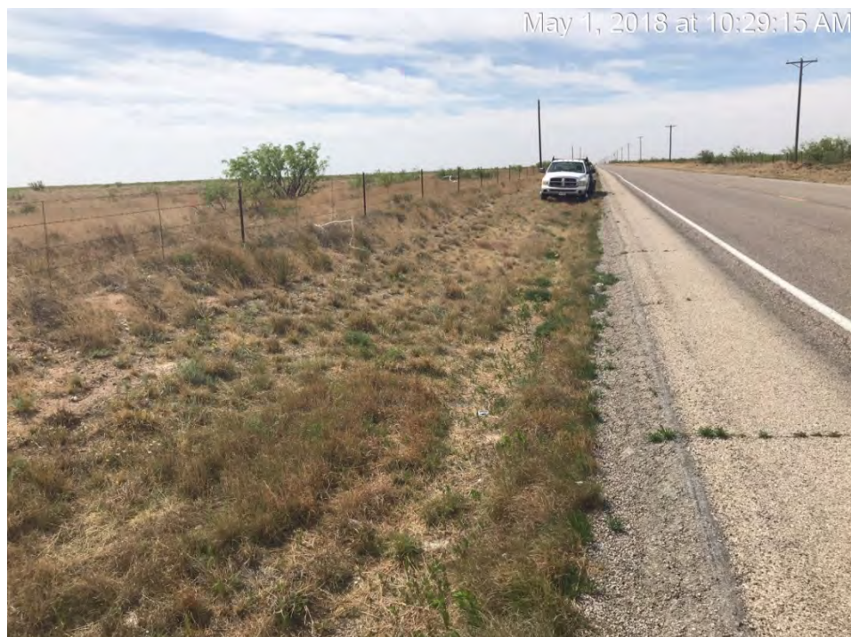
Spill Area Viewing South