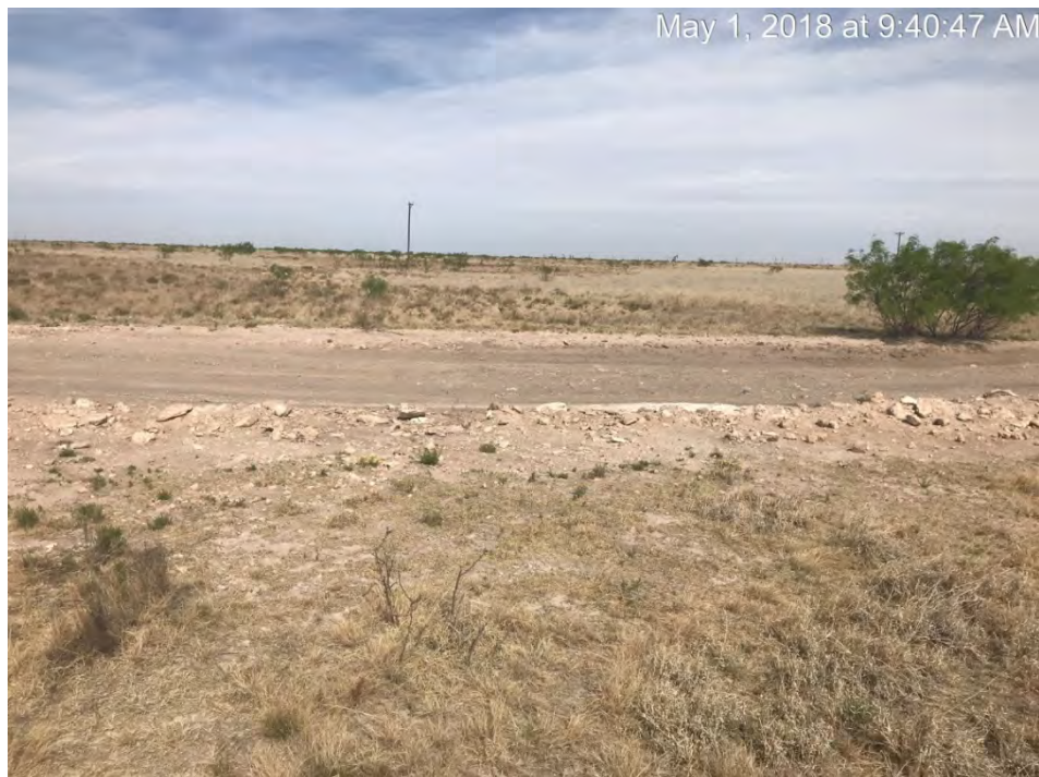
Spill Area Viewing West