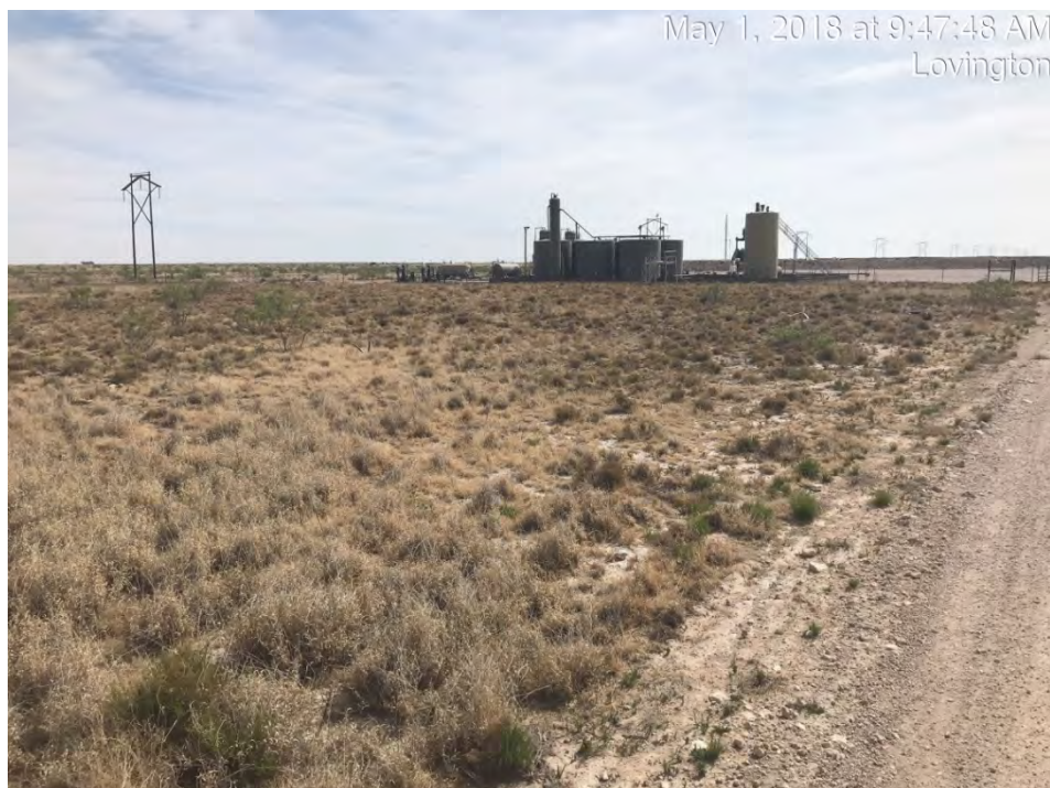
Spill Area Viewing East