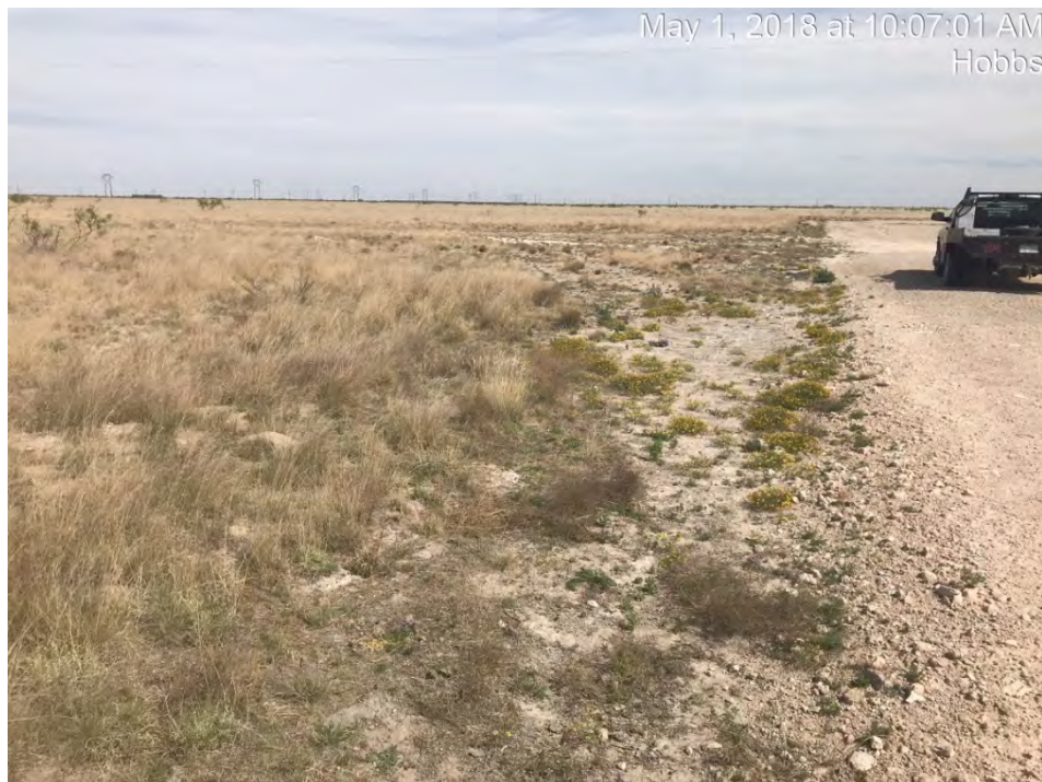
Spill Area Viewing North