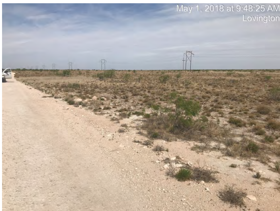
Spill Area Viewing West