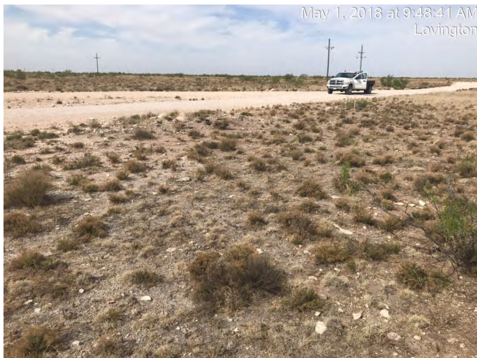
Spill Area Viewing Southwest