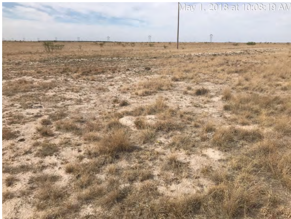
Spill Area Viewing Southwest