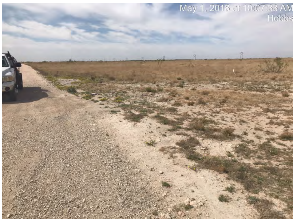
Spill Area Viewing Southwest