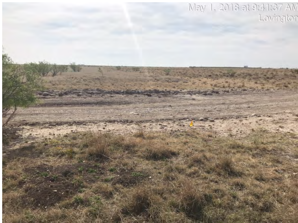
Spill Area Viewing East