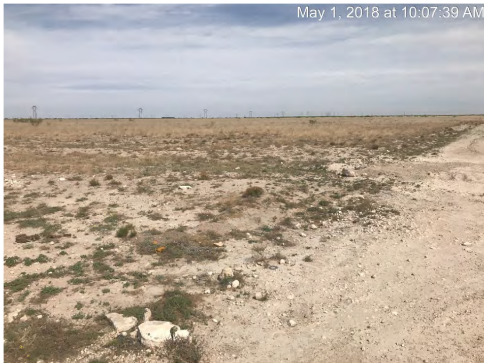
Spill Area Viewing Northwest