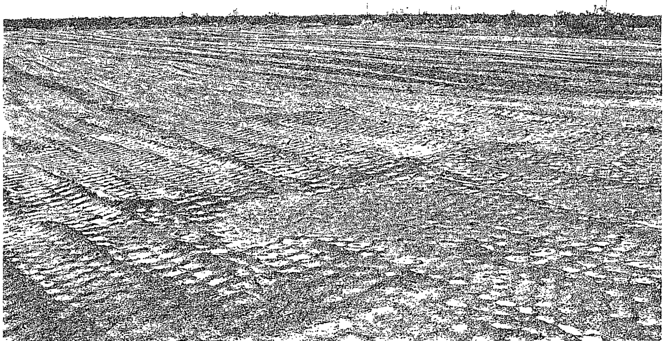
HLB Fed 27.4 restored pit - west view