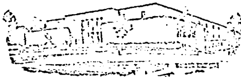
EXHIBIT #3 CASE 3789