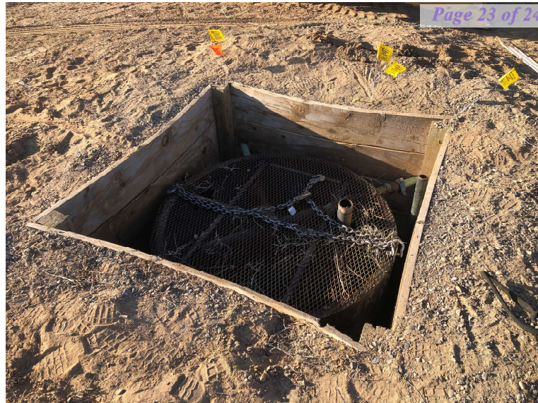
Tank B prior to removal