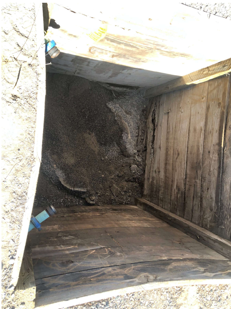
Base of tank post removal and sampling