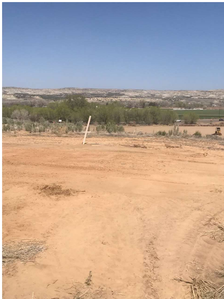
Area of tank post backfill