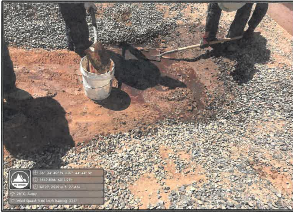
PHOTO 1: Visual Confirmation of Release Occurring During BGT Removal