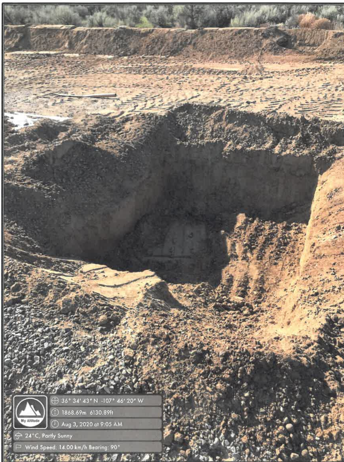
PHOTO 3: Former BGT Location after Additional Excavation during Closure Sampling (8/3/2020)