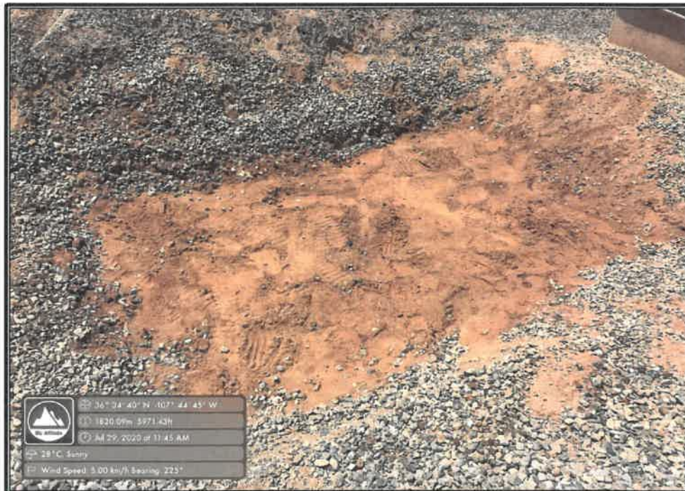
PHOTO 2: Former BGT Location after Removal and Excavation of 6" (7/29/2020)