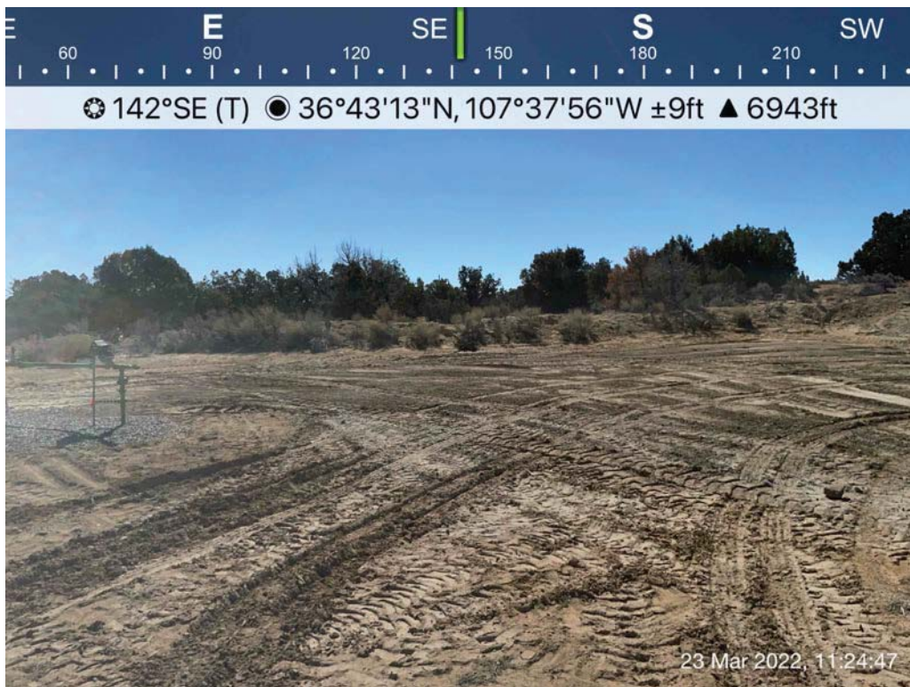
Photo 4: Former location of BGT following removal and re-grading, 3/23/2022.