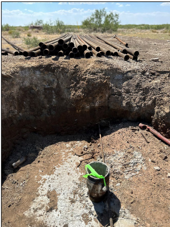
3) Artesia Metex #039 – Ribbon