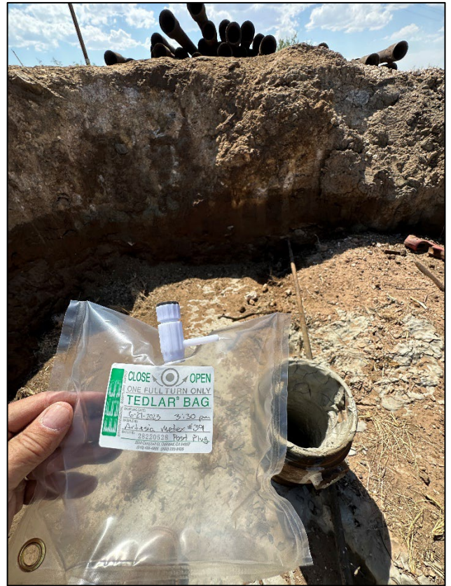
2) Artesia Metex #039 – Gas Sample