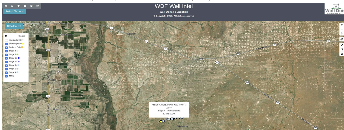
Image 1.1 – Artesia Metex #039 (30-015-00948) Orphan Well in Eddy County, NM

The site conditions found at the Artesia Metex #039 by the WDF Measure 1 Field Team on June 27, 2023, revealed a cement filled casing to within 1'-6" of the surface. The WDF Measure 1 Team took site photographs, performed field gas measurements and collected a gas sample for immediate laboratory analysis.