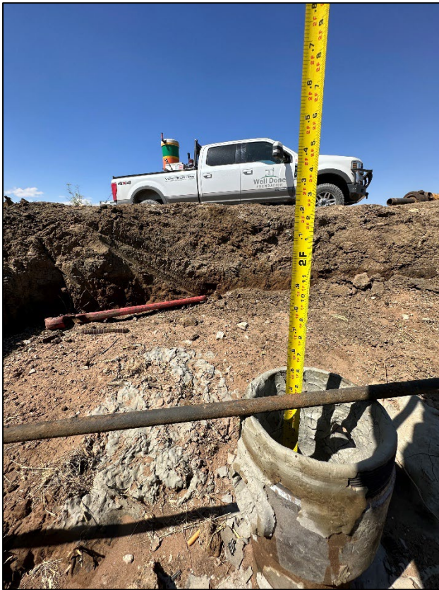
1) Artesia Metex #039 – Cement