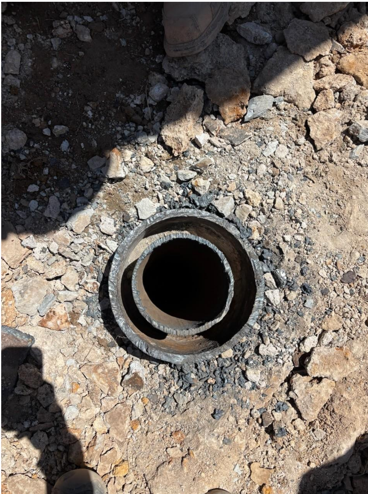
Figure 1: Cut Off