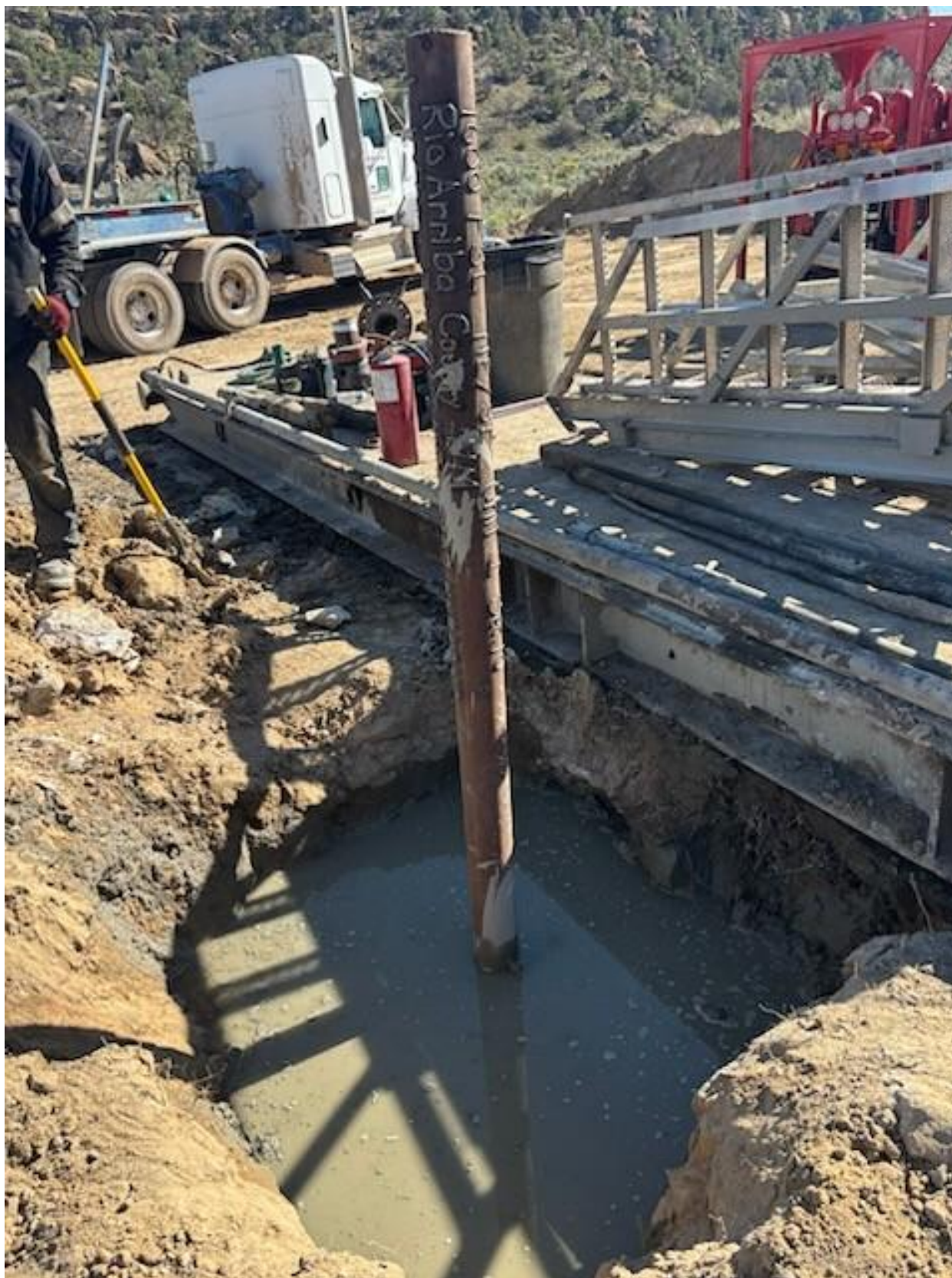
Figure 3: Marker I