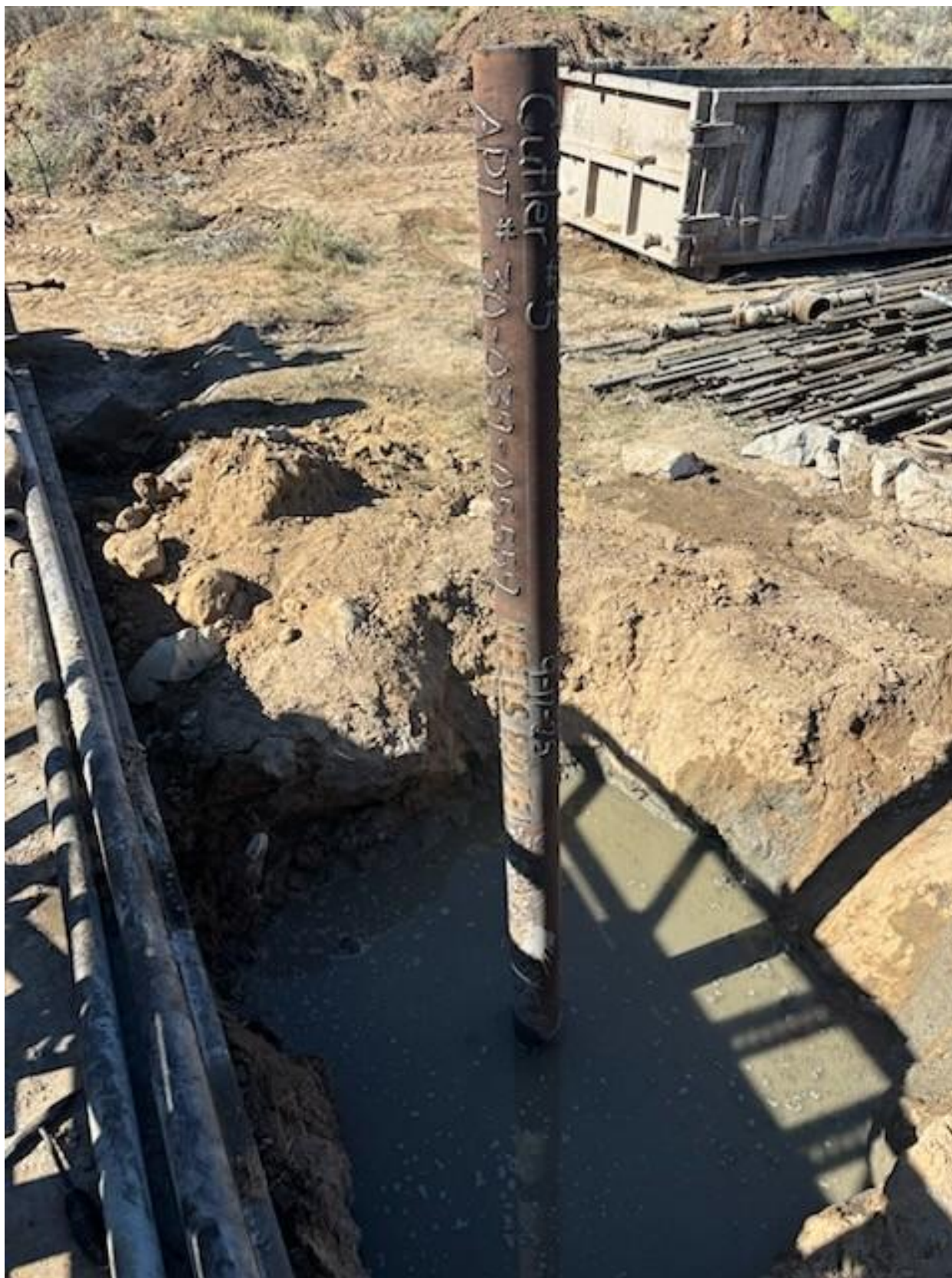
Figure 5: Marker III