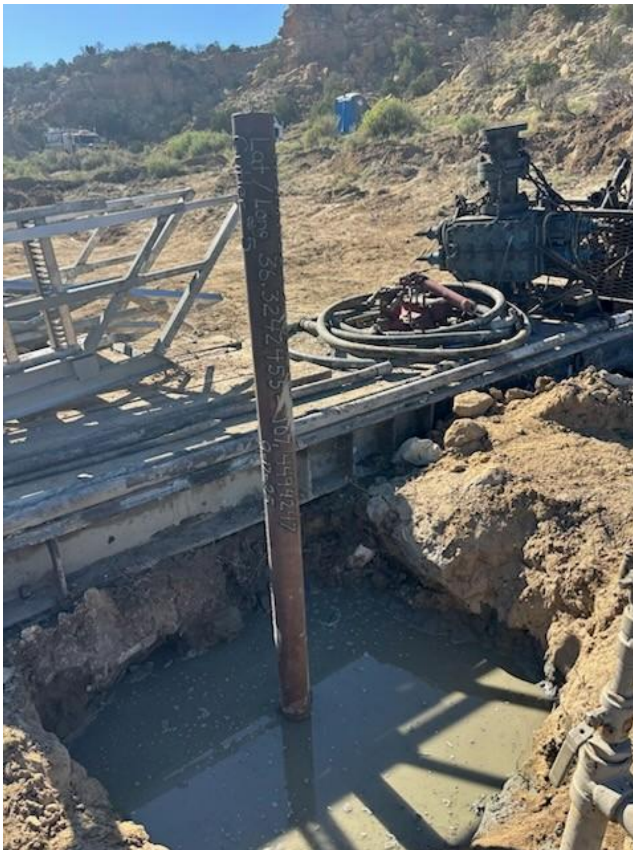
Figure 4: Marker II