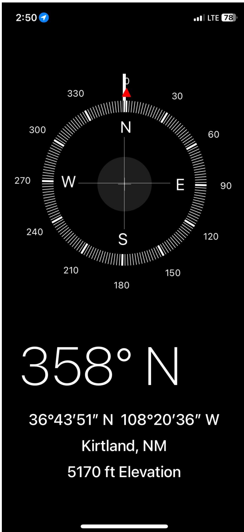
Figure 1: GPS