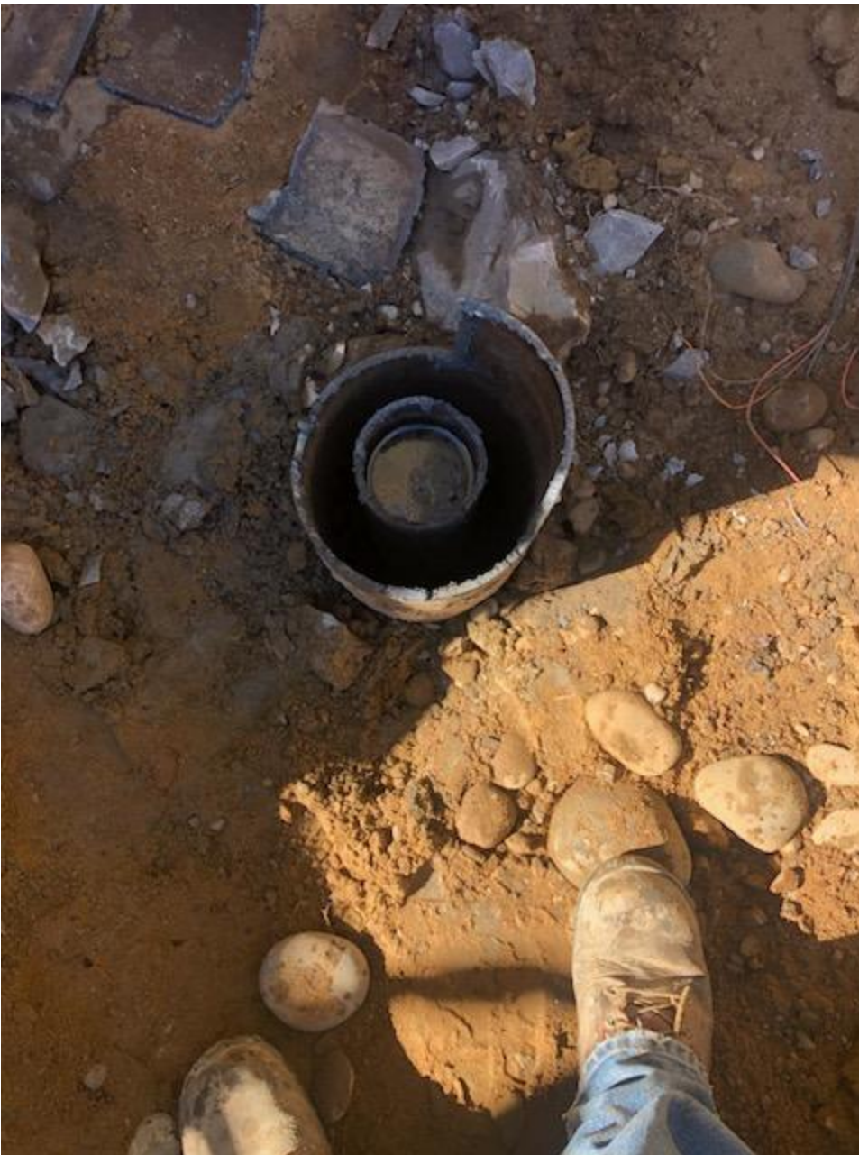
Figure 4: Cut Off