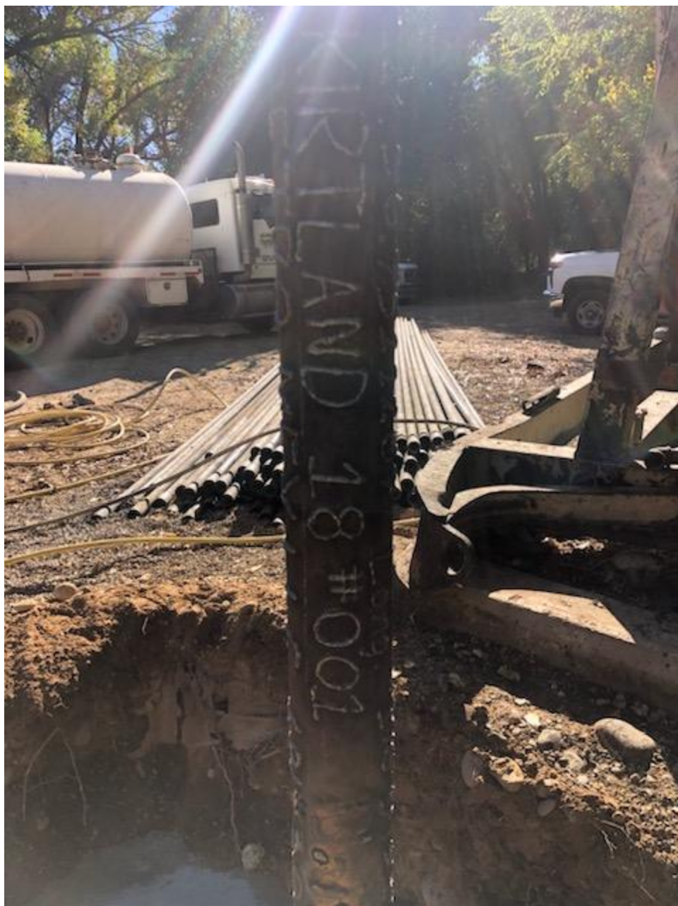
Figure 3: Marker