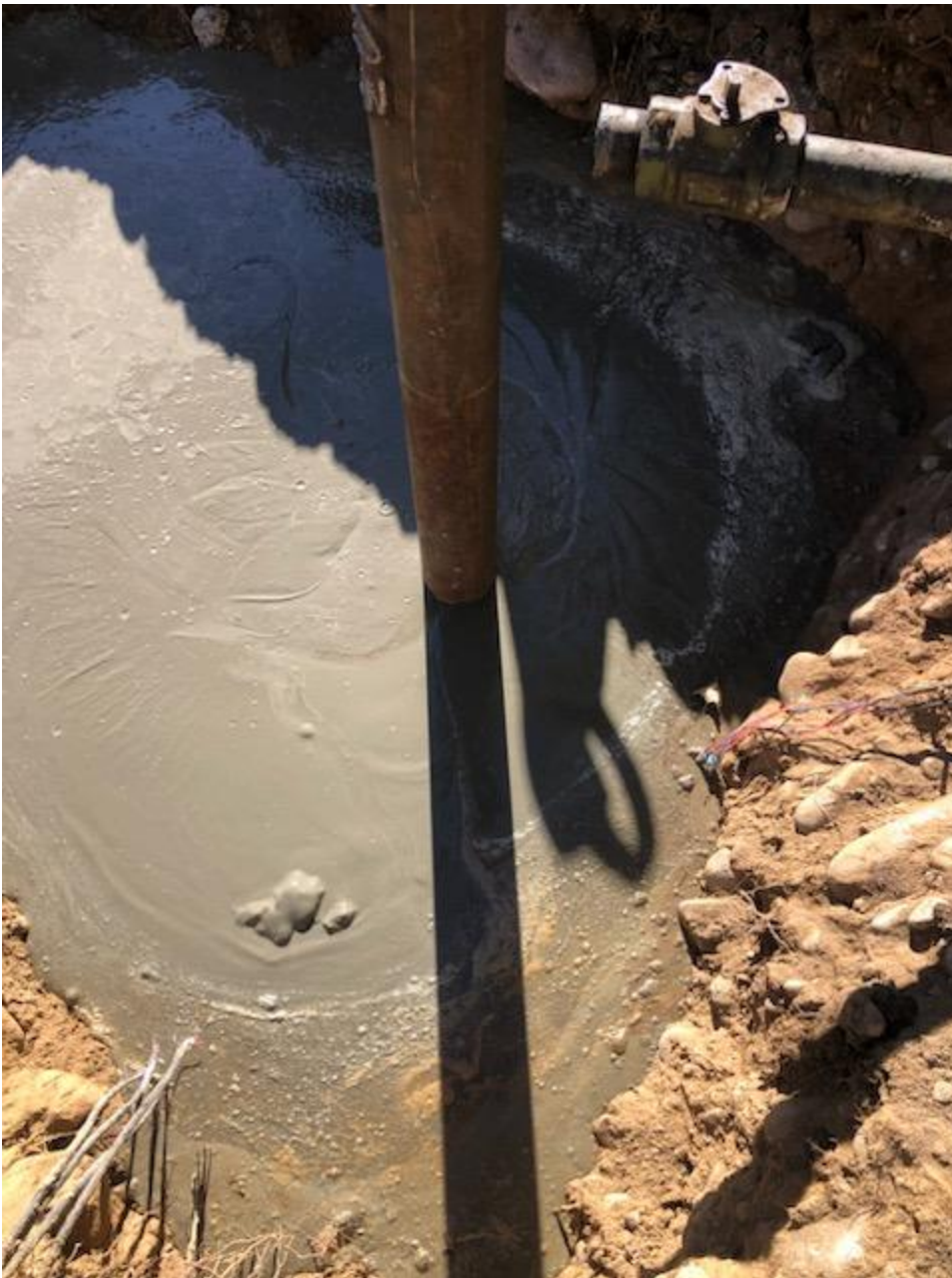
Figure 2: Top Off