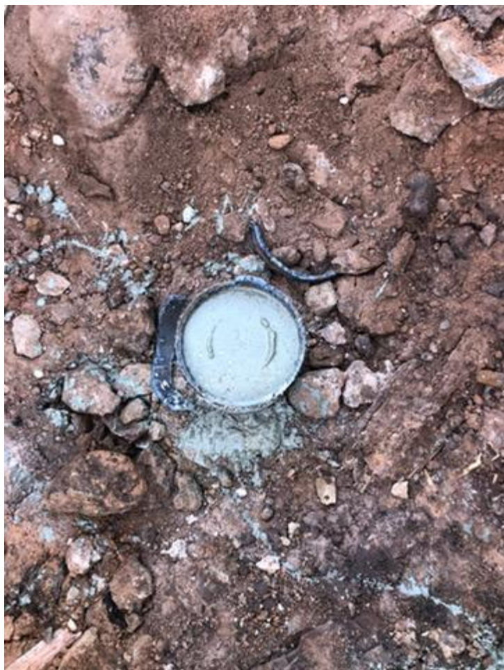
Figure 2: Top Off