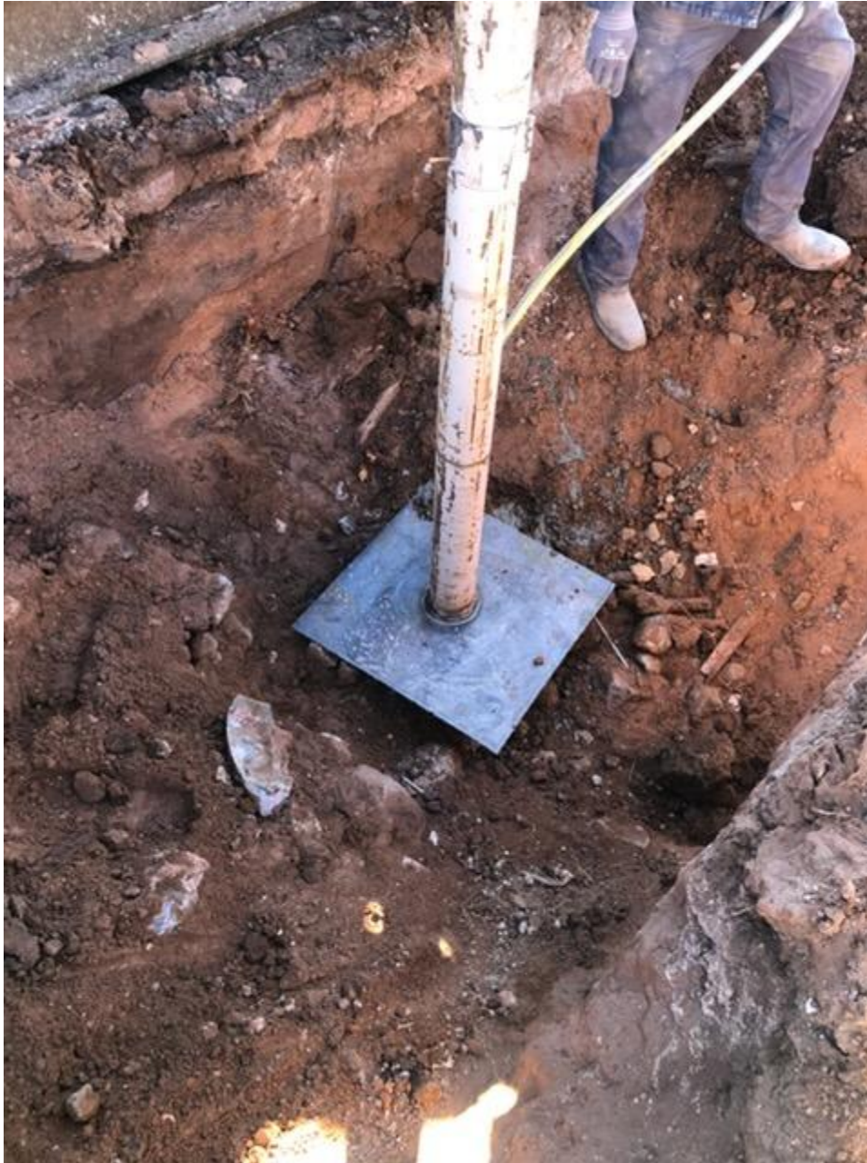
Figure 3: Marker I