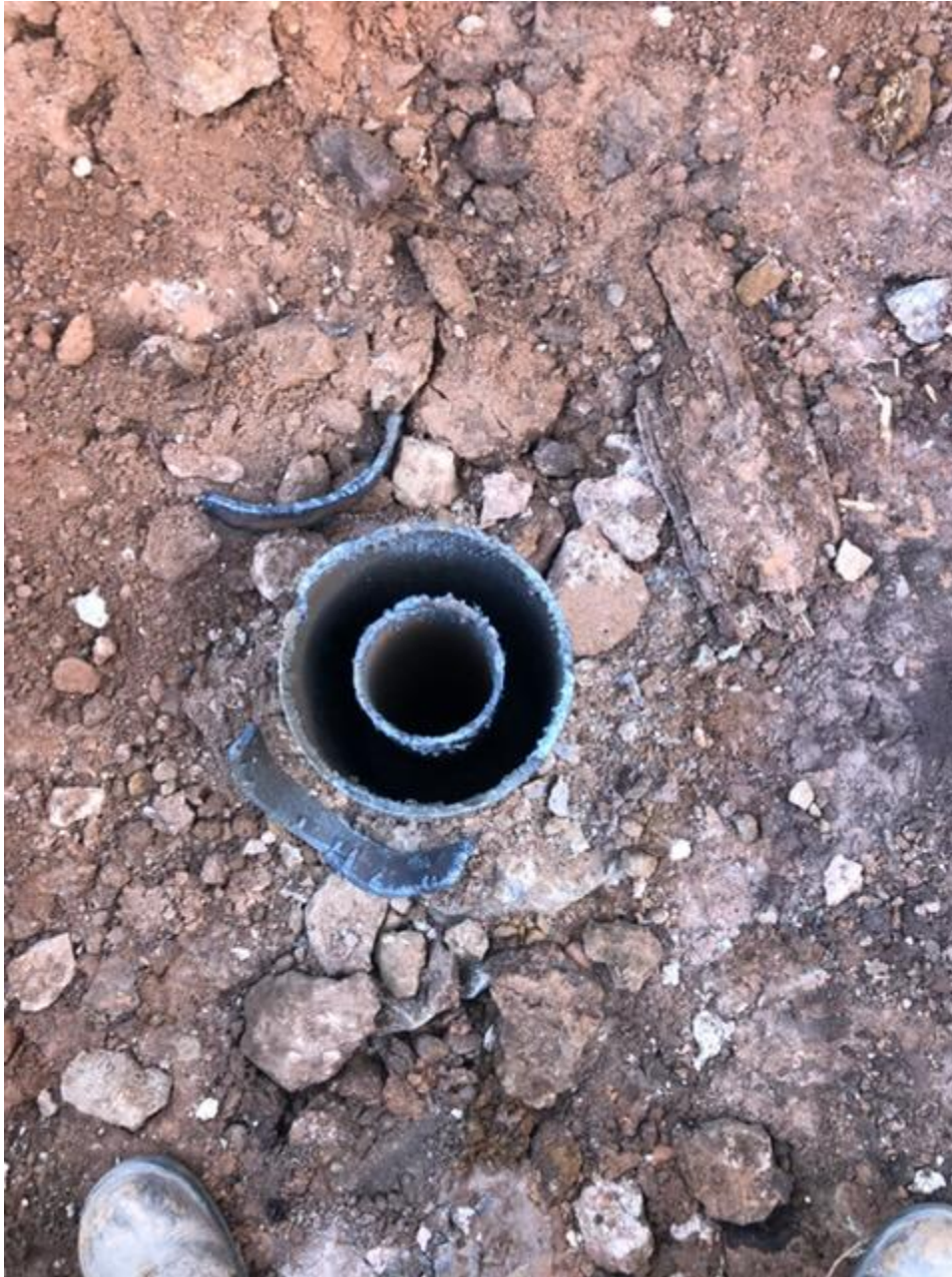
Figure 1: Cut Off