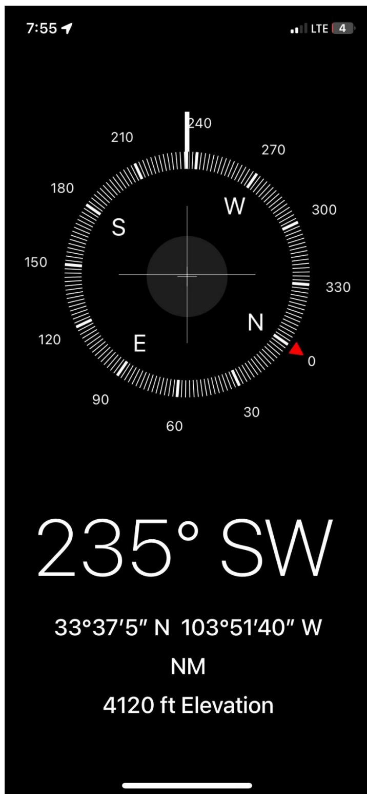
Figure 5: GPS