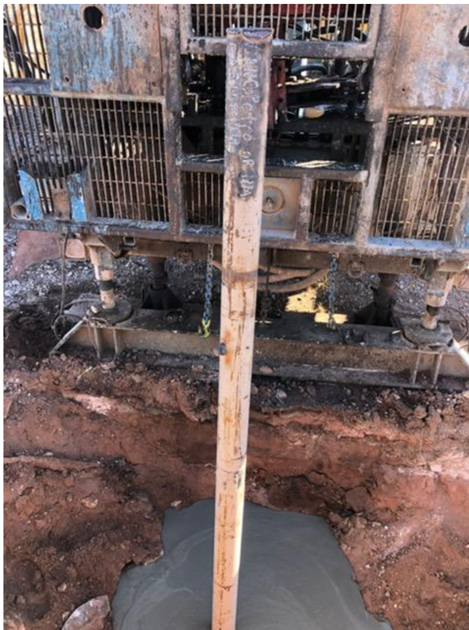
Figure 4: Marker II