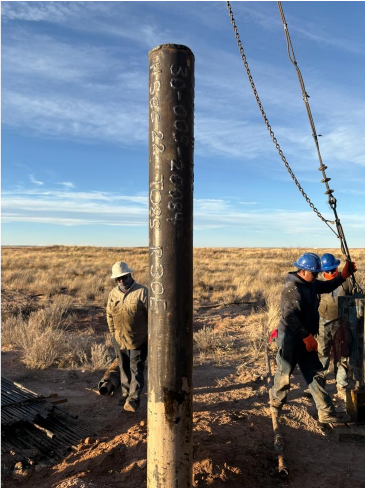
Figure 2: Marker