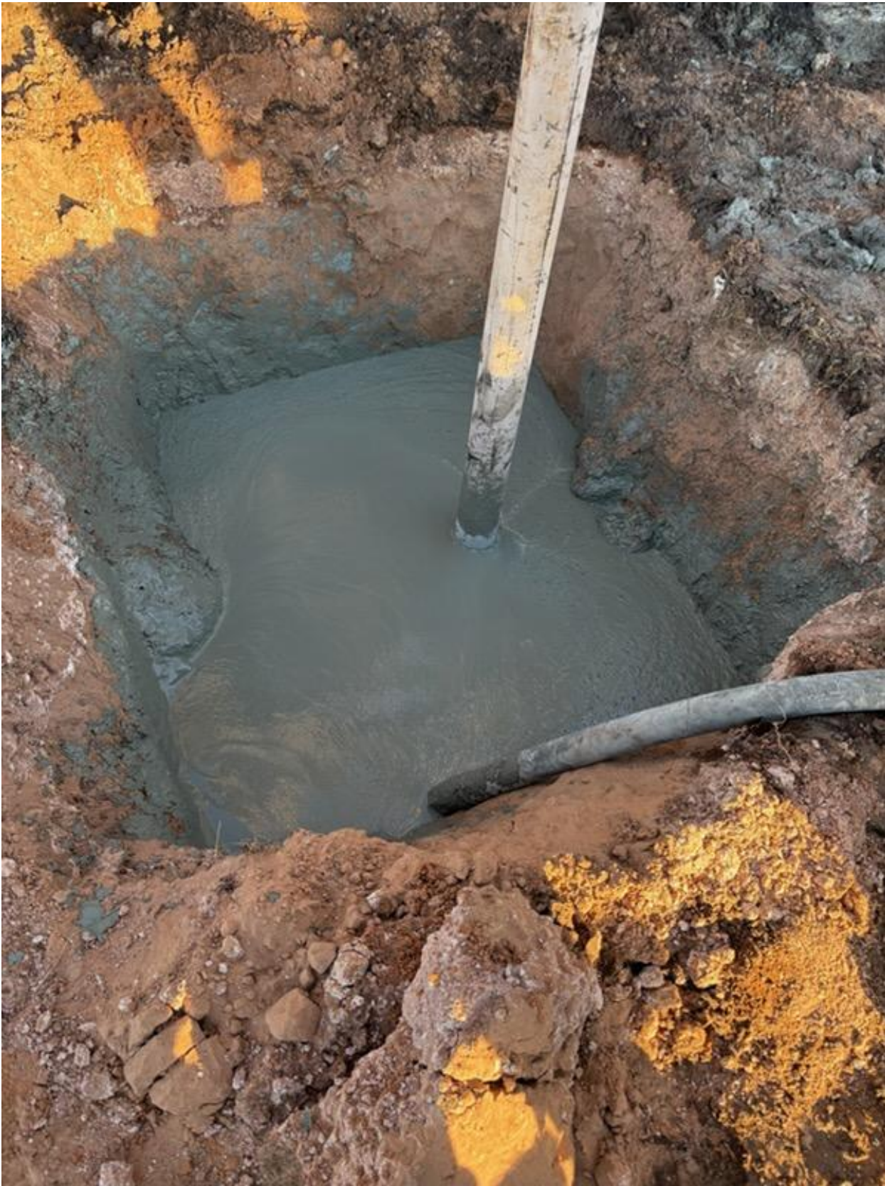
Figure 3: Top Off