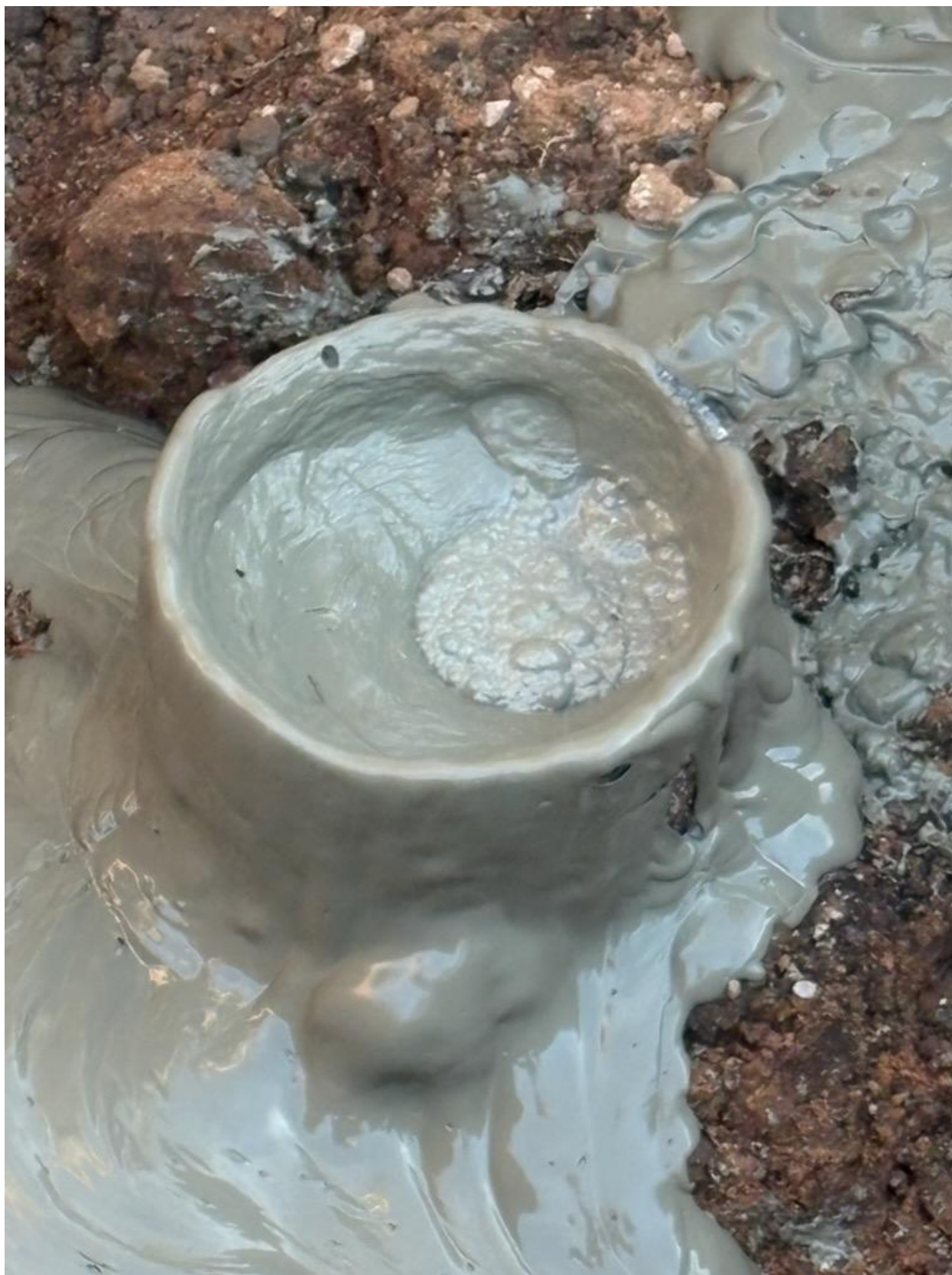
Figure 4: Top Off II