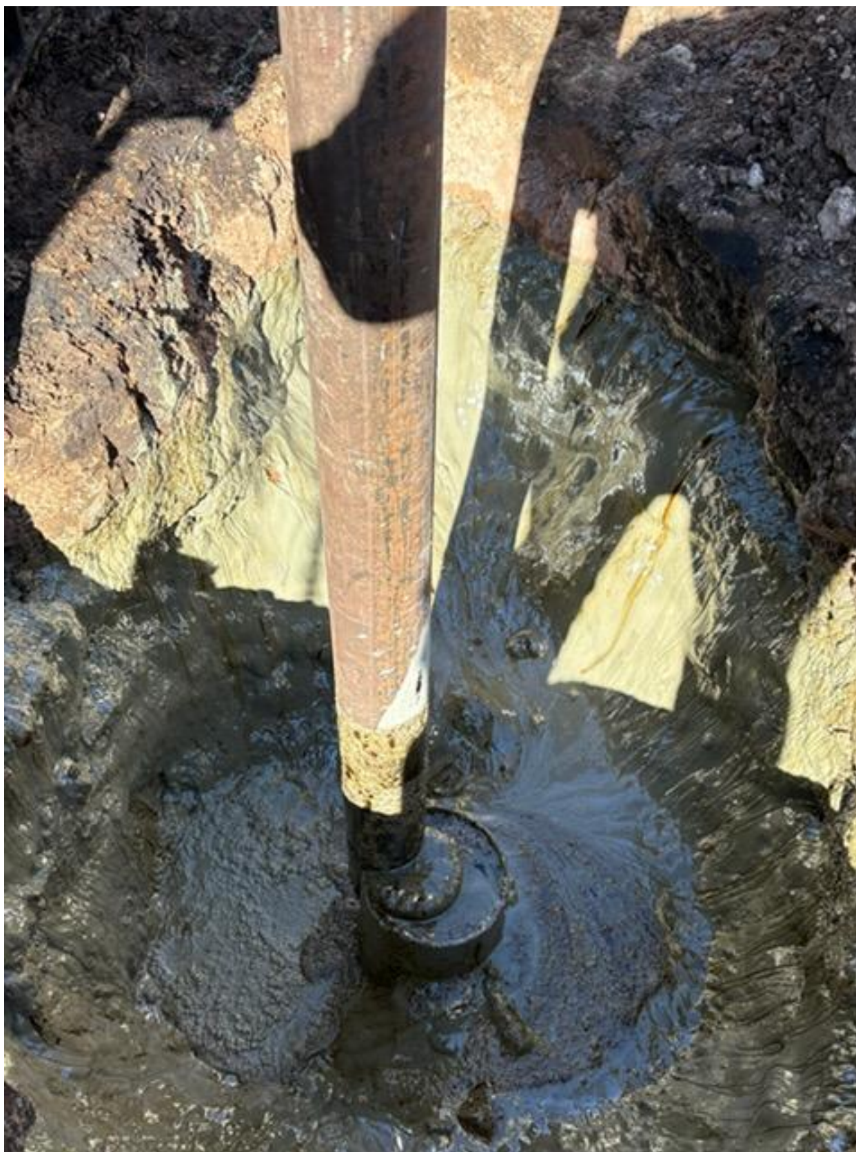
Figure 4: Marker III