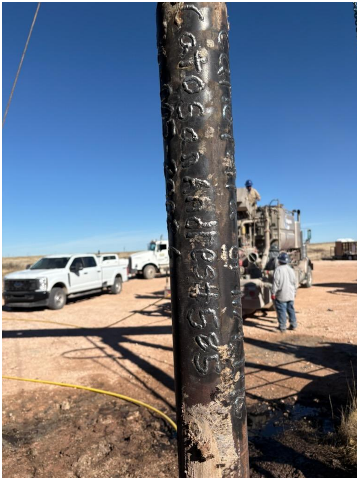
Figure 2: Marker II