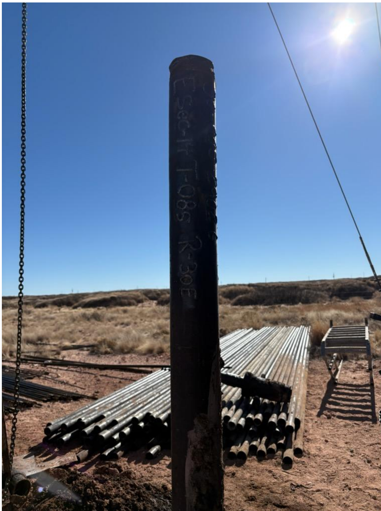
Figure 5: Marker IV