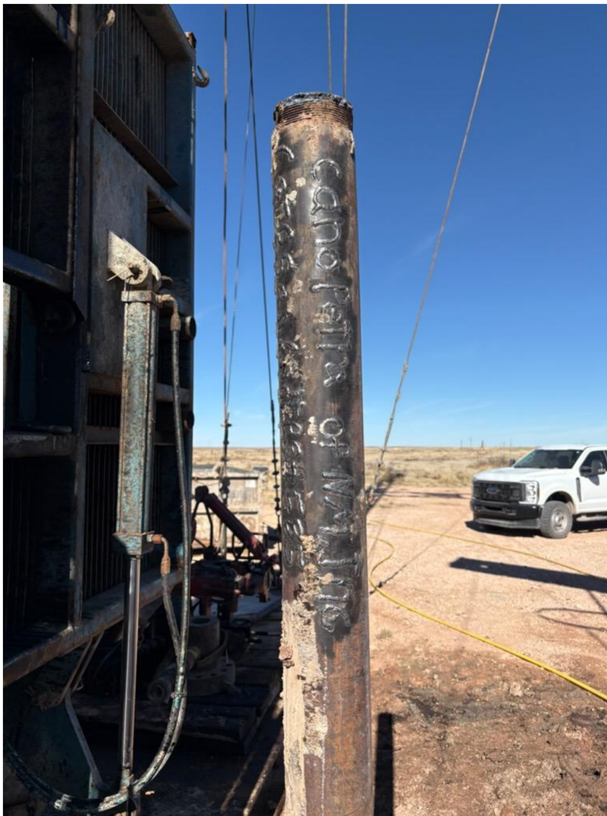
Figure 1: Marker