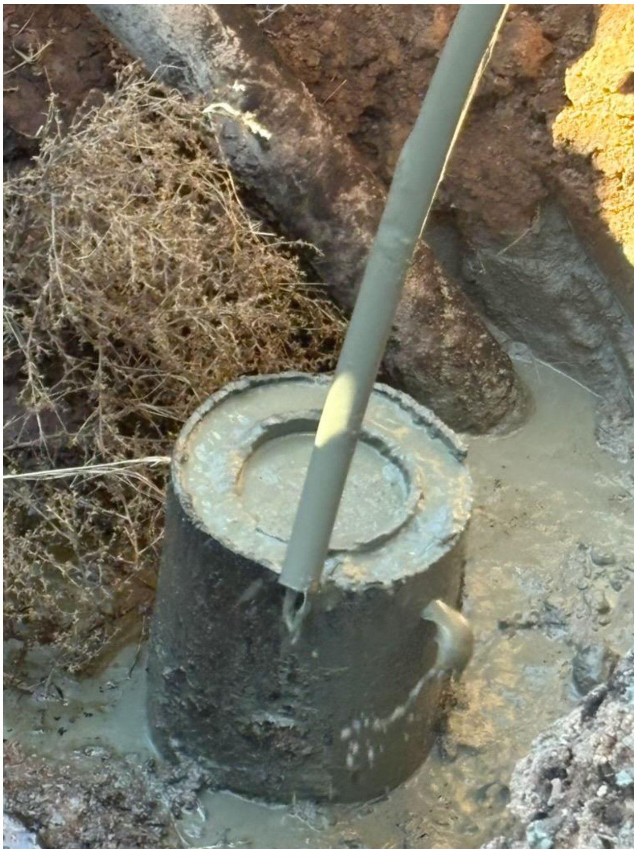
Figure 1: Top Off