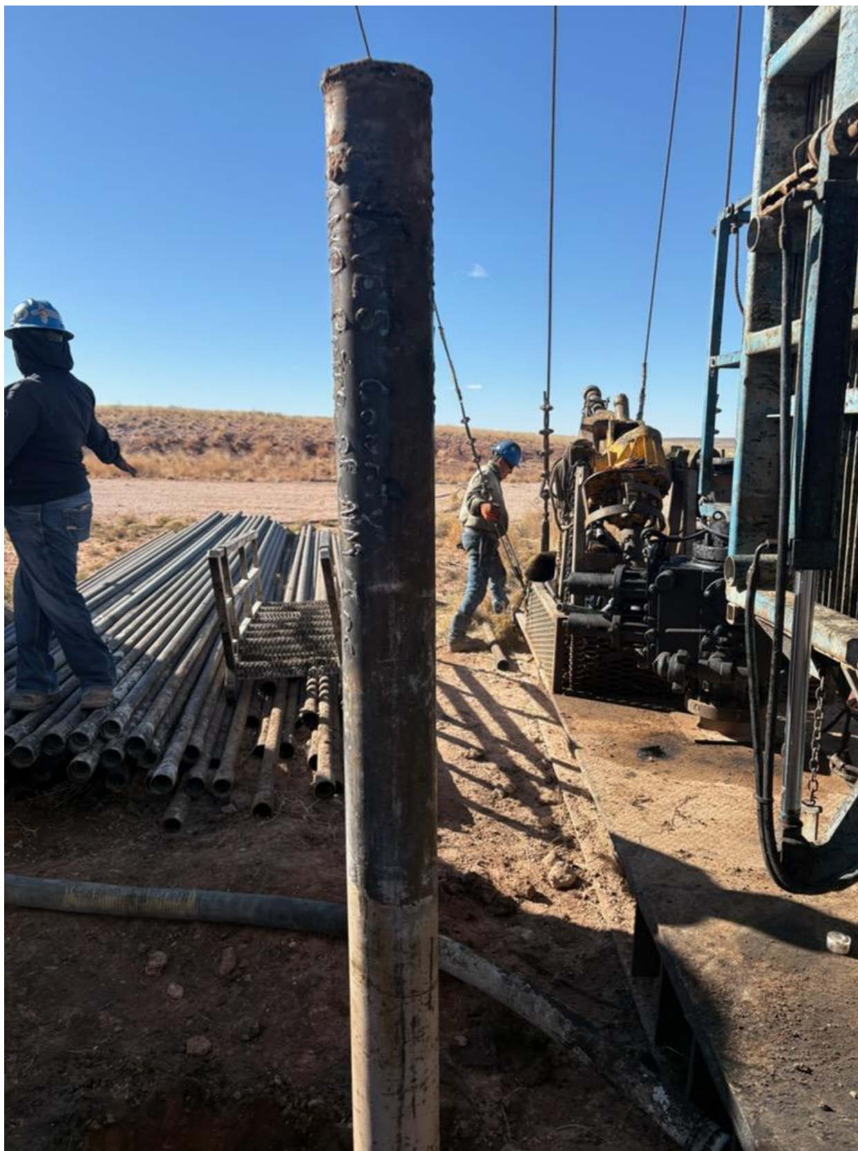
Figure 3: Marker