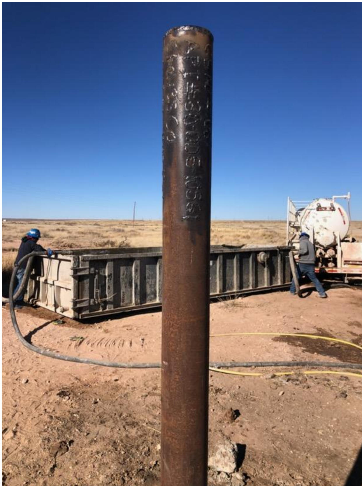
Figure 3: Marker