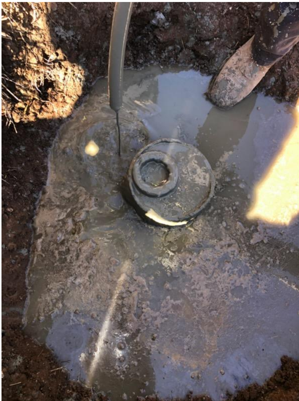
Figure 2: Top Off