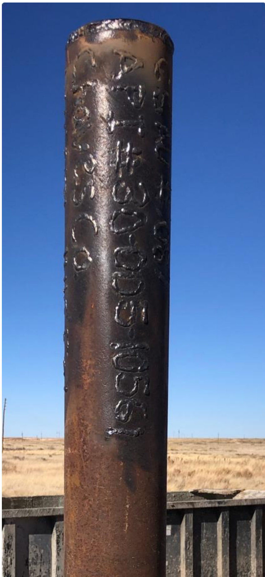
Figure 6: API