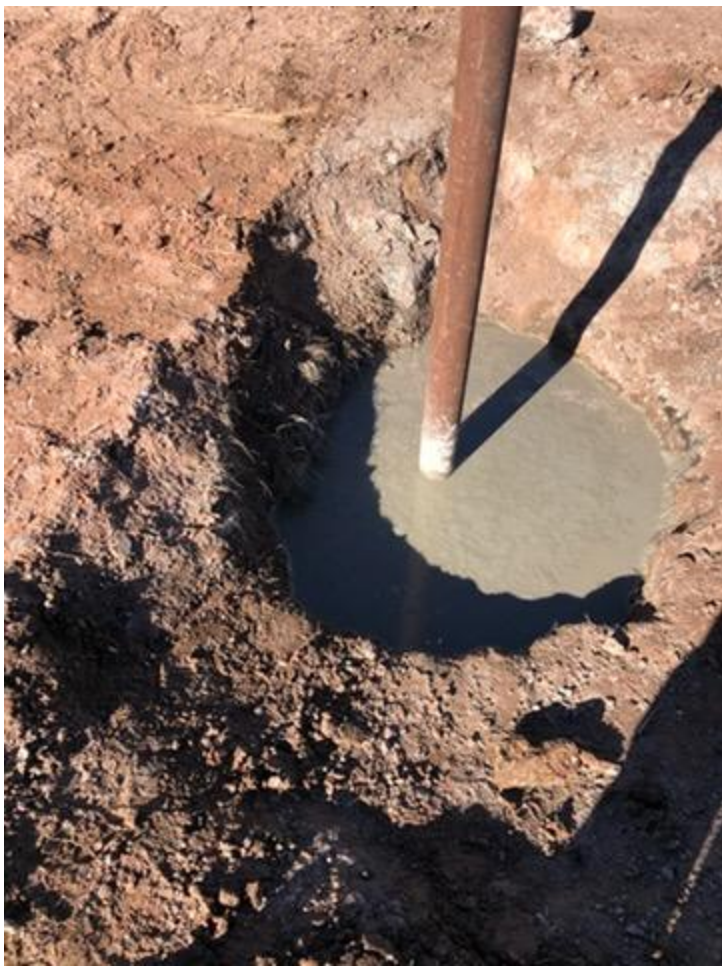
Figure 4: Top Off