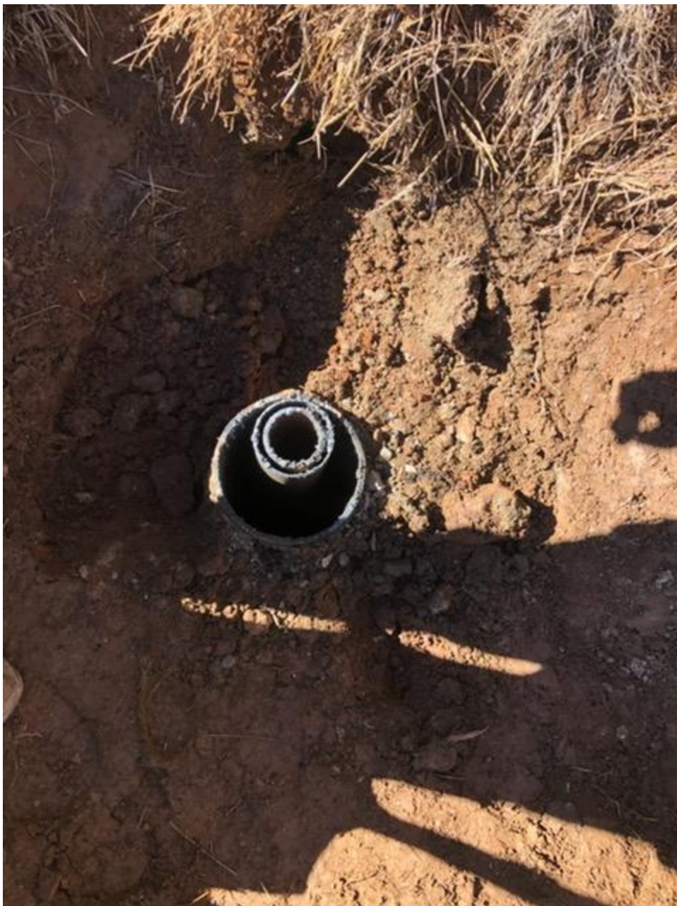
Figure 1: Cut Off