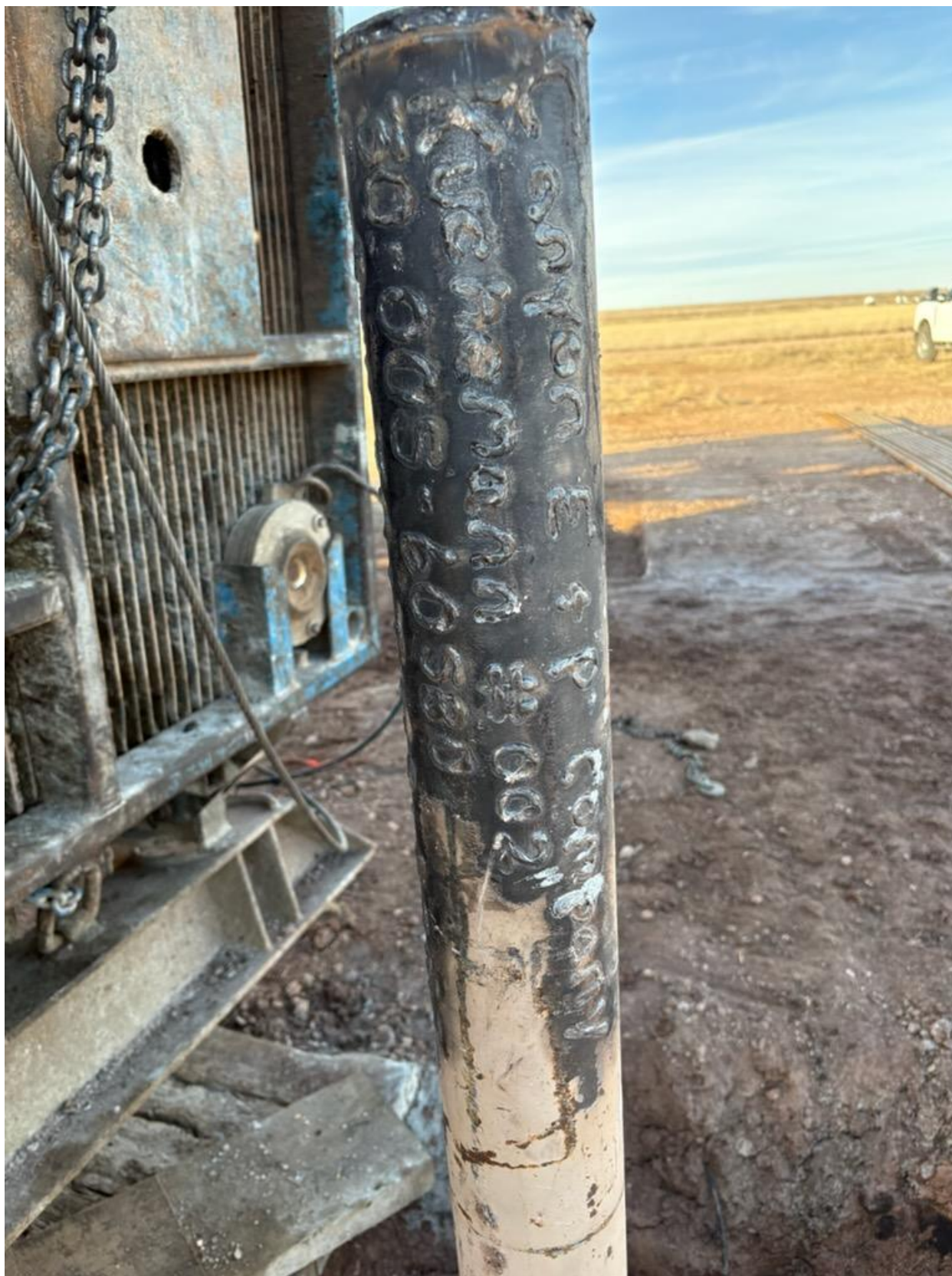
Figure 1: Marker I