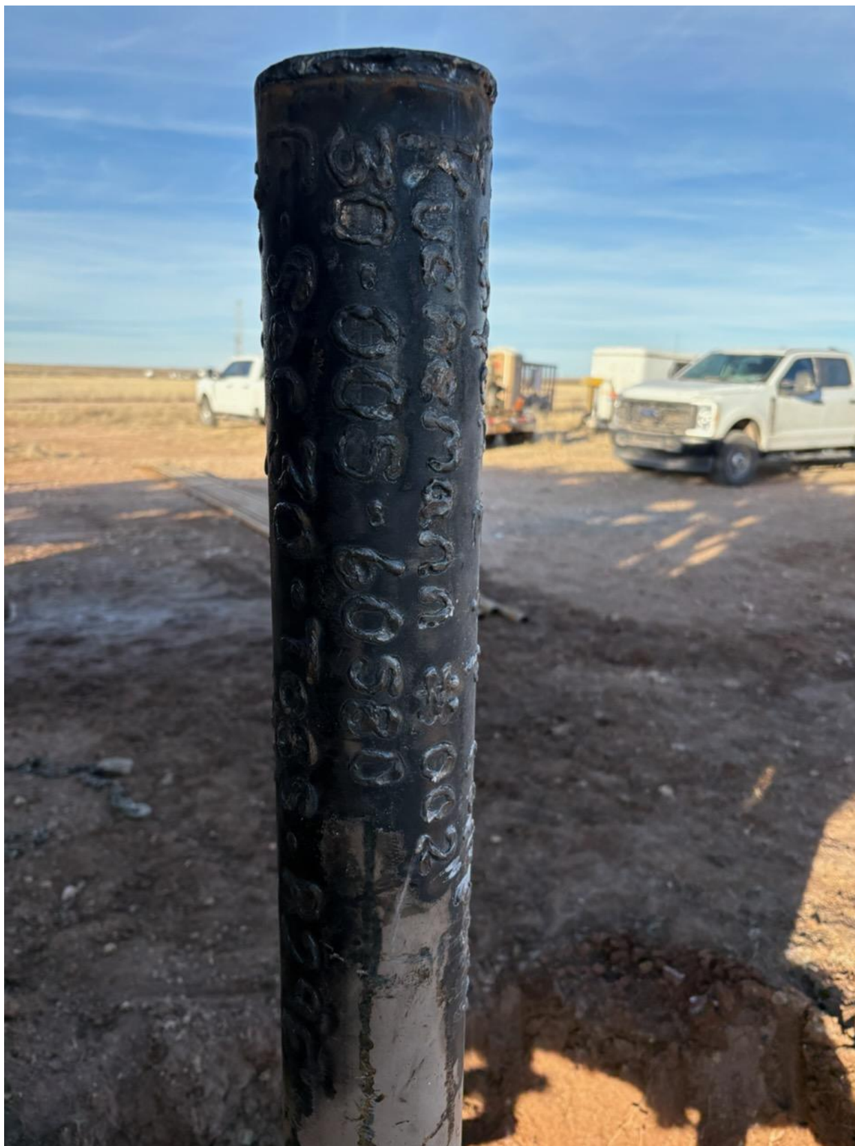
Figure 2: Marker II