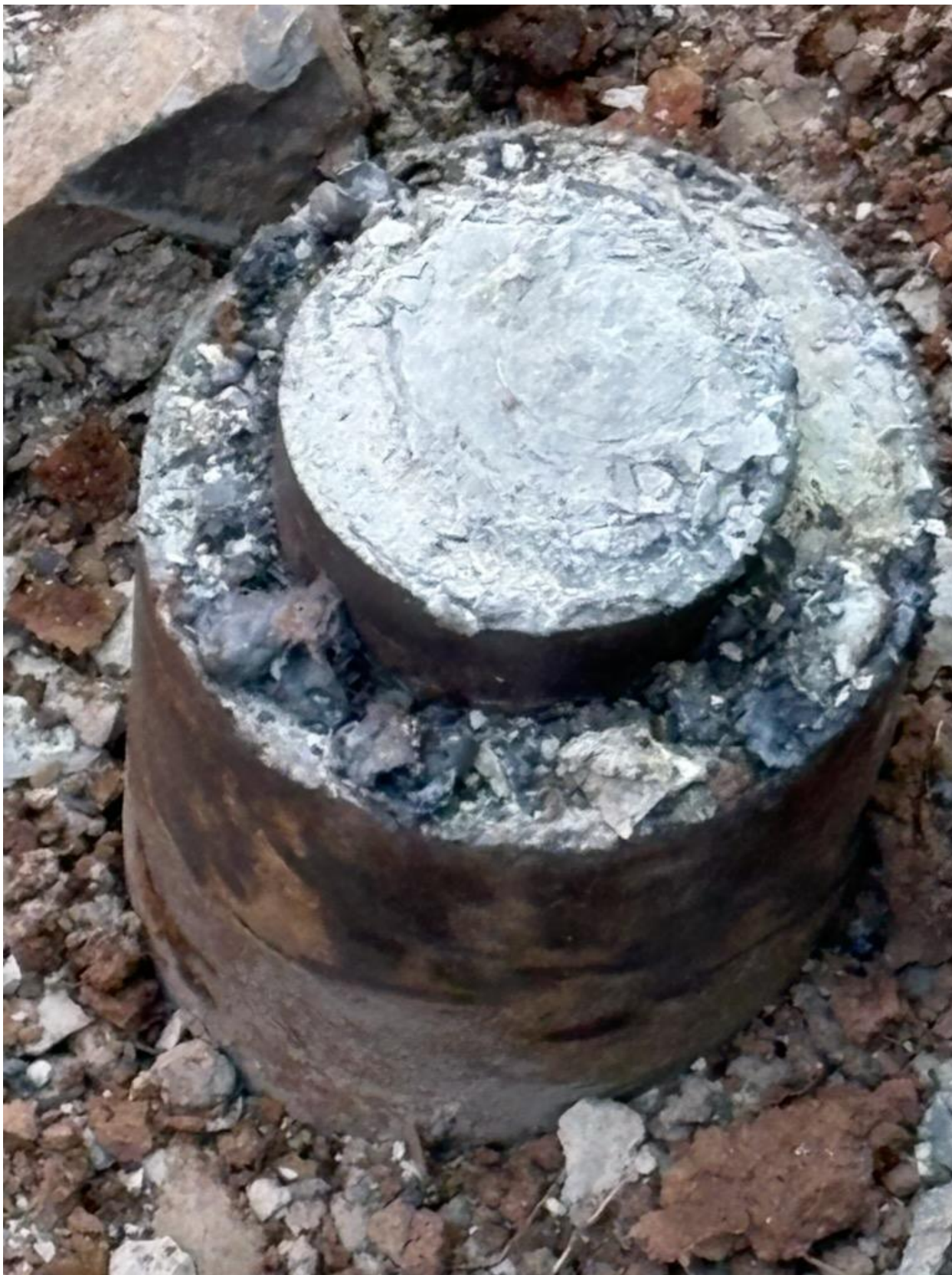
Figure 4: Cut Off