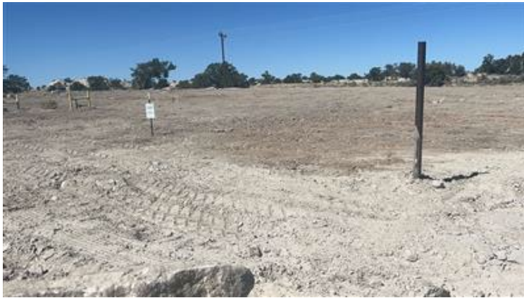
Photo 3 – BGT after remediation