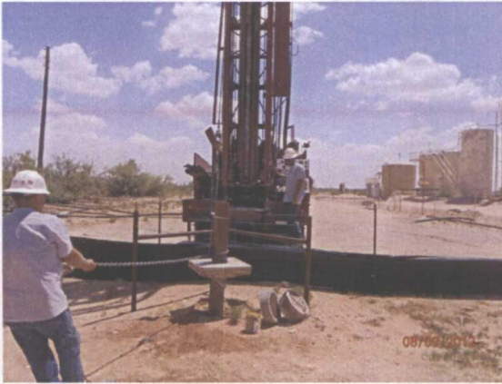
Pulling MW-1, facing south 8/9/12