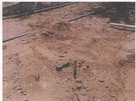
Completed plug and abandon of MW-3 8/9/12