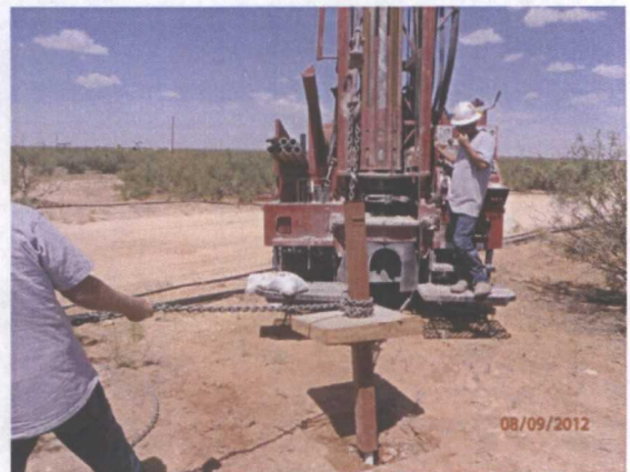
Pulling MW-3, facing northeast 8/9/12