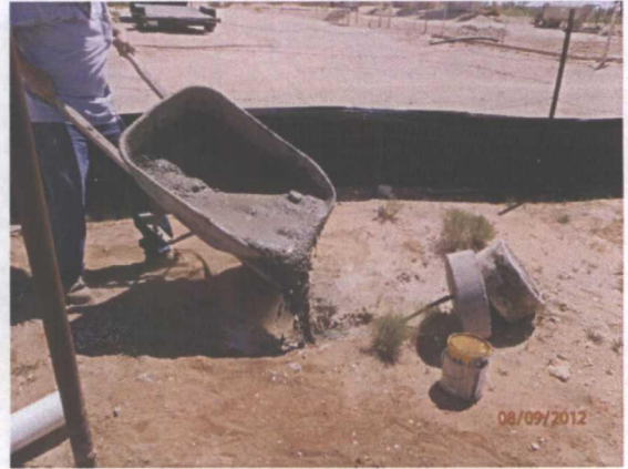
Plugging MW-1 with a 1-3% bentonite/concrete slurry, facing south 8/9/12