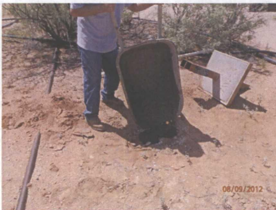
Plugging MW-3 in 1-3% bentonite/concrete slurry, facing west 8/9/12