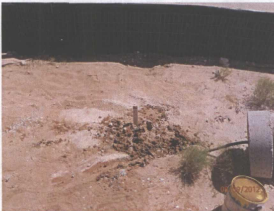
Completed plug and abandon of MW-1 8/9/12