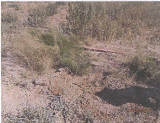
Completed plug and abandon of MW-1, facing north