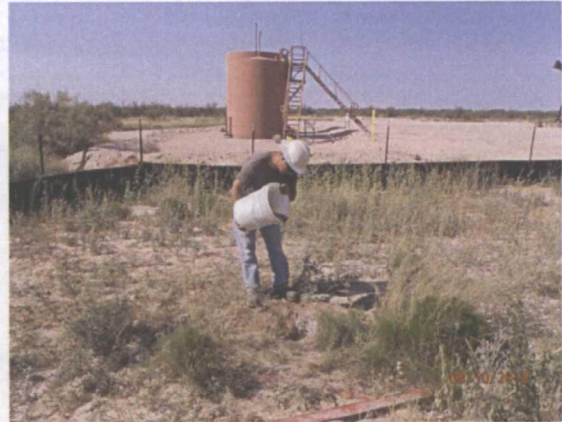
Plugging MW-1 with a 1-3% bentonite/concrete slurry with a 3 ft cap, facing south