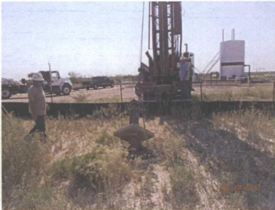
Pulling MW-1, facing east