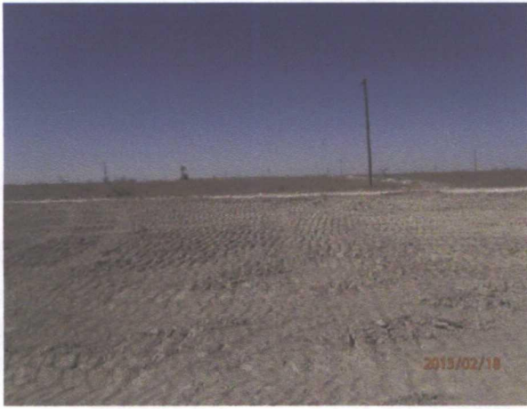
site prior to seeding, facing west 2/18/2013