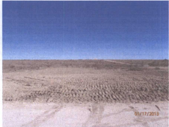
Facing East, 1/17/2013