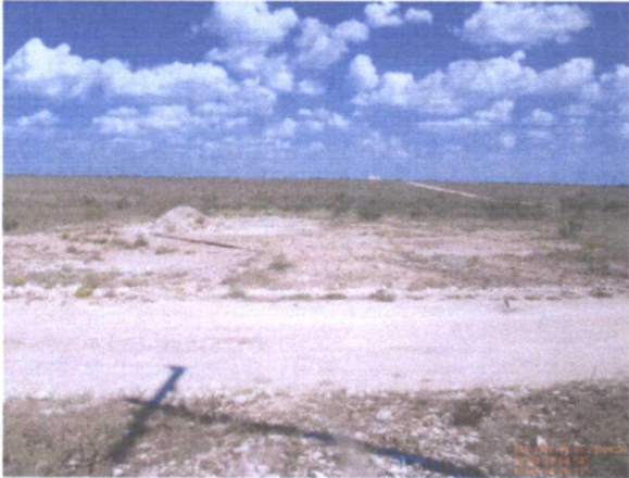
Facing East, 10/1/2012