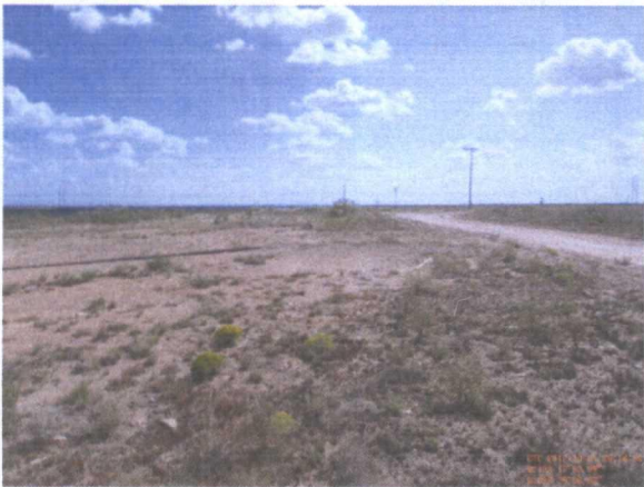
Facing South, 10/1/2012