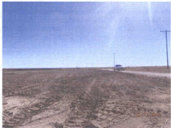
Facing South, 1/17/2013