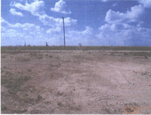
Facing West, 10/1/2012