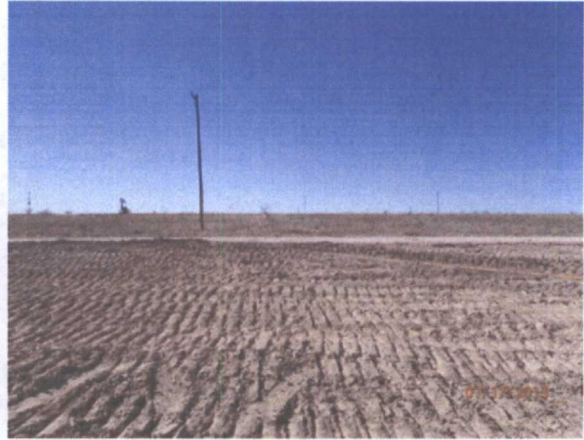
Facing West, 1/17/2013