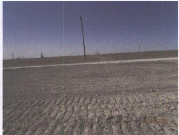
site complete, facing west 2/18/2013