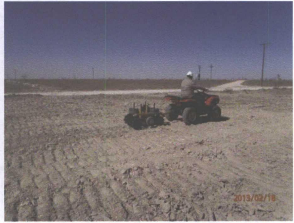
tilling the site, facing west 2/18/2013