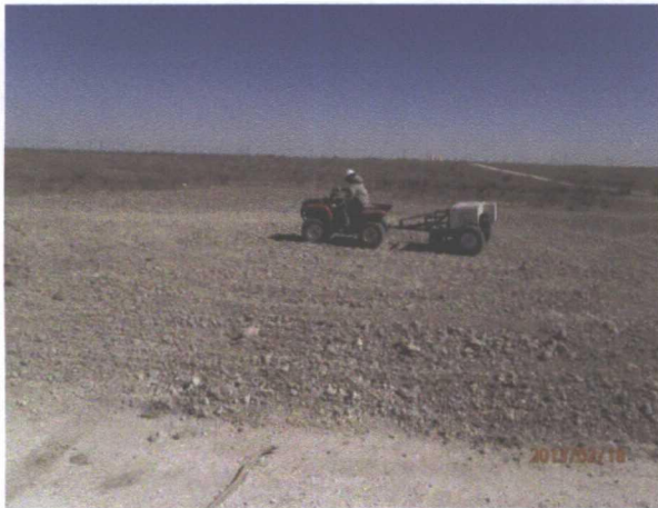
seeding the site, facing east 2/18/2013