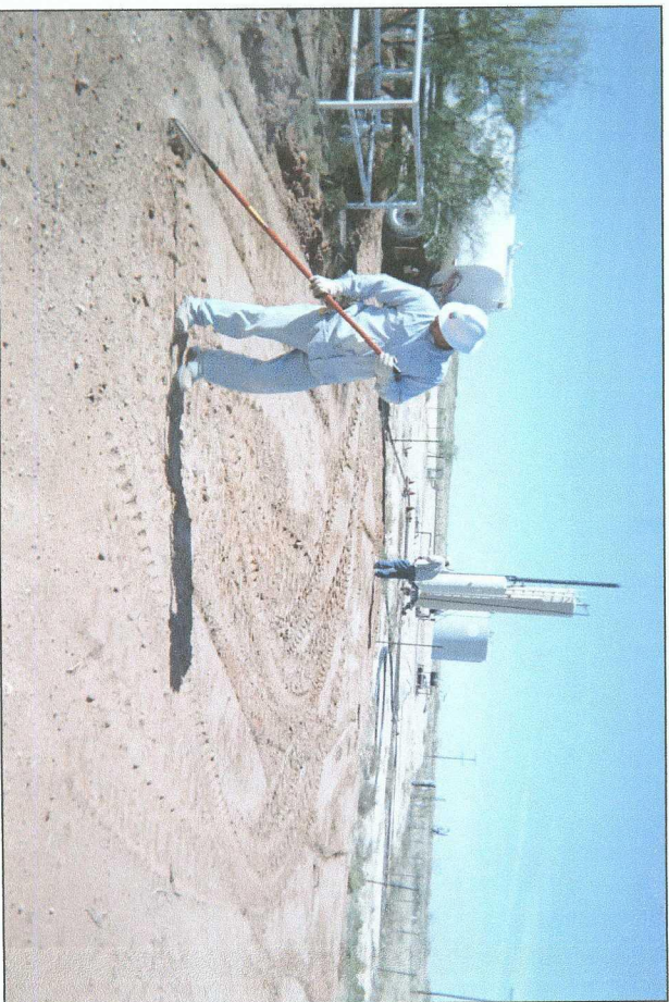
raking seed at backfilled site