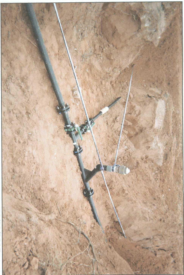
new junction 50 ft northeast of former