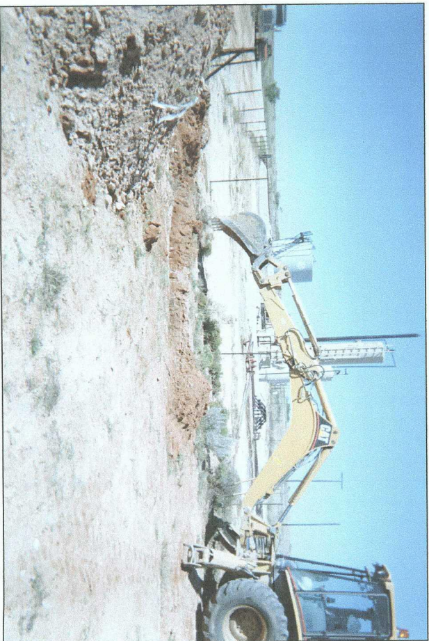
beginning delineation of former box site