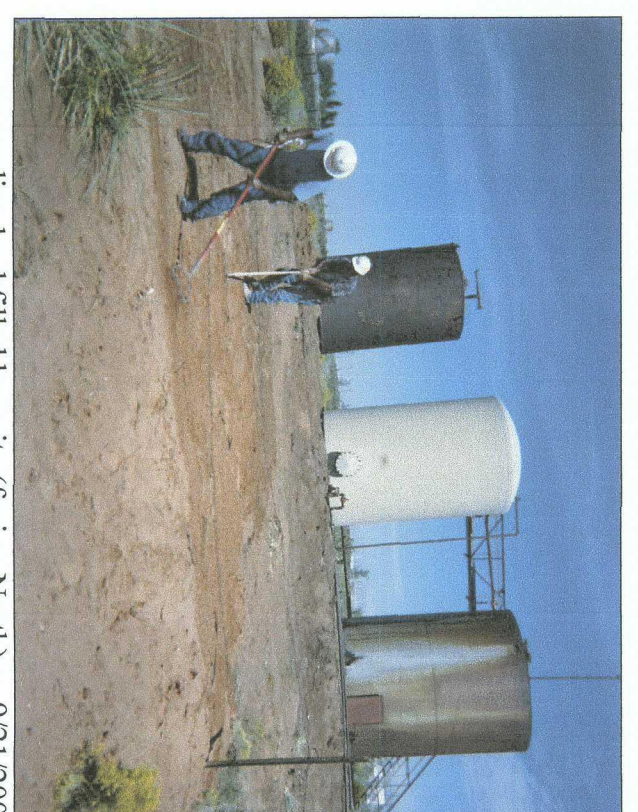
seeding backfilled box site (facing North) 9/21/2007