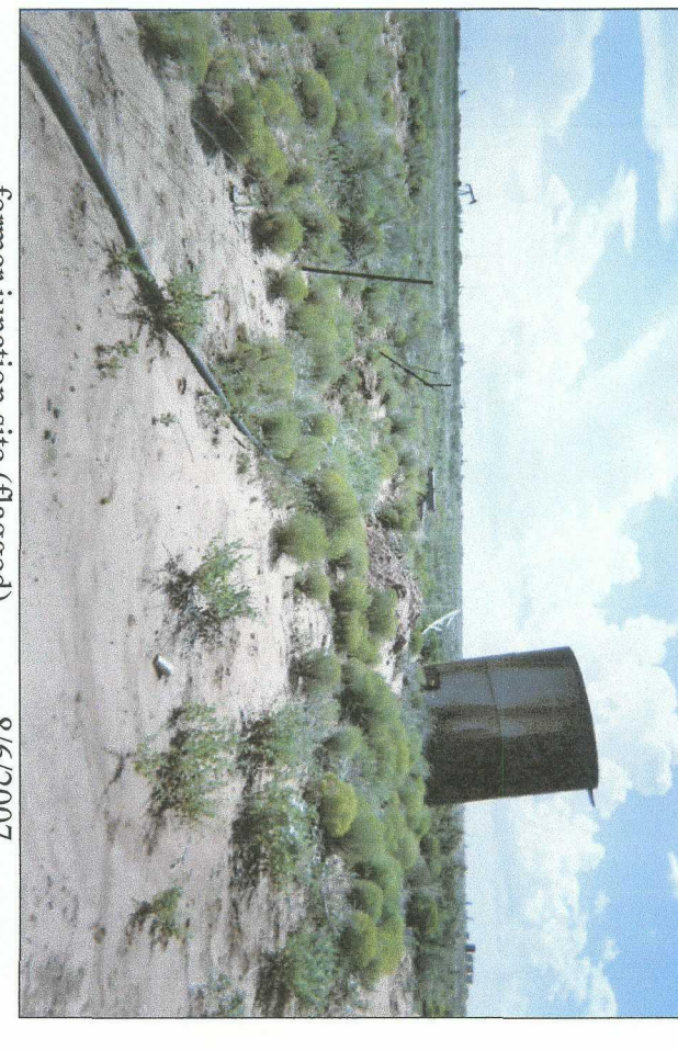
former junction site (flagged)