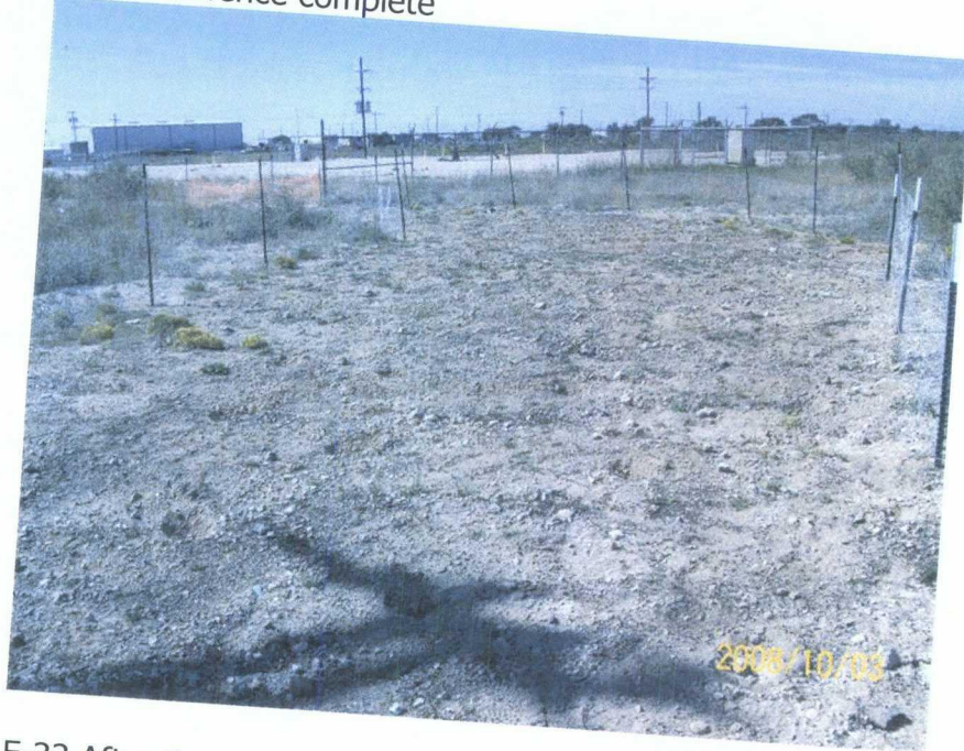
F-33 After Re-seeding