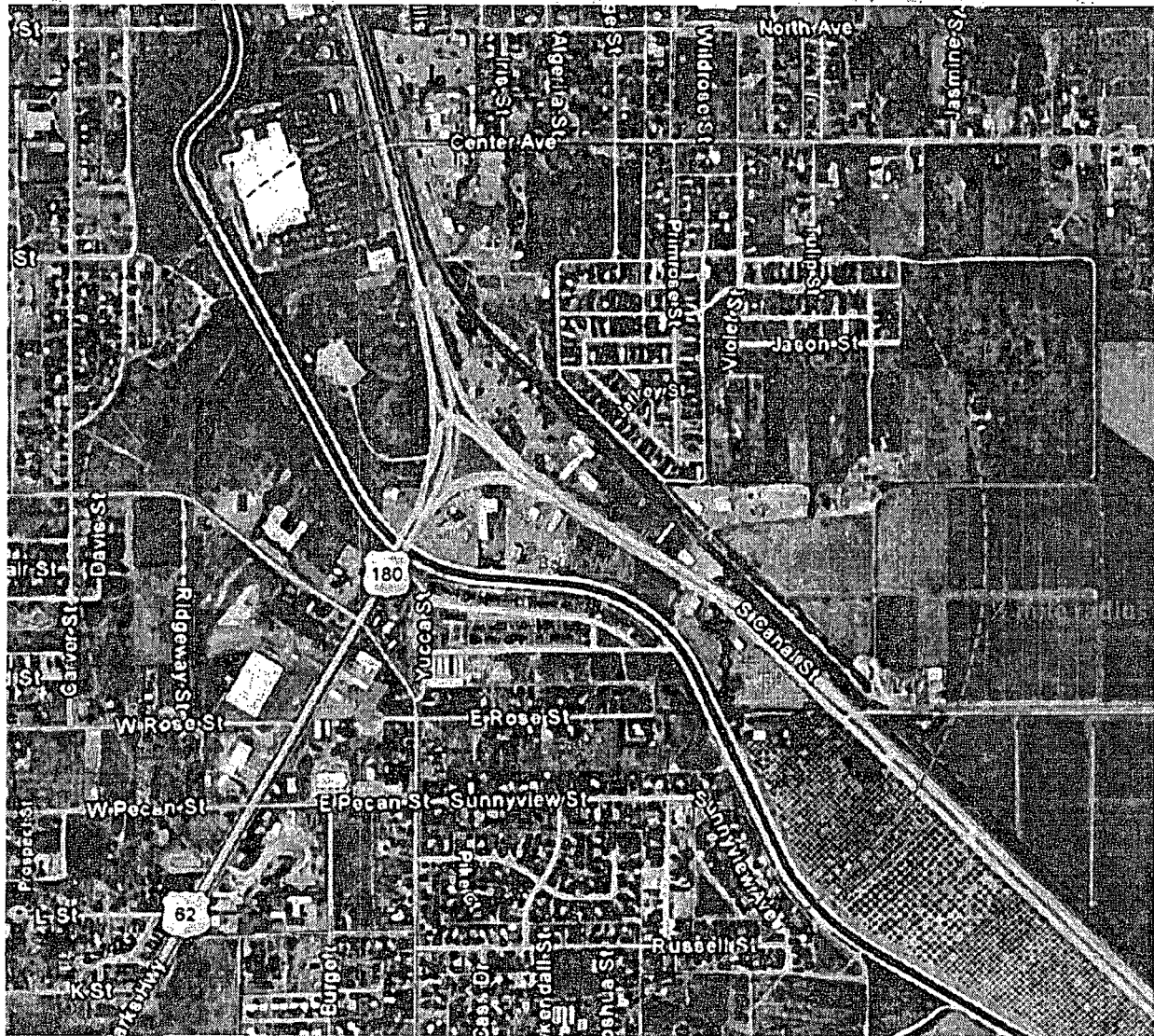
Map by: Jim Griswold, NMOCD

potential brine well collapse scenario from this facility in the interest of public health and safety.