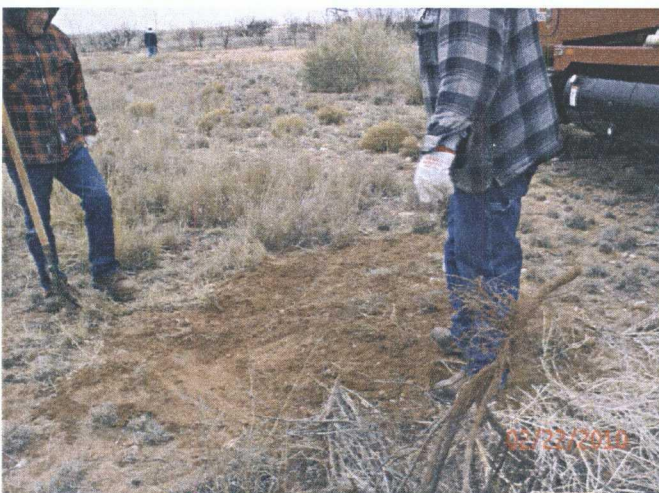
Completed plugging the site