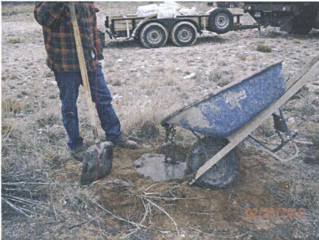
Completing the plugging with a 3' cement cap