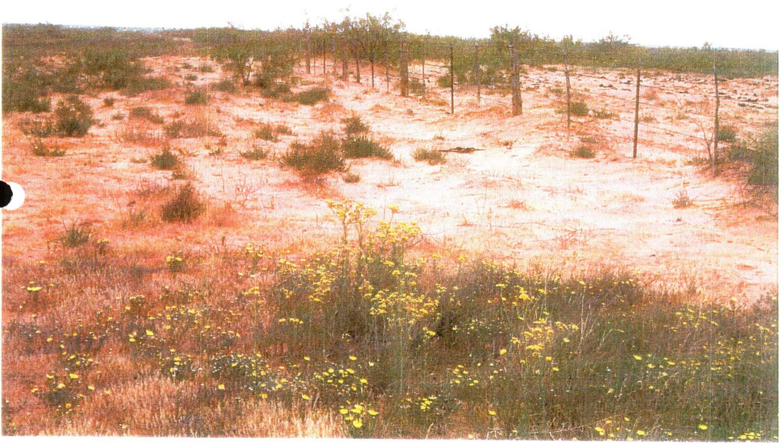
Neighboring land to closed drilling pit Wind erosion, including plastic liner material