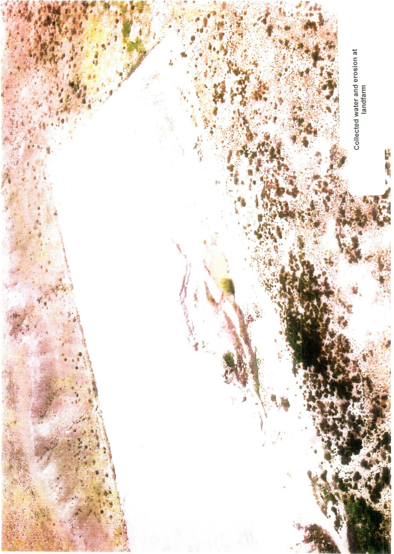
Collected water and erosion at landfarm