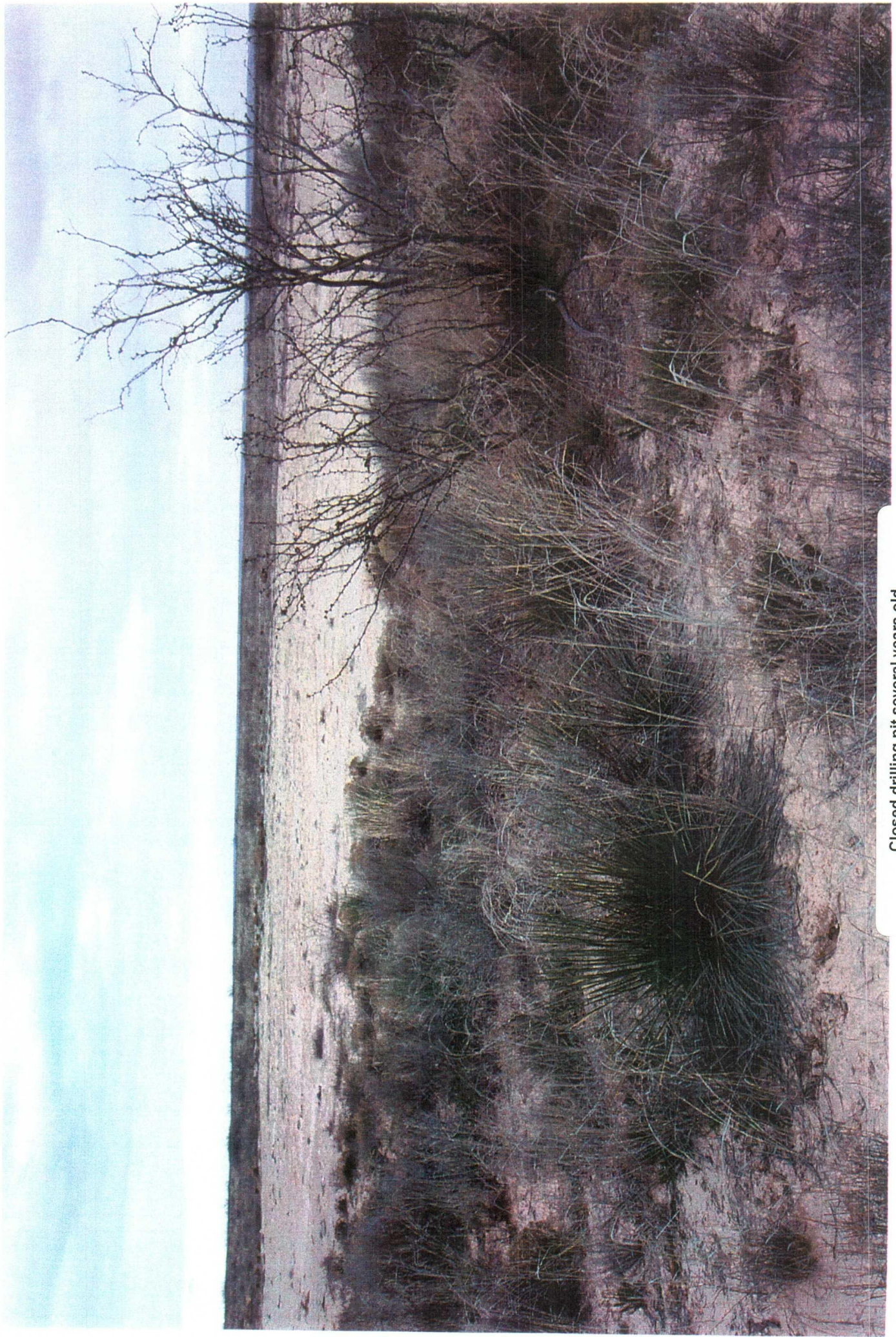
Closed drilling pit several years old. Barren wasteland showing no re-vegetation.