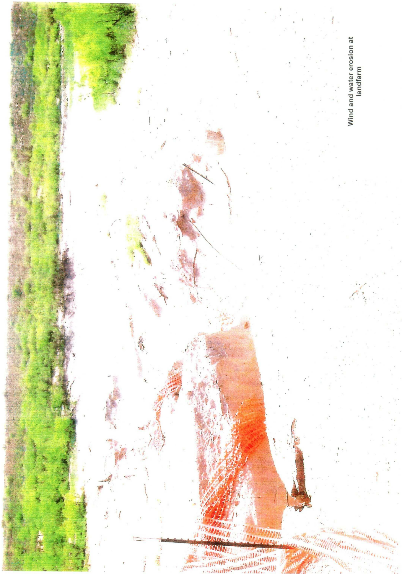
Wind and water erosion at landfarm