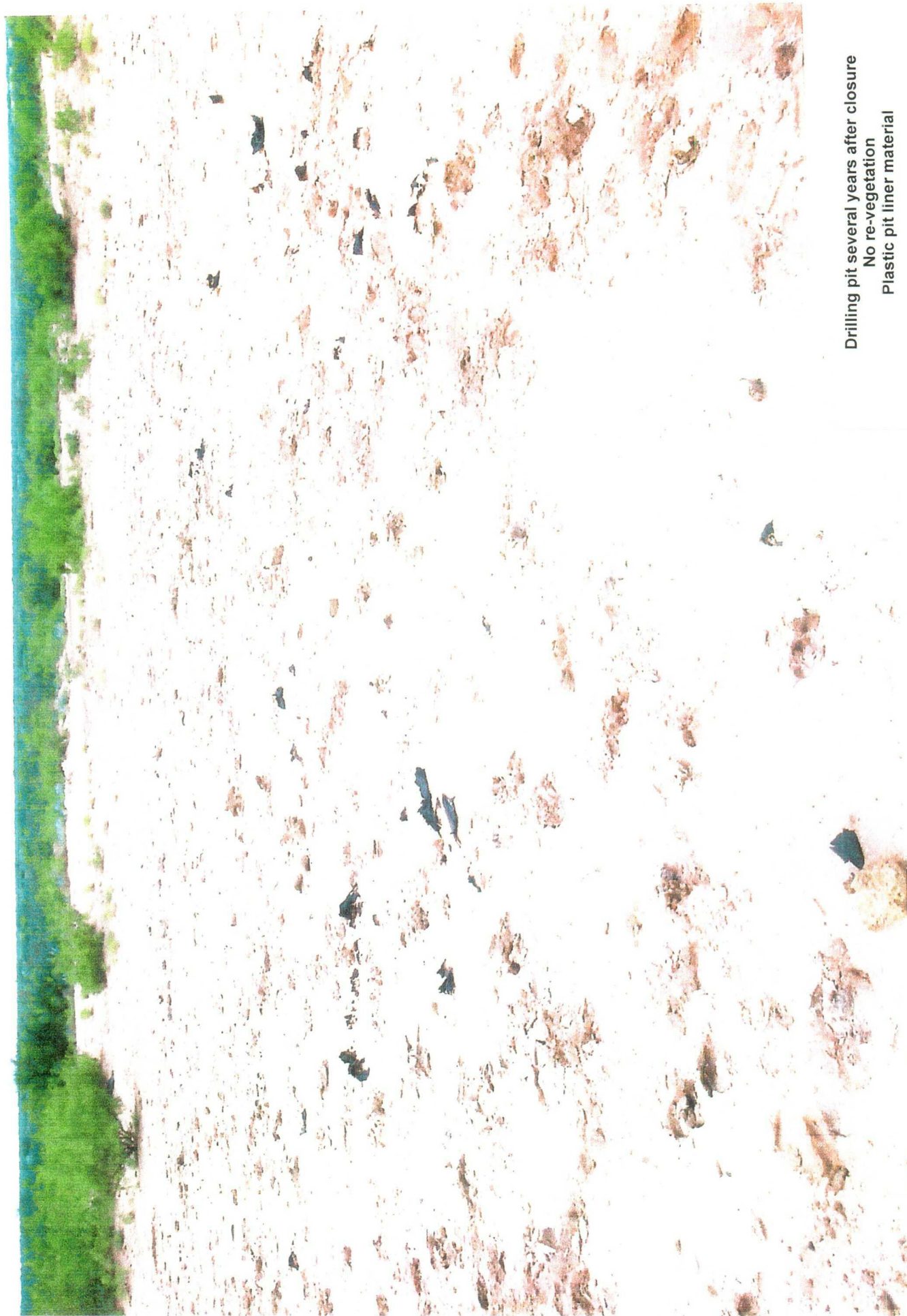
Drilling pit several years after closure No re-vegetation Plastic pit liner material