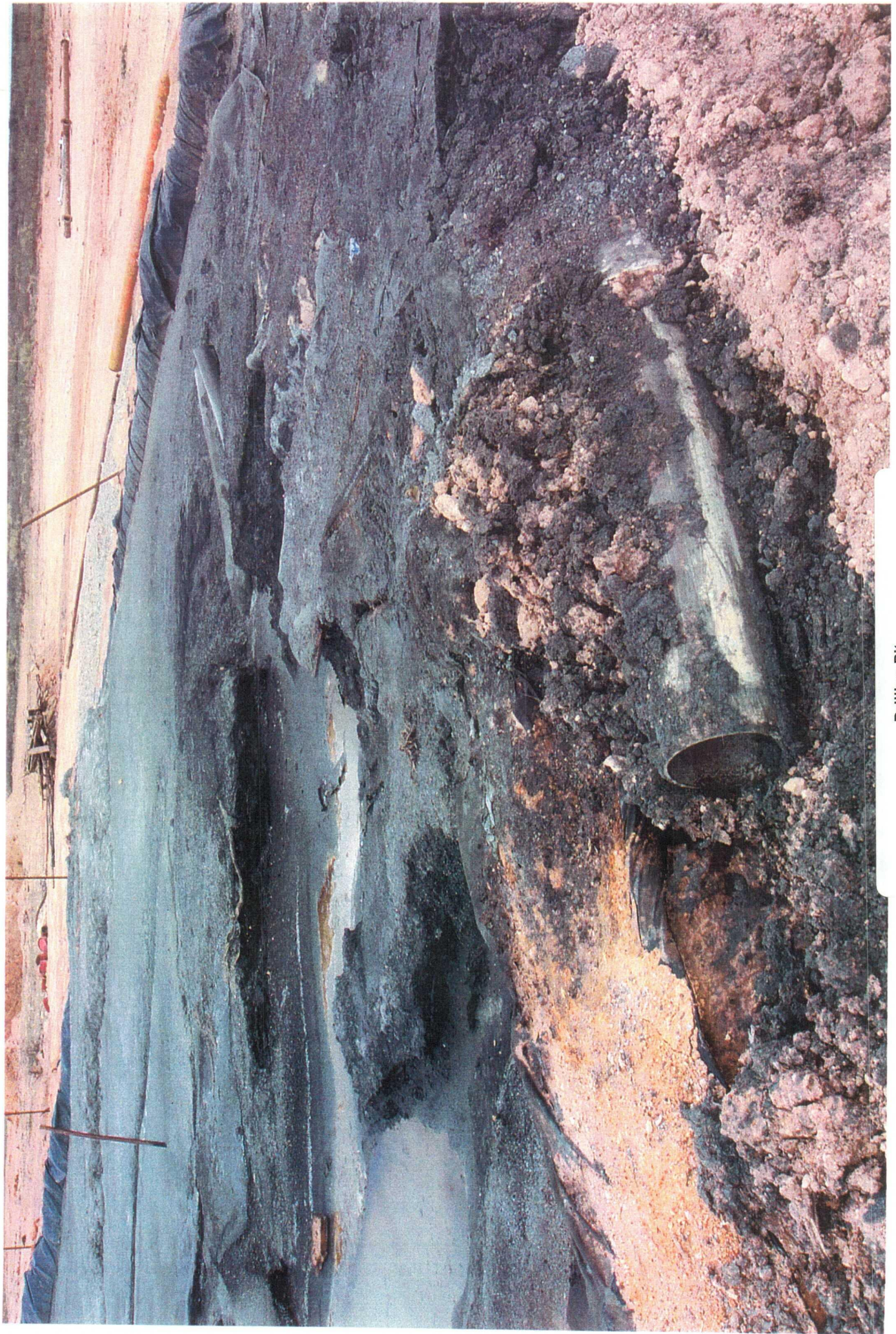
Drilling Pit Southeast New Mexico