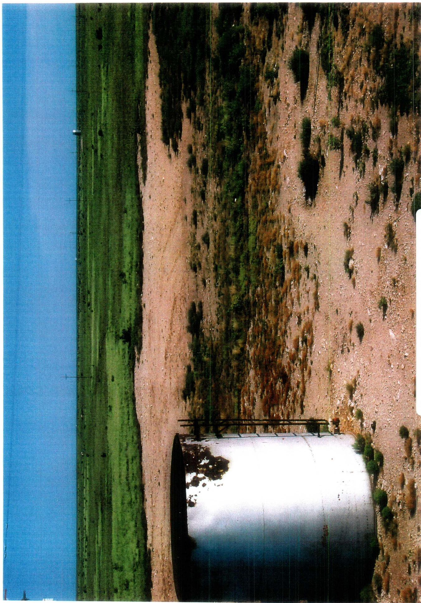
Closed drilling pit No re-vegetation