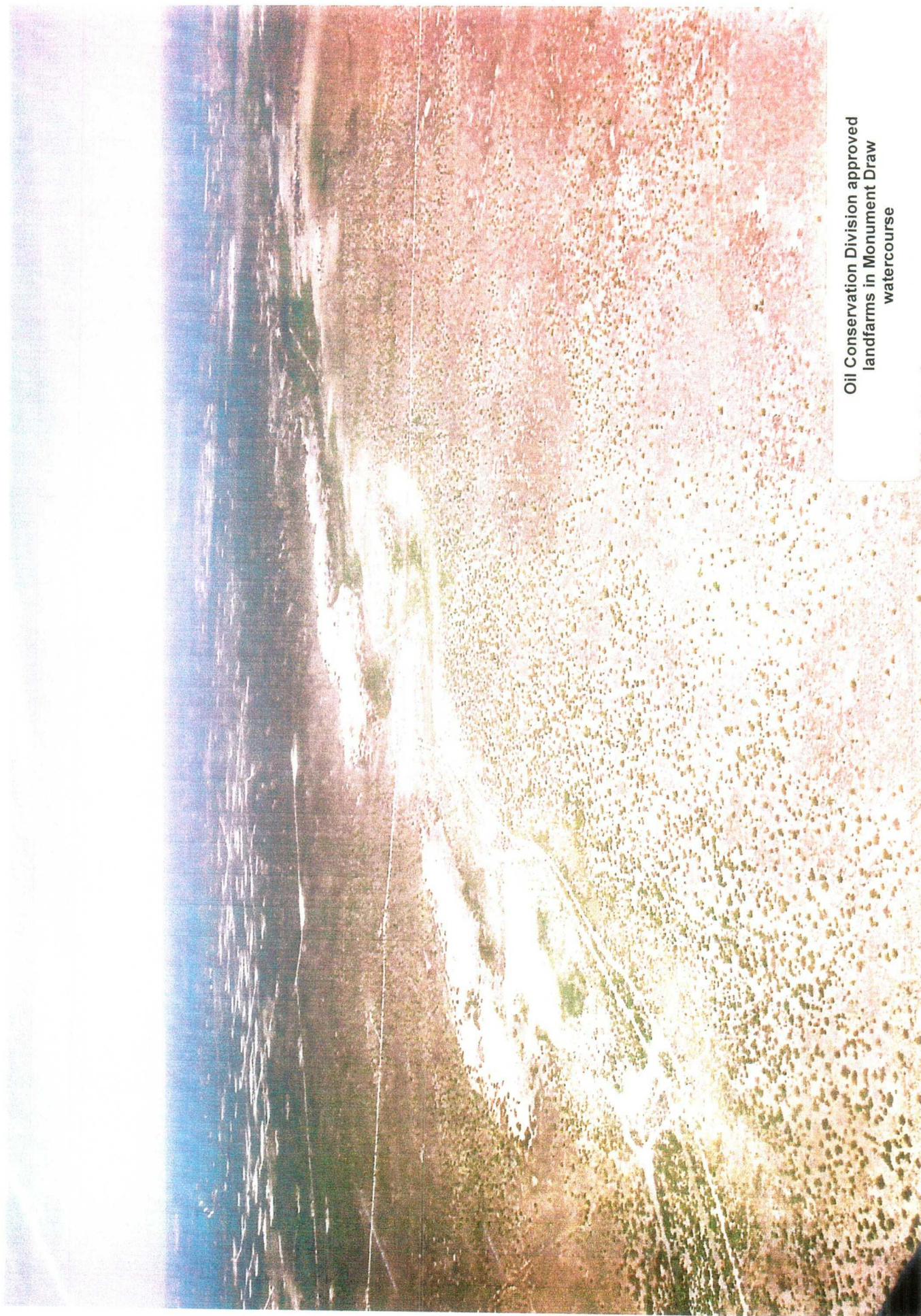
Oil Conservation Division approved landfarms in Monument Draw watercourse