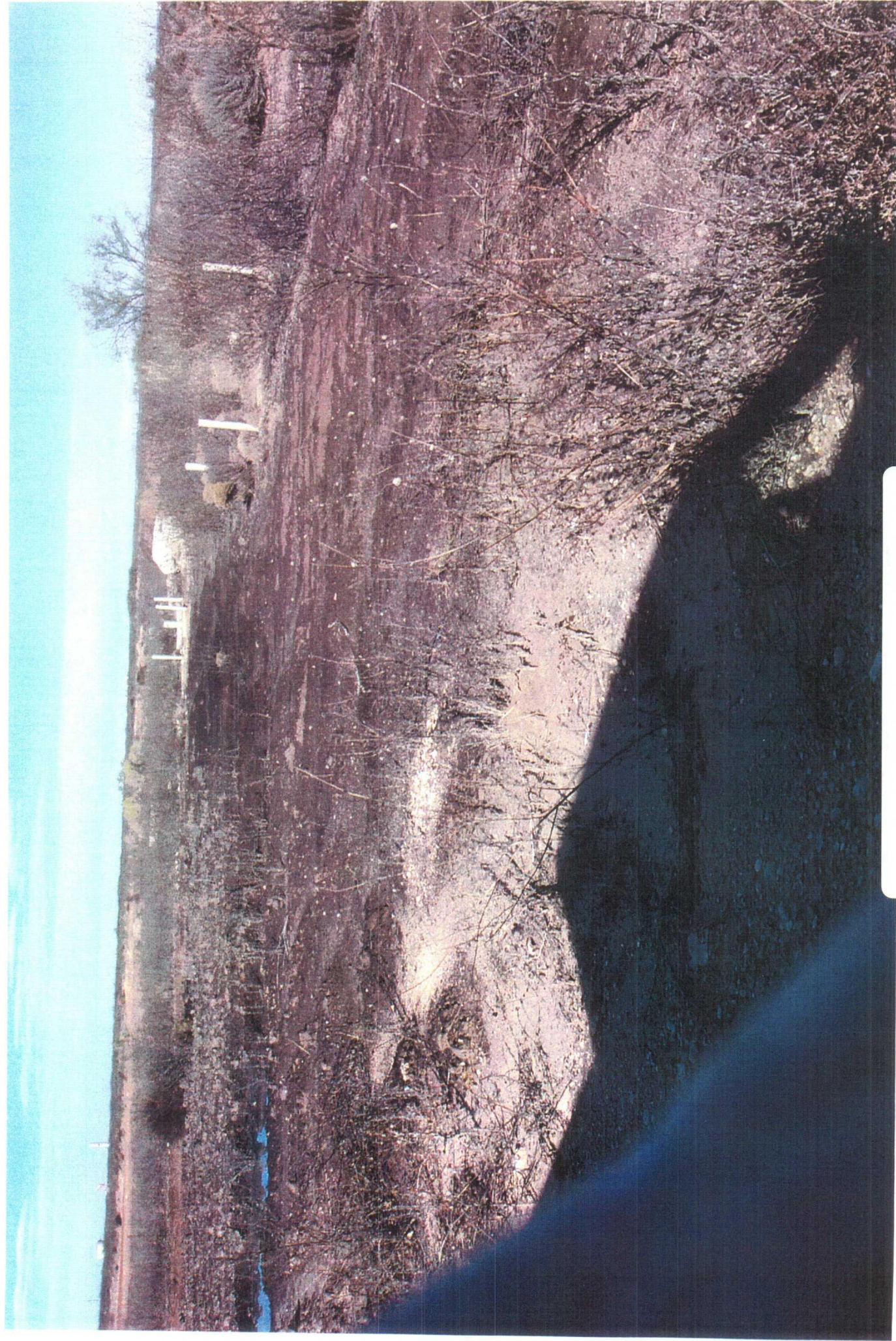
Landfarm several years old attempting to landfarm tank bottoms.