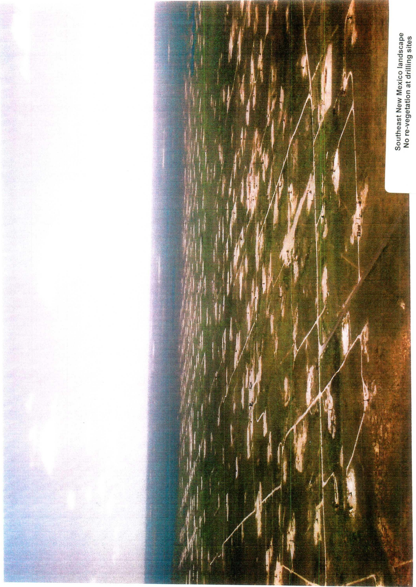
Southeast New Mexico landscape No re-vegetation at drilling sites