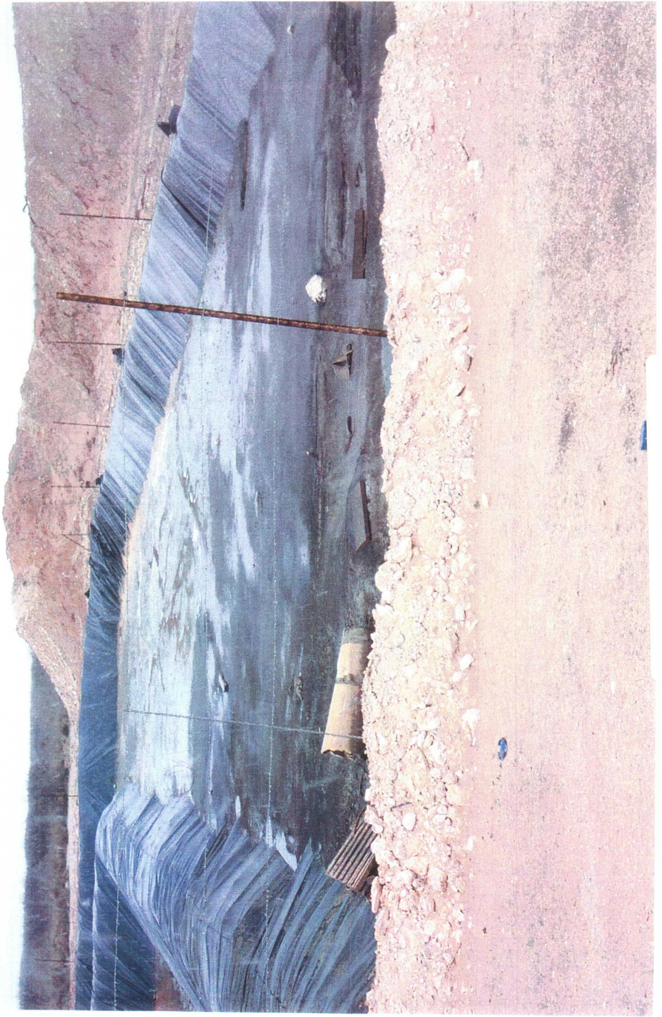
Drilling Pit Southeast New Mexico