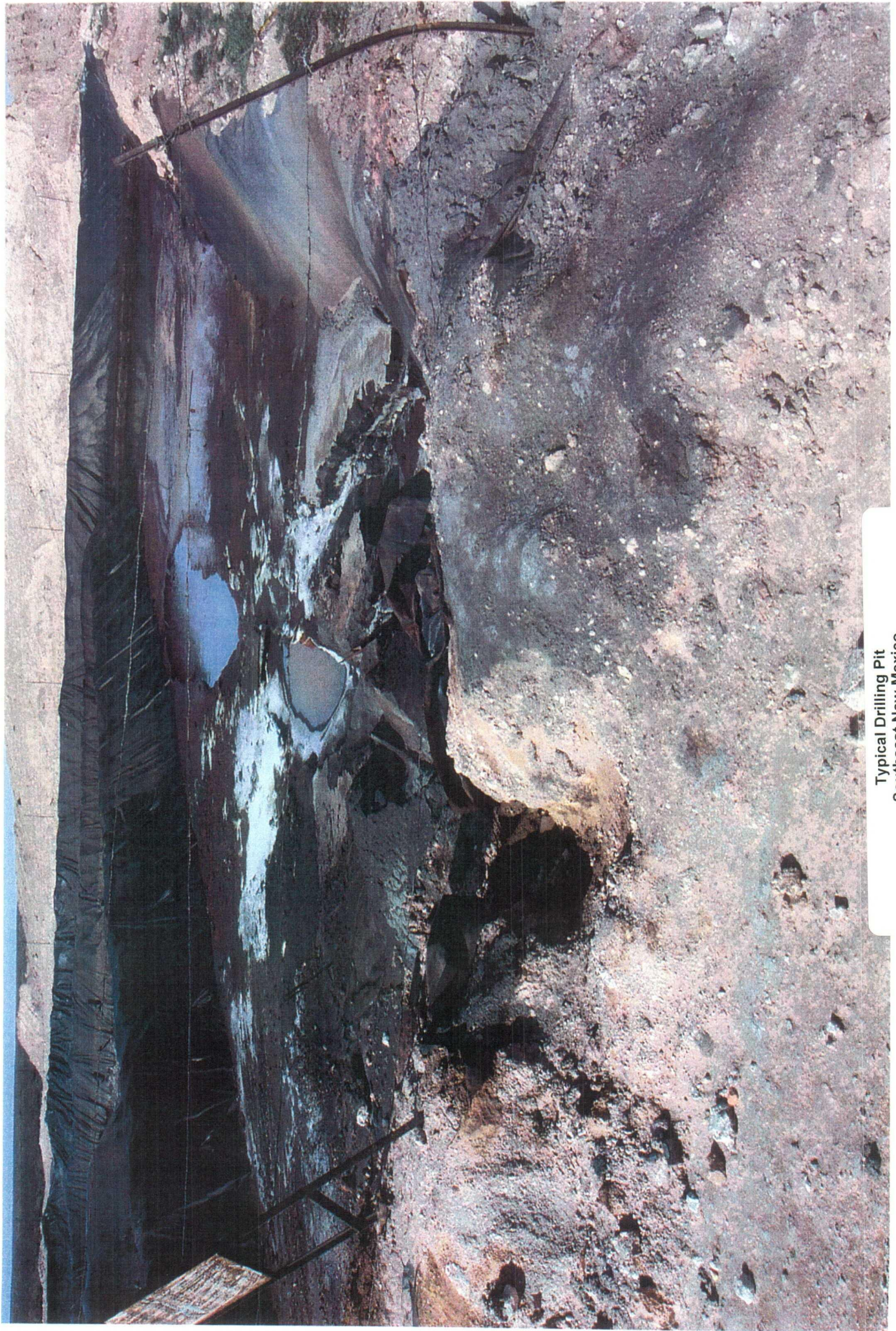
Typical Drilling Pit Southeast New Mexico