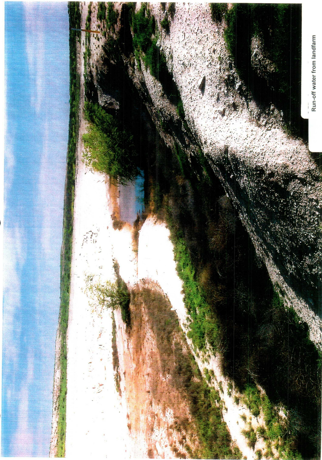
Run-off water from landfarm