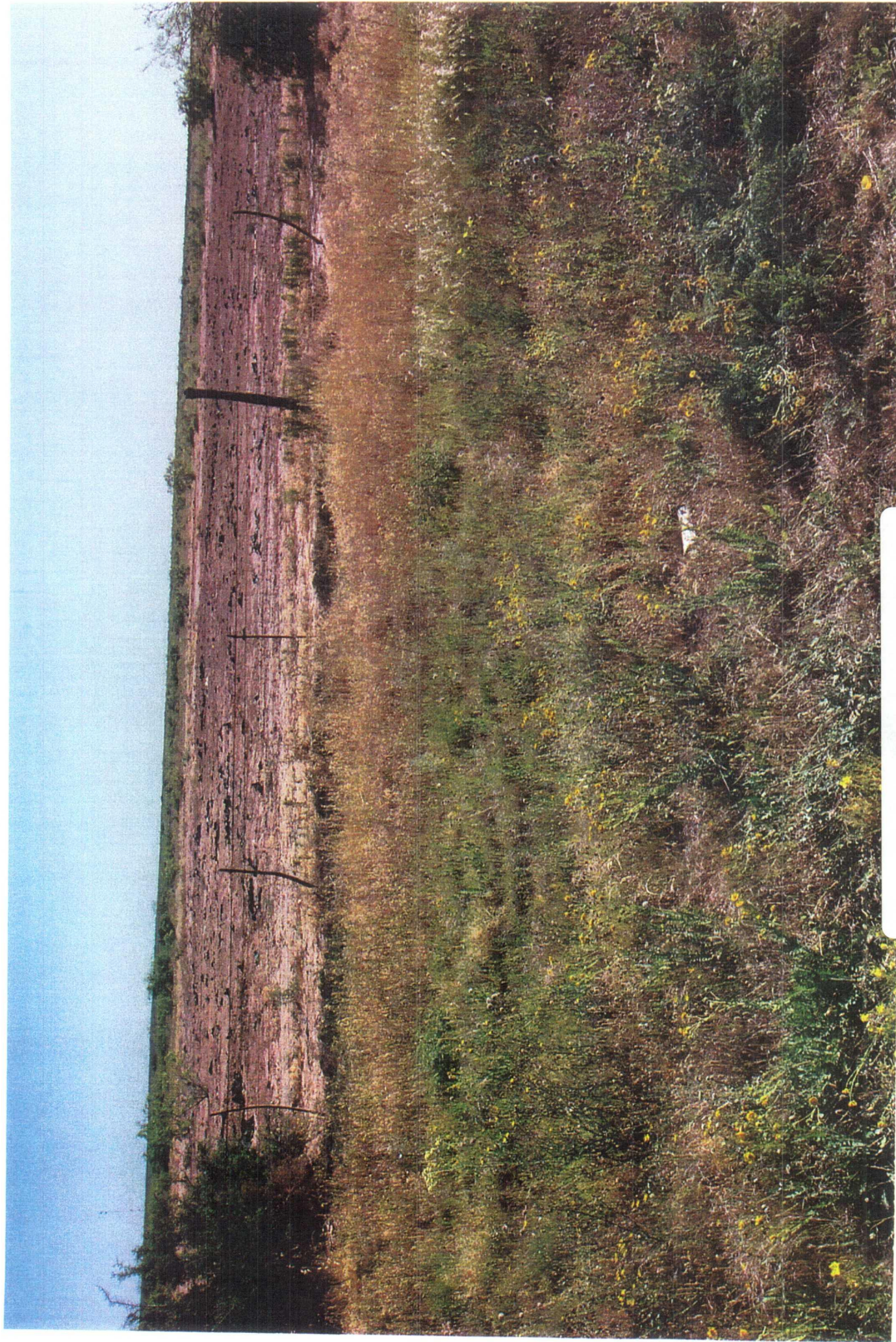
This is what landfarms will look like if allowed to take drill cuttings and non remediable waste streams.