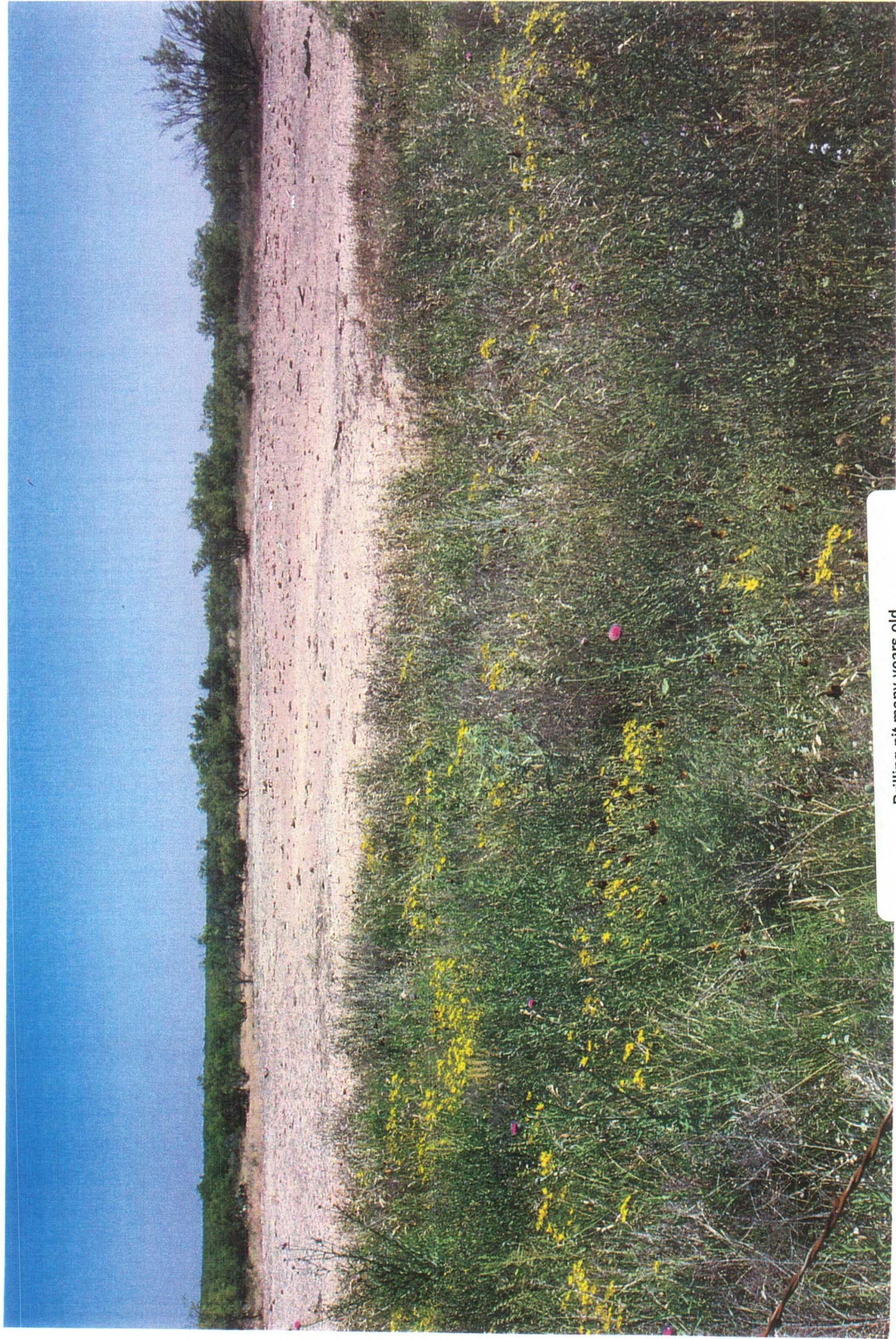
Drilling pit many years old.